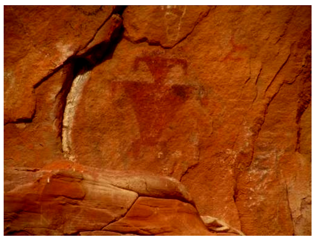
The Red Man at Red Cliffs Reserve - The pictograph is done in the Cave Valley style and is very similar to the Red Man in the Fort Pierce wash.