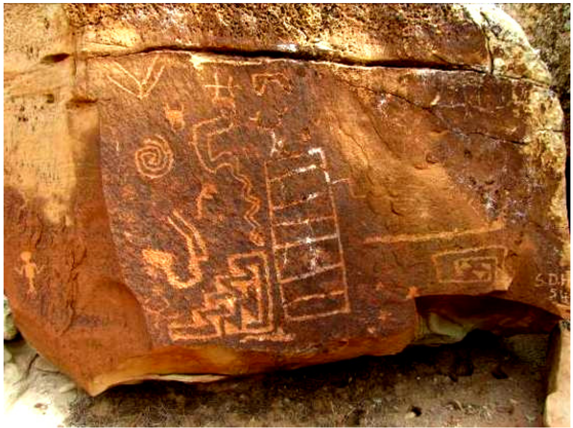
The Babylon Rock Panel – The interesting things on this panel are the two "song" or "rug" glyphs. These are usually only found on the Santa Clara River (Anasazi Ridge and Gunlock Road). The lone figure on the lower left is my favorite anthro- he's so expressive.