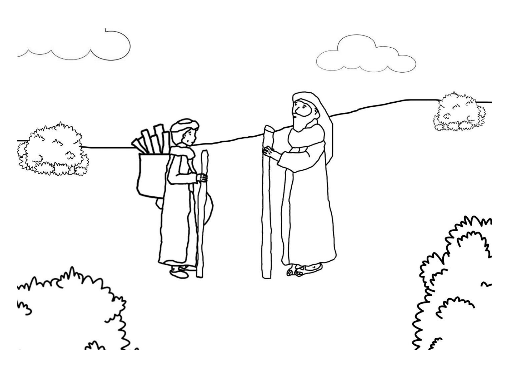
Abraham told Isaac Elohim would provide the lamb for the offering.