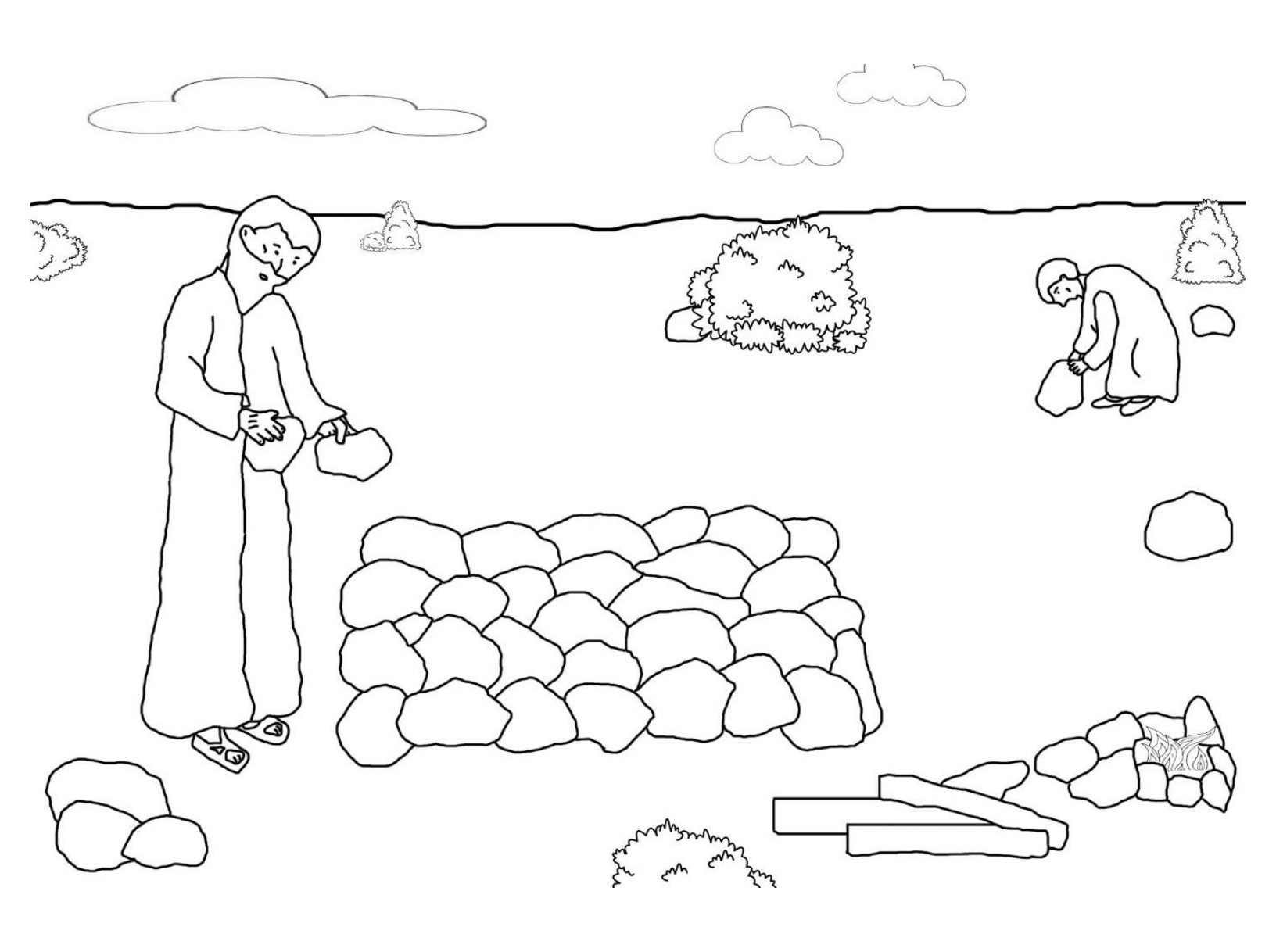
Abraham built the altar for the offering.