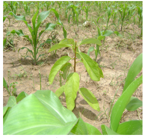
Avocado fruit tree picking