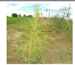
pine trees planted