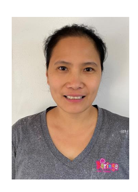
Acacia Room- Full time Studying Diploma in Early Childhood Education Commenced at Baringa in 2019