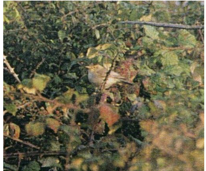
Icterine Warbler at Abbotscliffe (Dale Gibson)

It is a rare but regular passage migrant in the county, especially in autumn.