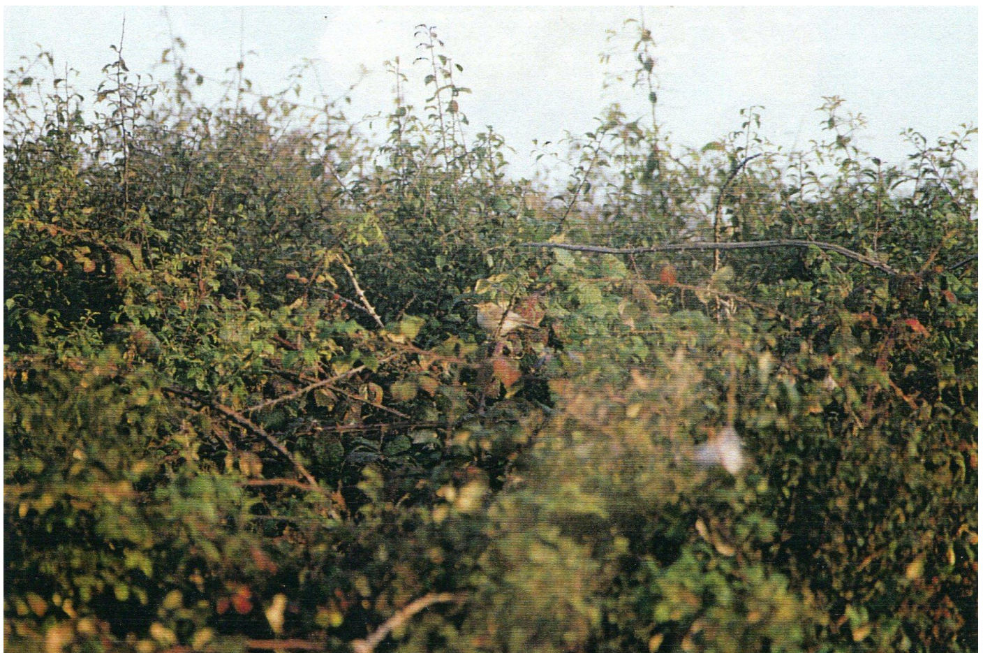
Icterine Warbler at Abbotscliffe (Dale Gibson)

White, S. & Kehoe, C. 2019. Report on scarce migrant birds in Britain in 2017. British Birds 112: 444-468.