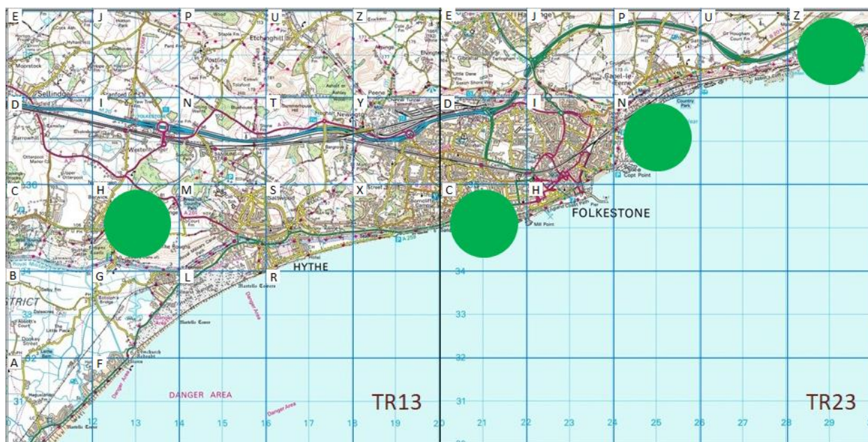
Figure 3: Distribution of all Icterine Warbler records at Folkestone and Hythe by tetrad

Figure 3 shows the location of records by tetrad.