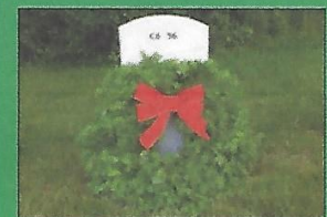
Fallen Hero Wreath Delivered to a National Cemetery