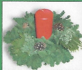
12" Candle Ring Wreath with 4" Candle