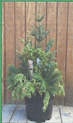
Evergreen Planter Regular 32" Supersized 42" (Outdoor)