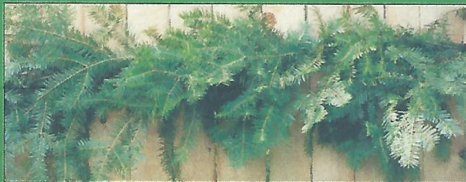
25' Balsam Fir Garland Mixed Cedar & Noble also Available