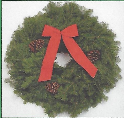
Single Face Balsam Outdoor Wreath 26", 36", 48", 60", 72" Double Face Balsam 36"