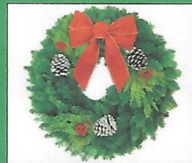
24" Boxed Decorator Wreath