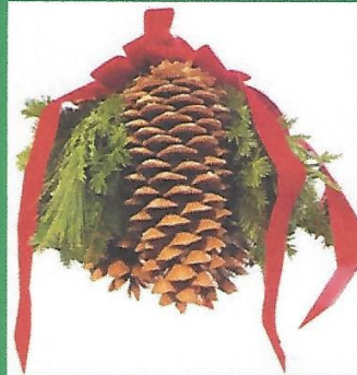
12" Pinecone Chandelier Hanging Decorator