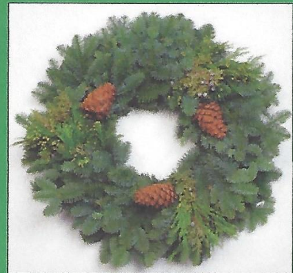
Noble Fir Mixed Wreath 20", 36" & 48" Indoor/Outdoor