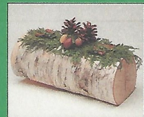
Holiday Yule Log 12"