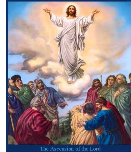
The Ascension of the Lord

https://www.facebook.com/groups/1611071422456185/