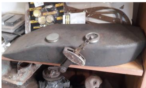
Veteran Motorcycle Flat Tank