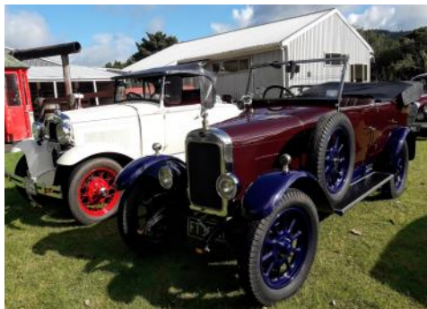
1928 Clyno & Model A

The morning tea was held at the old Parakao General Store which is now a cafe. This, for me, was the high point of the tour, as the owners have created a vehicle display out the back. Curiously one of the vehicles displayed was a 1937 Plymouth formerly owned by the late Derek Winterbottom and subsequently the Shaw Vehicle Sanctuary. Other vehicles included Chev Fours and Sixes, a '34 or '35 Hudson, a '35 or '36 Dodge and Model A's. One highlight was a complete Flat Tank motorcycle petrol tank and gear lever, probably pre 1930.