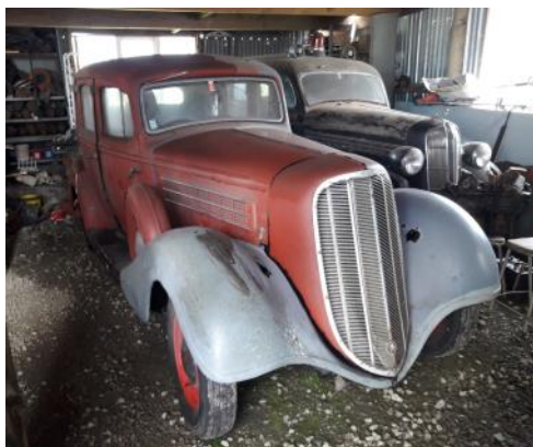
'34/'35 Hudson and '35/'36 Dodge

The instructions then split in two with a metalled route and an all sealed option for those that didn't want metal. Both routes skirted Lake Omapere and then went to Okaihau for lunch. After lunch the people who chose the metalled route travelling into the Waihou Valley, Otangaroa and Fern Flat areas before going through Peria and Oruru to the finish at Taipa. The sealed route went straight up Highway 10, now the main road to Kaitaia, following the closure of the Mangamuka road.