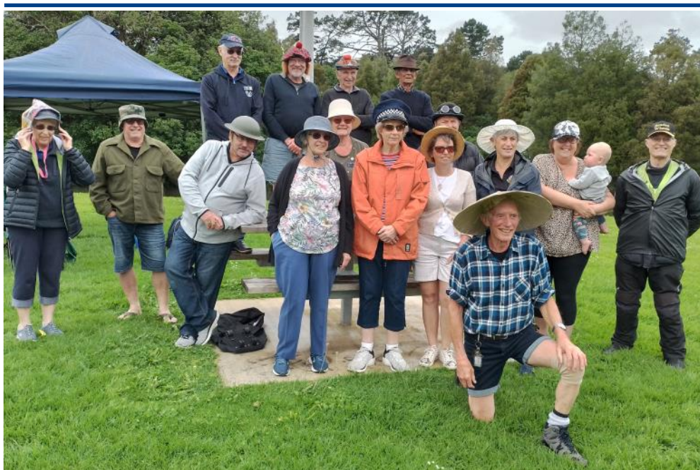
Hat Parade (above) and how many people can get under one gazebo when it pours? (below)