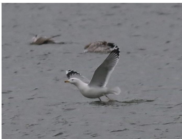
Adult Caspian Gull at Nickolls Quarry

An account of the first area record is given below.