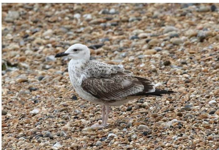
First-winter Caspian Gull at Sandgate (Chris Powell)