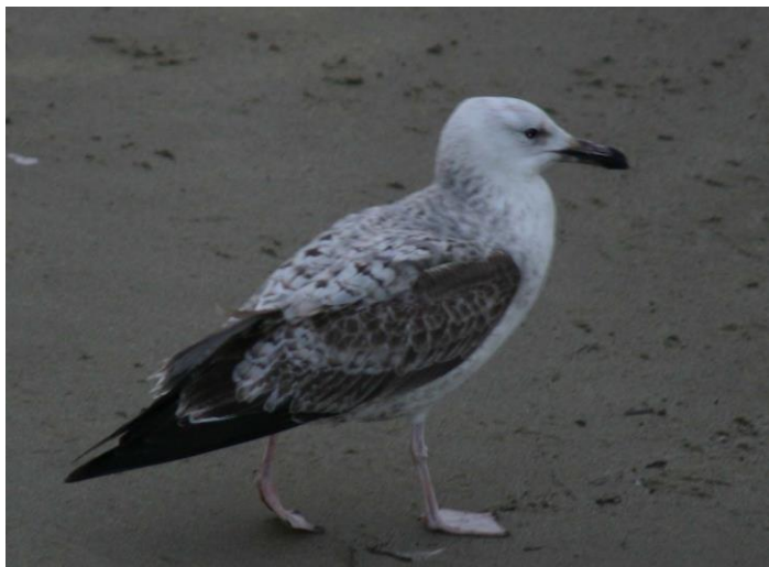
First-winter Caspian Gull at Folkestone Harbour (Ian Roberts)