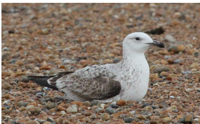
First-winter Caspian Gull at Hythe (Ian Roberts)