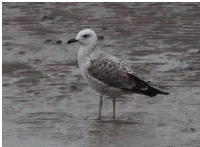
First-winter Caspian Gull at Folkestone Harbour (Ian Roberts)