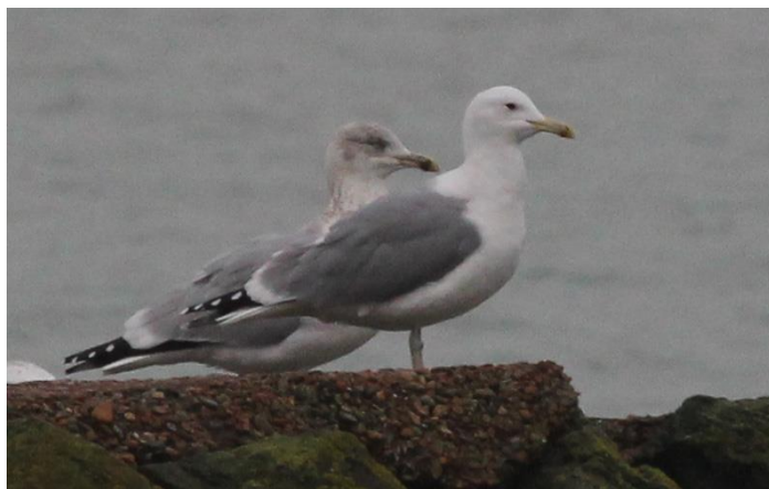
Adult Caspian Gull at Folkestone Harbour (Ian Roberts)