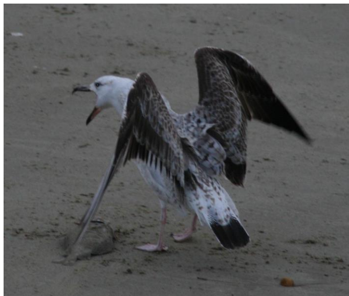
Caspian Gull at Folkestone Harbour

In Kent it is a scarce but increasingly frequent visitor, especially in the Dungeness area (KOS 2020).