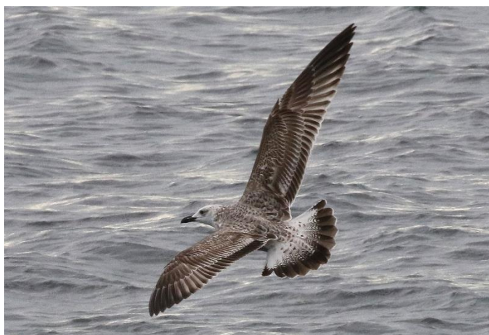
First-winter Caspian Gull at Sandgate (Chris Powell)