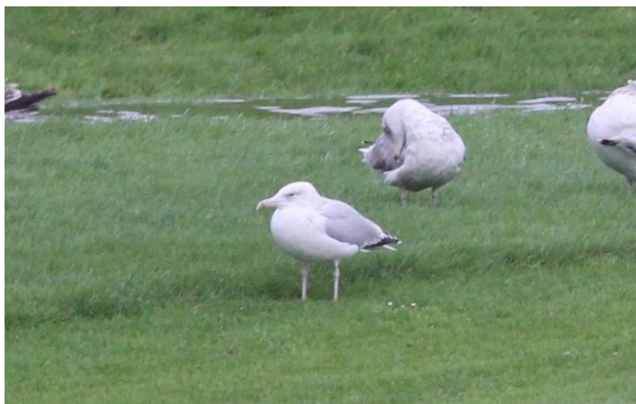
Third-winter Caspian Gull at Hythe Imperial golf course (Ian Roberts)