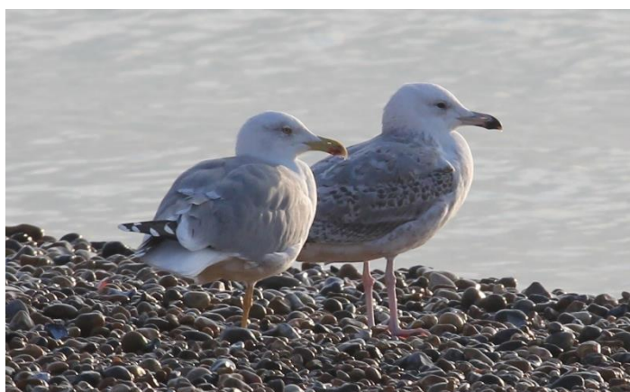
Second-winter Caspian Gull with adult Yellow-legged Gull at Sandgate (Ian Roberts)