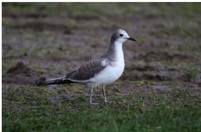
Sabine's Gull at Port Lympne (Ian Roberts)