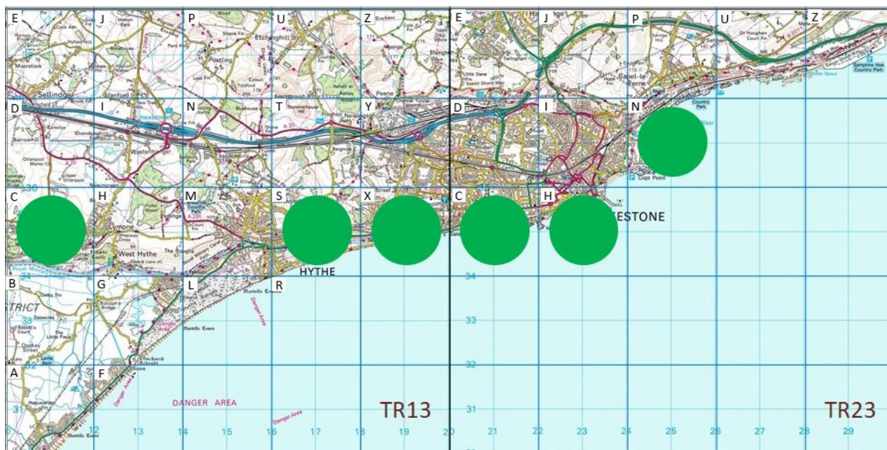
Figure 3: Distribution of all Sabine's Gull records at Folkestone and Hythe by tetrad

Figure 3 shows the distribution of records by tetrad.