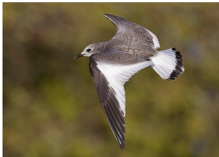
Sabine's Gull at Port Lympne (Steve Ashton)