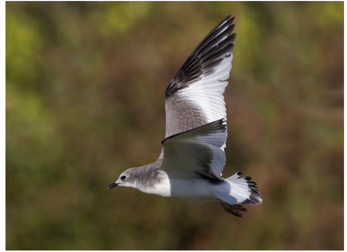
Sabine's Gull at Port Lympne

Breeds in Greenland and eastern Canada, then migrates south-east across the open Atlantic Ocean towards Iberia and western Morocco before turning south and heading into the South Atlantic to winter off southern Africa. Present in European inshore waters mainly after westerly gales and in Britain occurs mainly in the Western Approaches, chiefly mid-August to mid-November. Migrates north in May but with far fewer in European inshore waters in spring. Also breeds in Alaska and Siberia, with these birds wintering in the Pacific Ocean (Snow & Perrins 1998).