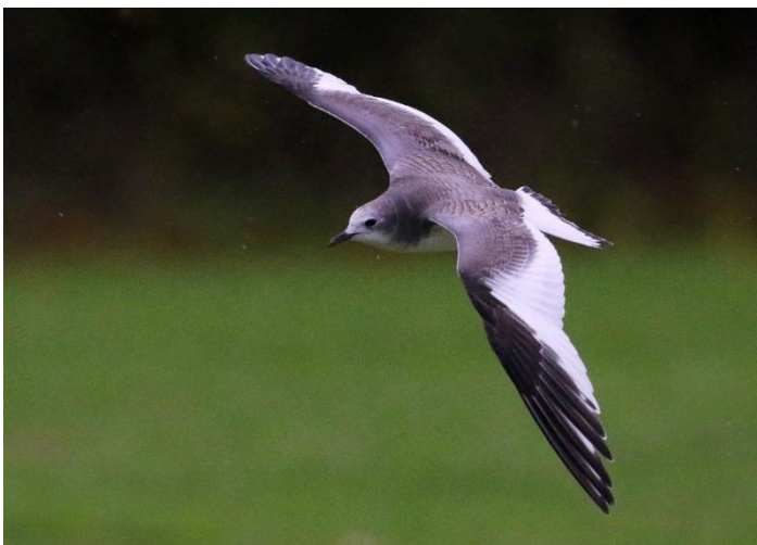
Sabine's Gull at Port Lympne (Glenn Honey)