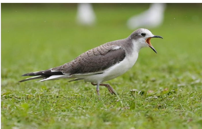
Sabine's Gull at Port Lympne (Ashley Howe)