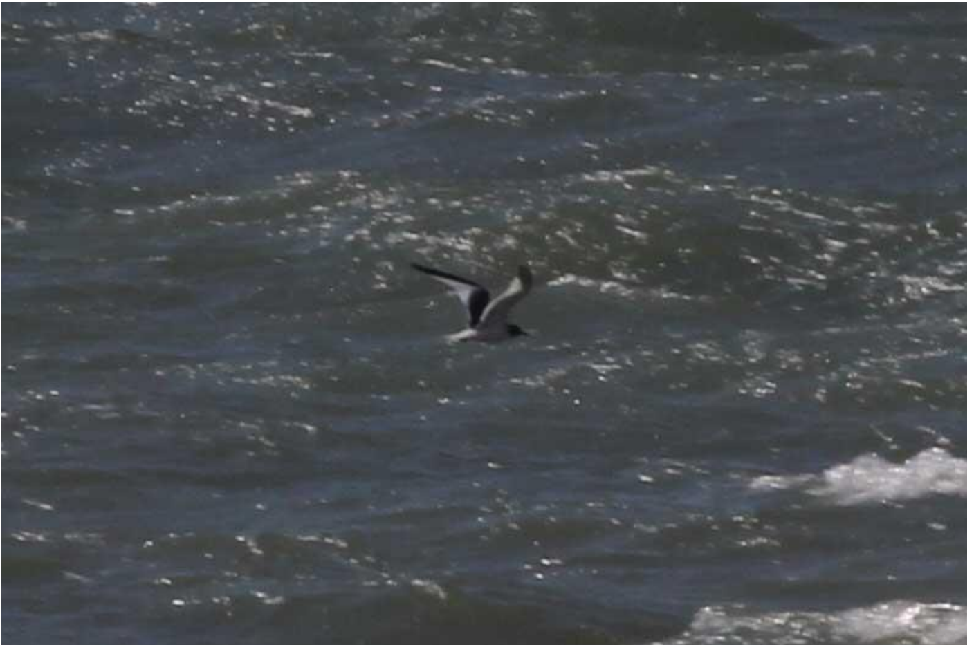
Sabine's Gull at Folkestone Beach

The tetrad map images were produced from the Ordnance Survey Get-a-map service and are reproduced with kind permission of Ordnance Survey .