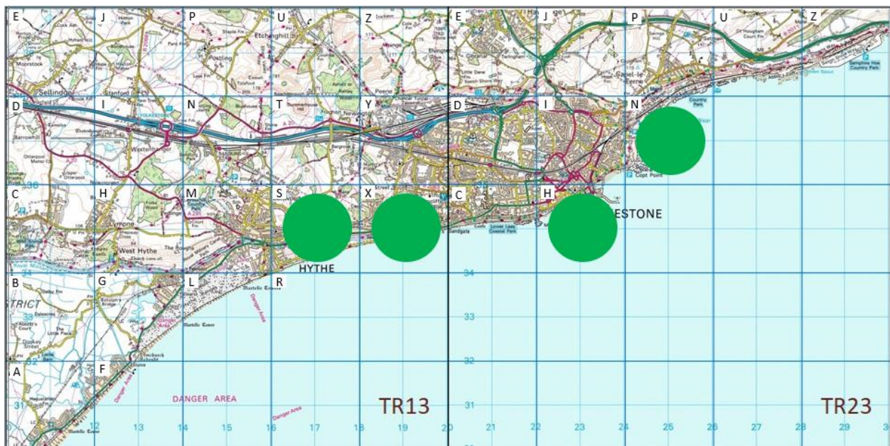
Figure 3: Distribution of all Sabine's Gull records at Folkestone and Hythe by tetrad

Figure 3 shows the distribution of records by tetrad.