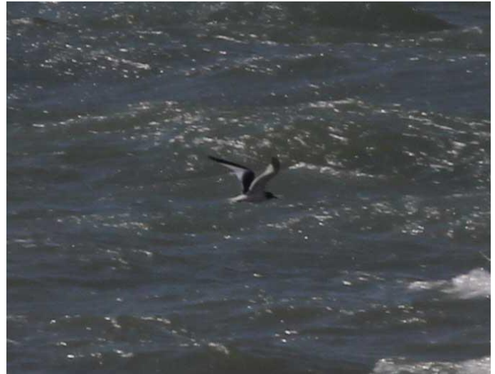
Sabine's Gull at Copt Point (Ian Roberts)

Breeds in Greenland and eastern Canada, then migrates south-east across the open Atlantic Ocean towards Iberia and western Morocco before turning south and heading into the South Atlantic to winter off southern Africa. Present in European inshore waters mainly after westerly gales and in Britain occurs mainly in the Western Approaches, chiefly mid-August to mid-November. Migrates north in May but with far fewer in European inshore waters in spring. Also breeds in Alaska and Siberia, with these birds wintering in the Pacific Ocean (Snow & Perrins, 1998).