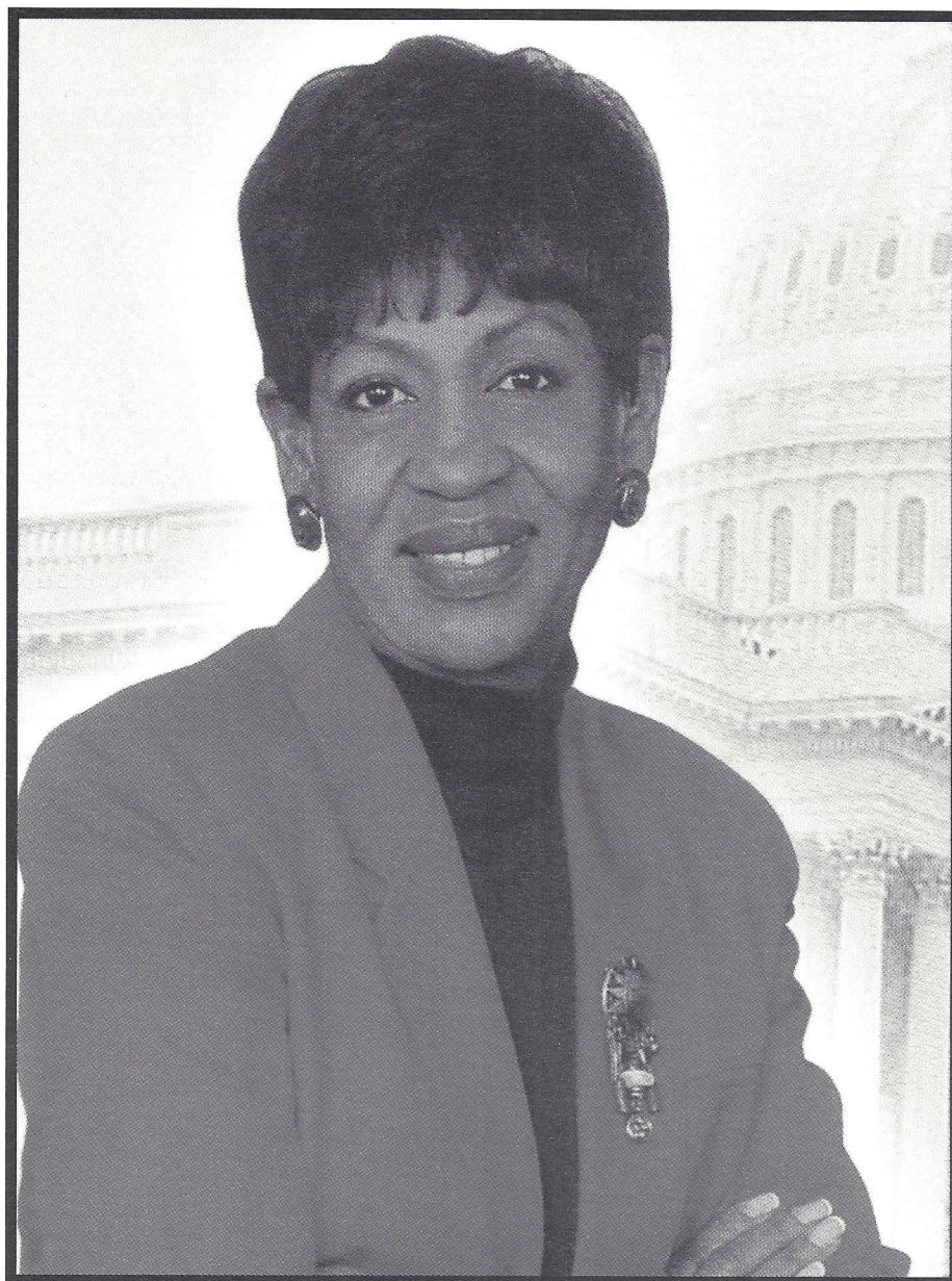
Hon. Maxine Waters Member, U.S. House of Representatives 100th Woman