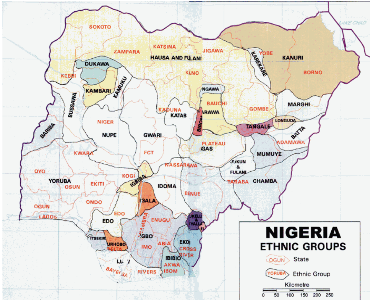
Map 2: A map of Nigeria showing the locations of some of its ethnic groups