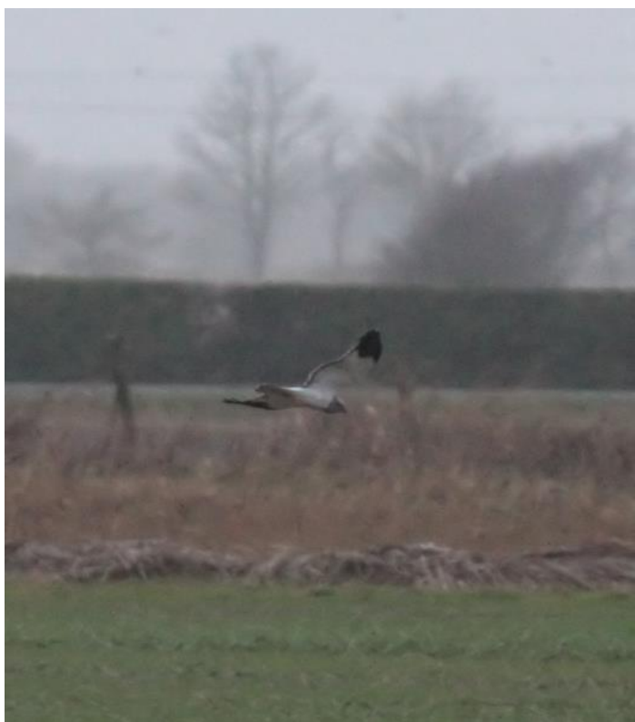
Hen Harrier at Botolph's Bridge