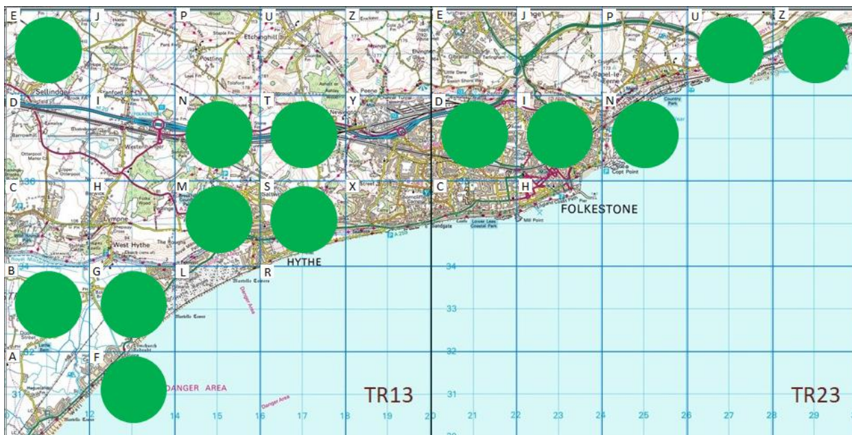
Figure 3: Distribution of all Hen Harrier records at Folkestone and Hythe by tetrad

Figure 3 shows the distribution of records by tetrad.