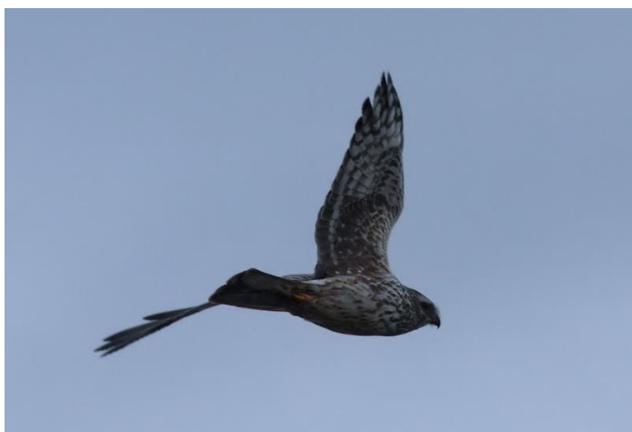
Hen Harrier at Botolph's Bridge

The tetrad map images were produced from the Ordnance Survey Get-a-map service and are reproduced with kind permission of Ordnance Survey .