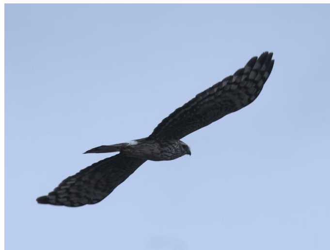
Hen Harrier at Botolph's Bridge