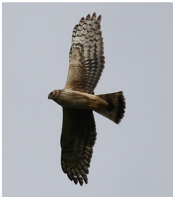
Hen Harrier at Botolph's Bridge