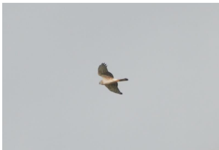
Hen Harrier at Beachborough