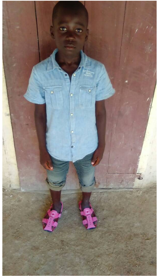
Above: Two of the children who received a pair of "Shoes that Grow." Thank you for your generous donations to make this outreach happen.