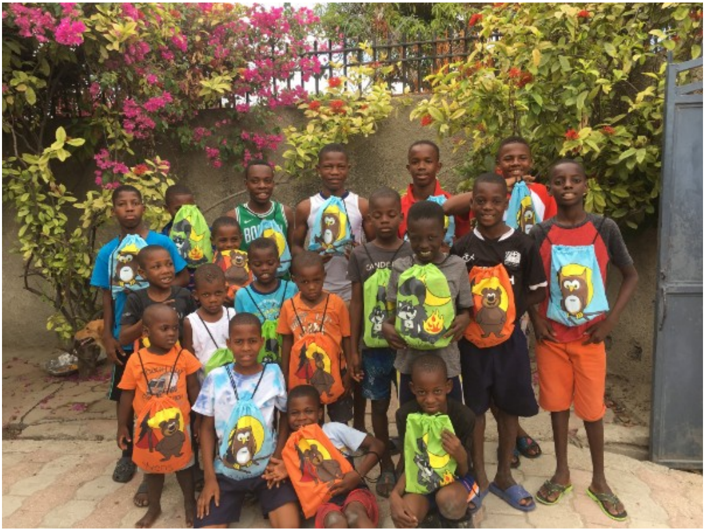
The L&G Boys with their VBS bags donated by Grace Community Church.