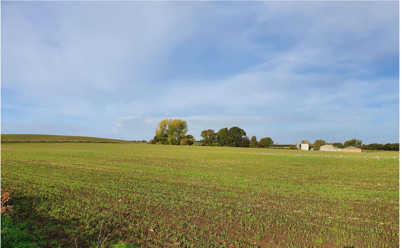
Looking south-west across fields around Hillhurst Farm

The fields in the Hillhurst Farm area may attract Lapwings and occasionally Golden Plover, whilst when left as stubble may attract Stock Doves, Skylarks, Meadow Pipits, Linnets, Reed Buntings and Yellowhammers, and occasionally Jack Snipe and Corn Bunting. Large numbers of Mediterranean Gulls are also frequently recorded.