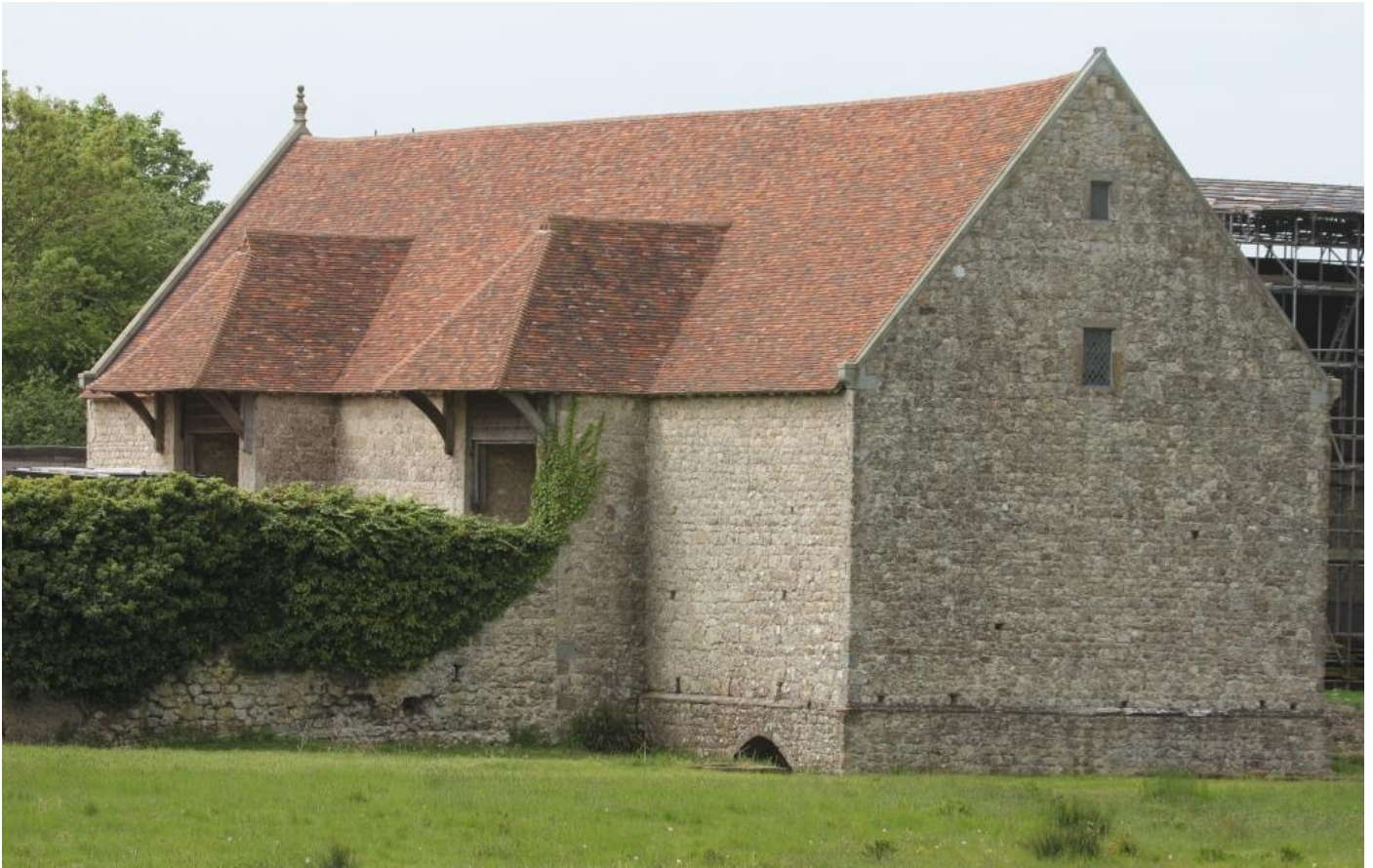
16 th century barns