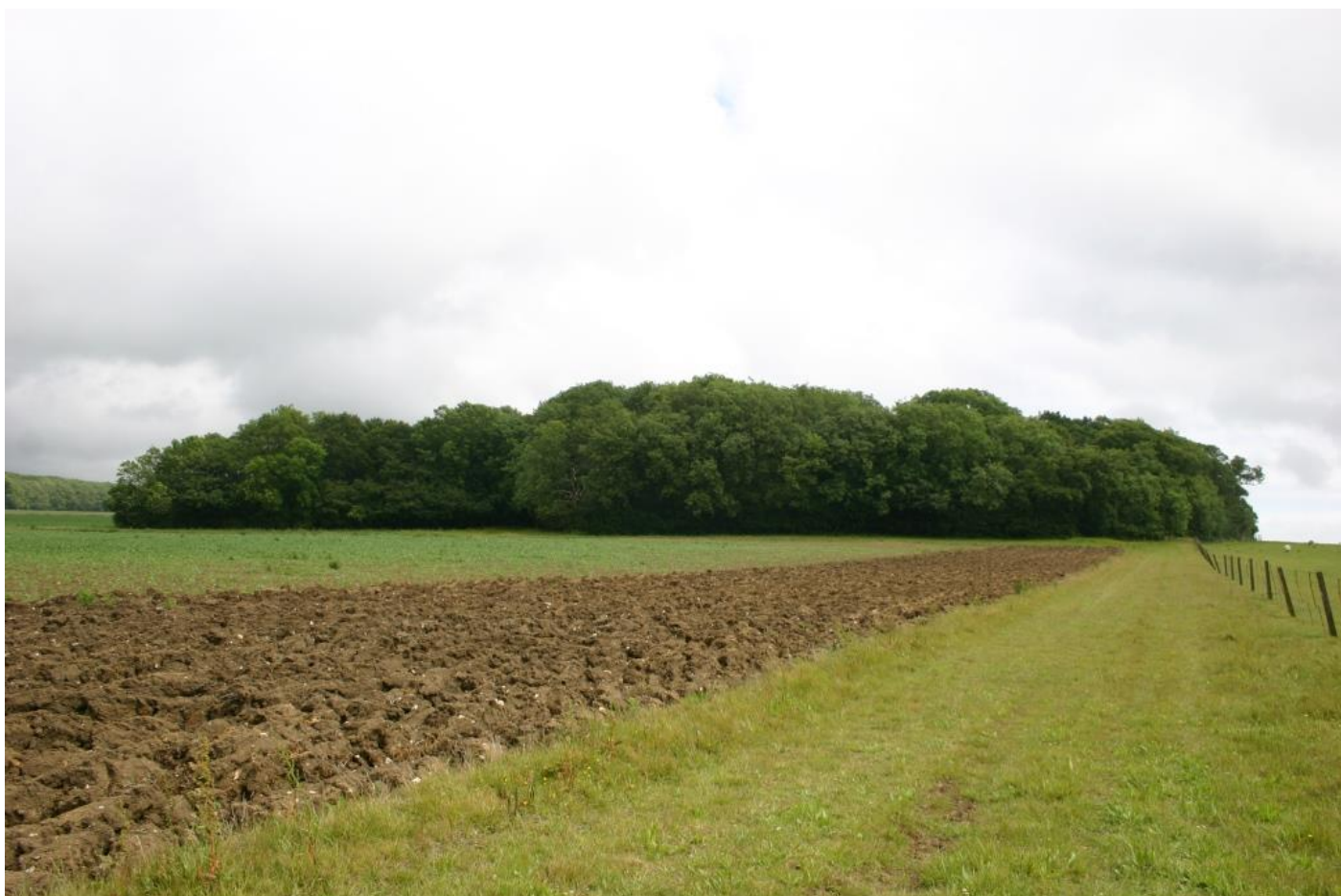
Perry Wood from the north-west