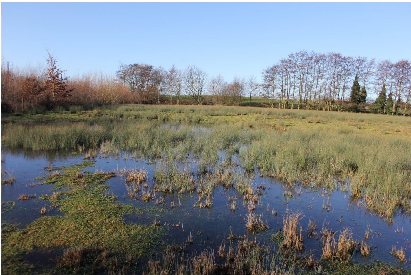
Looking west across seasonal flooding at Fairmead Farm