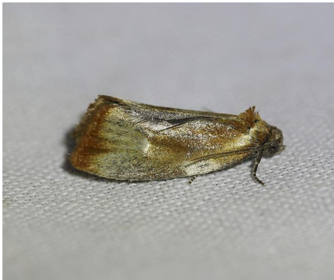
Eulia ministrana at Kiln Wood