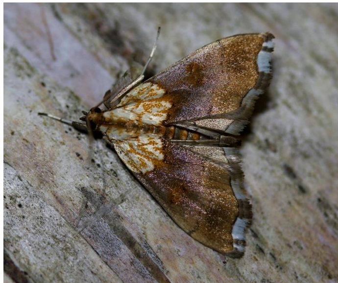
Agrotera nemoralis at Kiln Wood