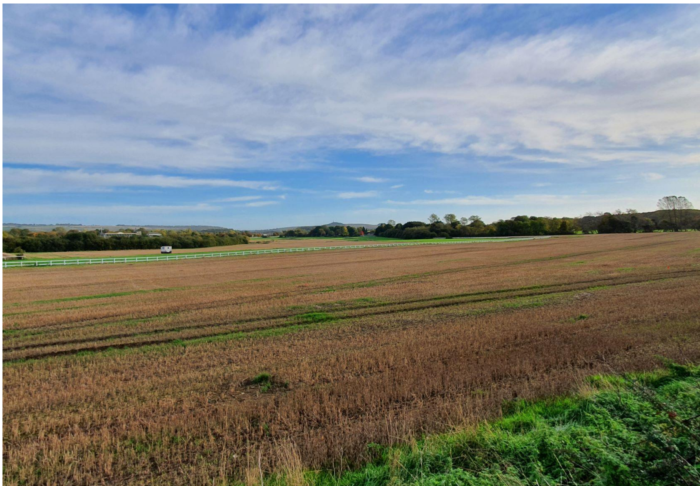
Looking north-east across fields adjacent to Folkestone Racecourse