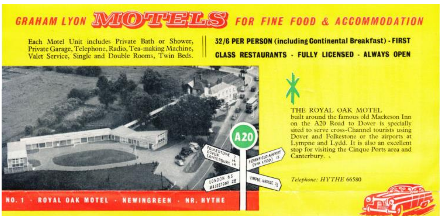
Advert for the Royal Oak Motel, 1950s