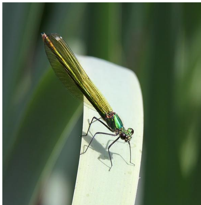
Banded Demoiselle at Fairmead Farm