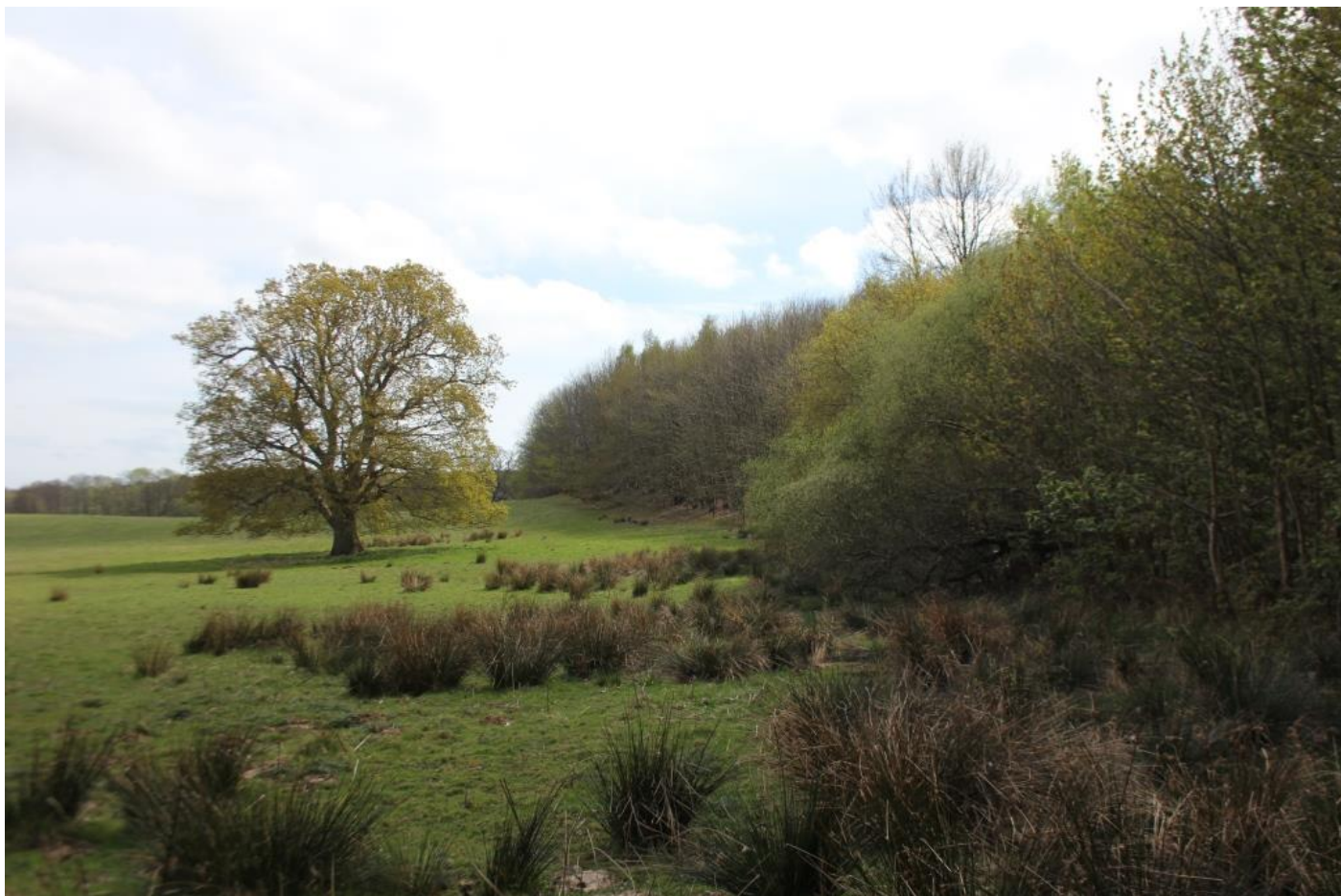
Looking south-east along the northern edge of Kiln Wood