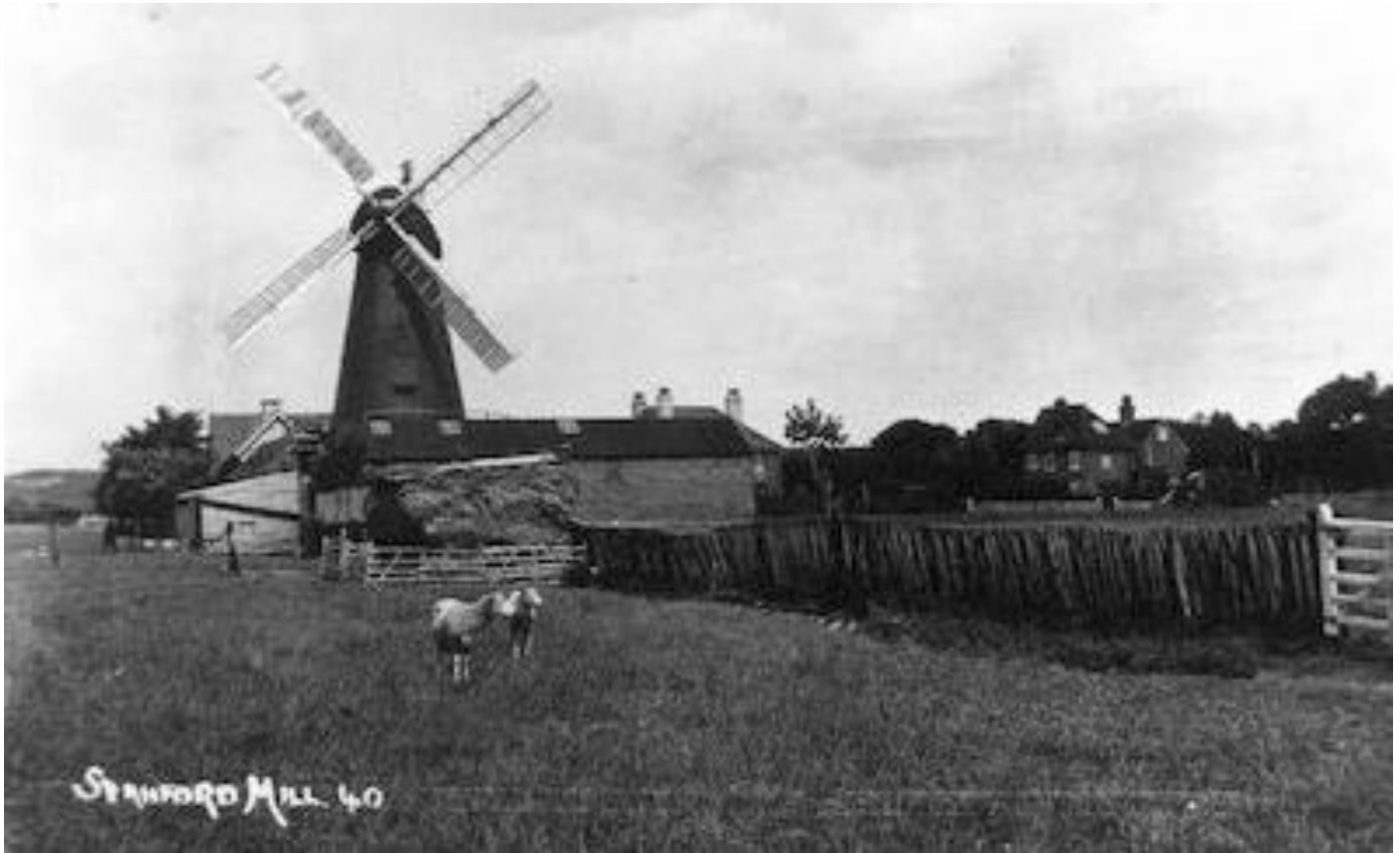
Stanford Mill in 1940

Also of interest is the grade II listed tower mill at Stanford, built in 1857 by the Ashford millwright John Hill. It was powered by wind until 1946 and milling continued by engine until 1969. The sails and cap roof were removed in 1961, when a corrugated asbestos roof was built on the cap frame. Following its decommissioning it deteriorated badly inside but it has recently been renovated as a private residence. A section of the roman road Stone Street runs almost through the centre of the tetrad. This road connected Portus Lemanis (in TR13 C) with Canterbury.