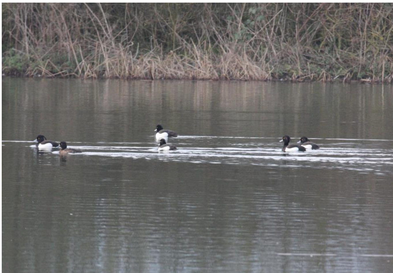
Tufted Ducks at Folkestone Racecourse Lake (Ian Roberts)