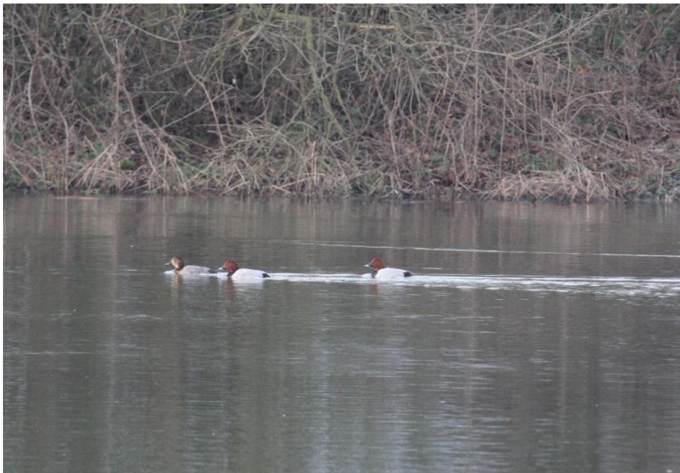
Pochard at Folkestone Racecourse Lake