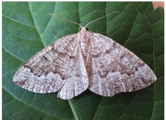
Banded Pine Carpet at Kiln Wood

Other species of particular note have included Eulia ministrana (Brassy Tortrix), Cryptoblabes bistriga (Double-striped Knot-horn), Elegia similella (White-barred Knot-horn), Agrotera nemoralis (Beautiful Pearl), Catoptria verellus (Marbled Grass-veneer), Dusky Hook-tip, the Mocha, Lilac Beauty, Brindled White-spot, Grey Birch, Lobster Moth, Olive Crescent, Rufous Minor and the Suspected.