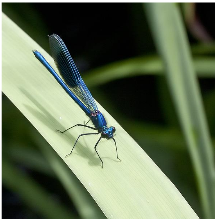
Banded Demoiselle at Fairmead Farm