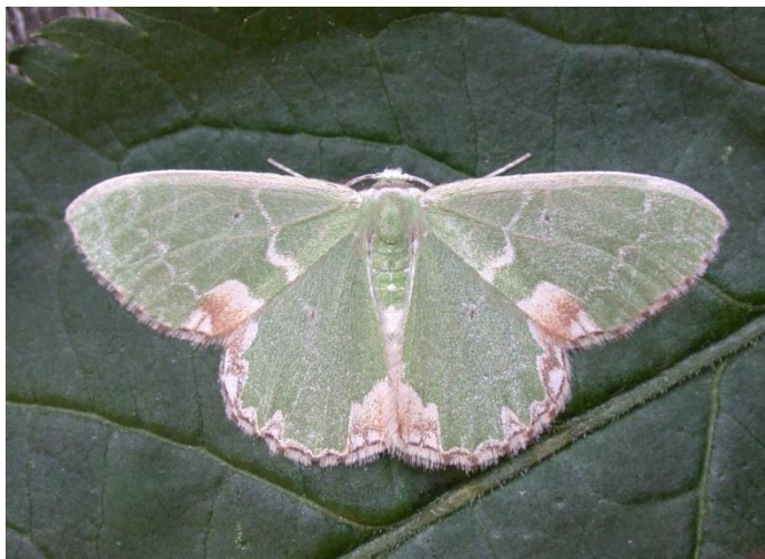
Blotched Emerald at Kiln Wood

Several insect groups in particular have received very little attention here and there is clear potential to extend a number of the lists that are given below. Occasional moth trapping at Kiln Wood since 2018 has produced a number of noteworthy records, including the first area record of Blotched Emerald in June 2018, the third area (and 17 th national) record of Banded Pine Carpet in May 2022 and the only area records of Pseudatemelia josephinae (Orange-headed Tubic).