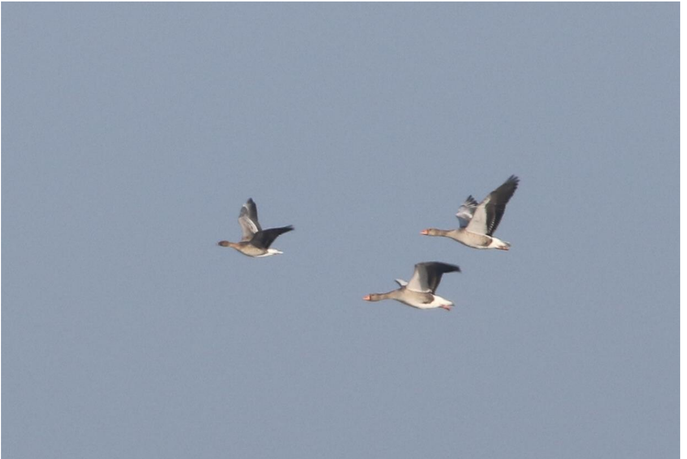
Pink-footed Goose with Greylag Geese at Folkestone Racecourse