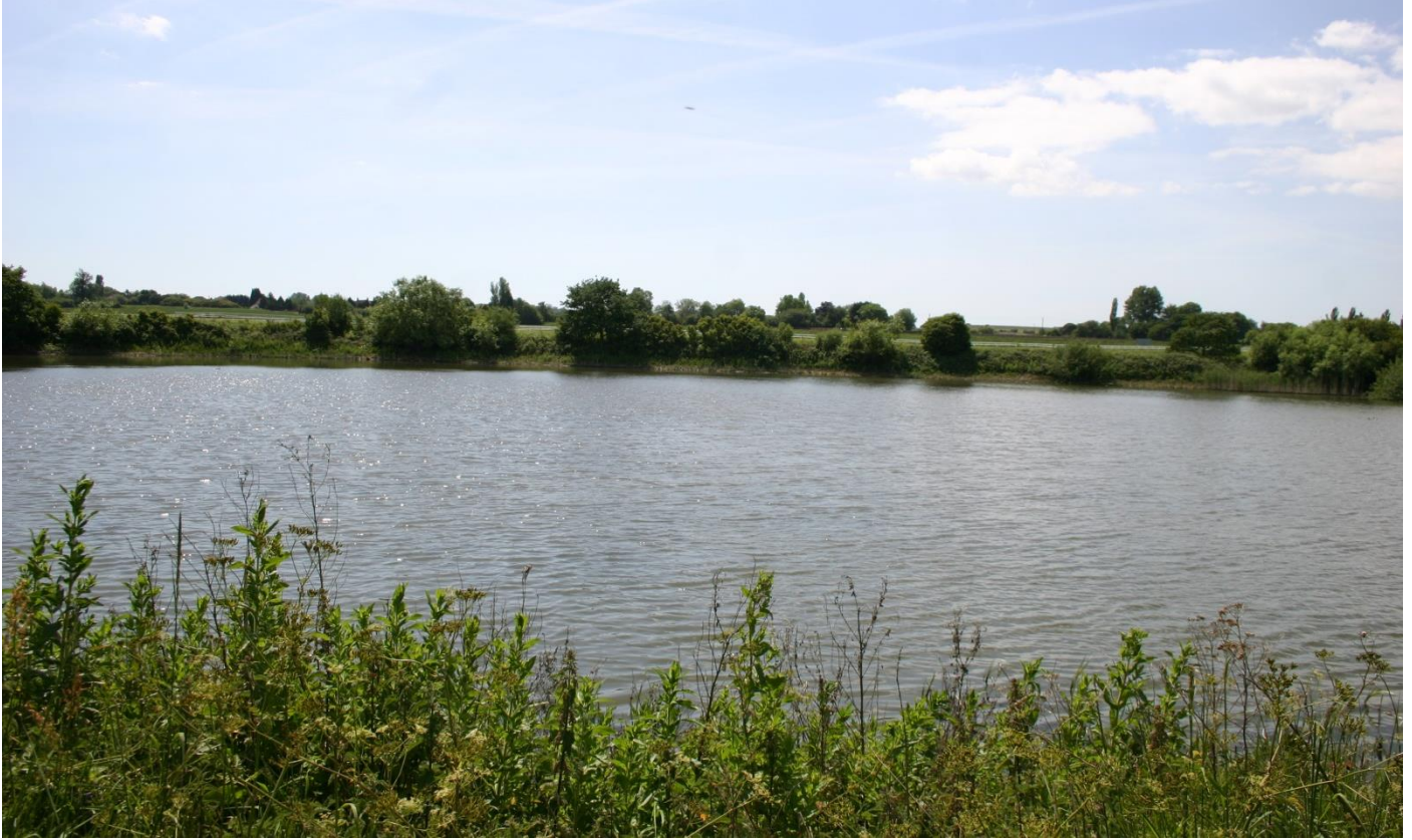
Looking west across the lake at Folkestone Racecourse

One of the more interesting habitats is the former Folkestone Racecourse, with its small lake that has held breeding Tufted Duck, Coot, Little Grebe and Great Crested Grebe. These are regularly joined by Gadwall, Teal and Pochard in the autumn and winter, whilst Shoveler, Wigeon, Pintail and Goldeneye have also occurred on occasion, generally during cold weather, though the lake is prone to freezing over during prolonged frosts. Snipe and Water Rail can sometimes be found in the ditches by the lake and Reed Buntings breed in the surrounding vegetation, whilst Stonechats are regular winter visitors. A Great White Egret was seen in August 2012.