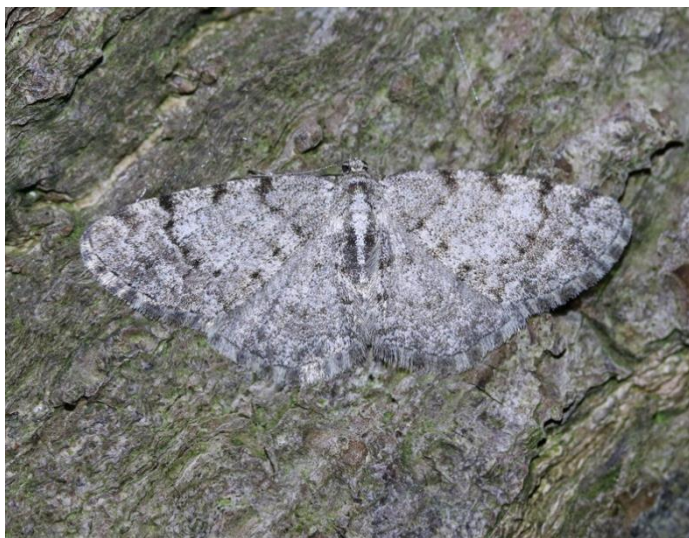
Grey Birch at Kiln Wood