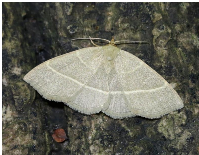
Olive Crescent at Kiln Wood