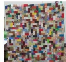
Who is hiding behind her quilt?