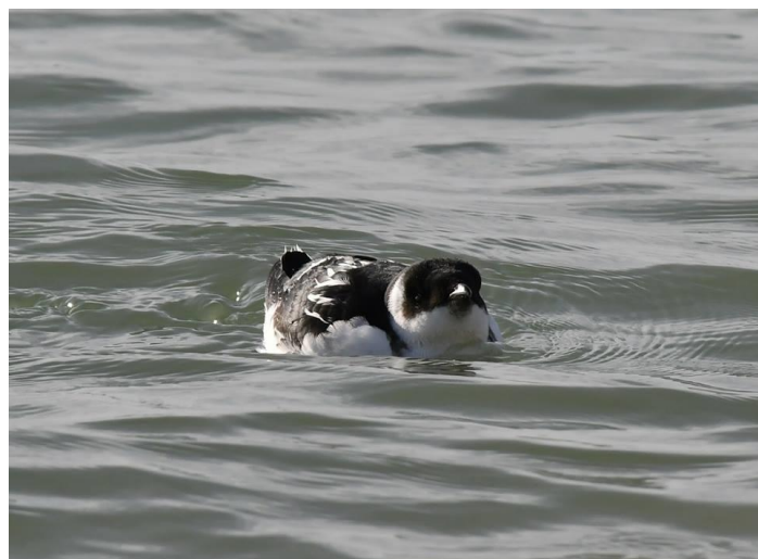
Little Auk at Princes Parade (Nigel Webster)