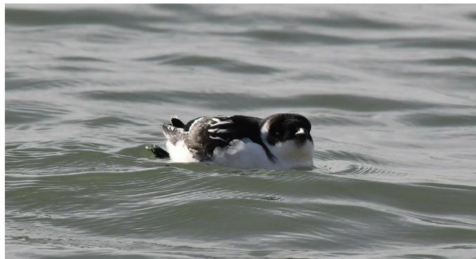
Little Auk at Princes Parade

Breeds in large colonies in Spitsbergen (5-7 million pairs), with smaller numbers in extreme northern Russia (Franz Josef Land and Novaya Zemlya), also in Greenland and the Siberian Arctic. Winters among broken pack-ice from the Barents Sea westwards into the Norwegian Sea, through the Denmark Strait to the Davis Strait, and south to the Grand Banks of Newfoundland.