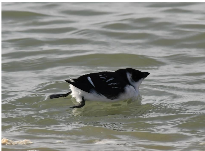
Little Auk at Princes Parade