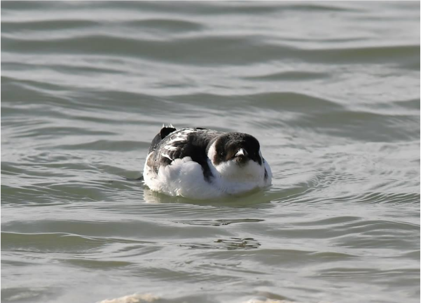
Little Auk at Princes Parade (Nigel Webster)

The tetrad map images were produced from the Ordnance Survey Get-a-map service and are reproduced with kind permission of Ordnance Survey .