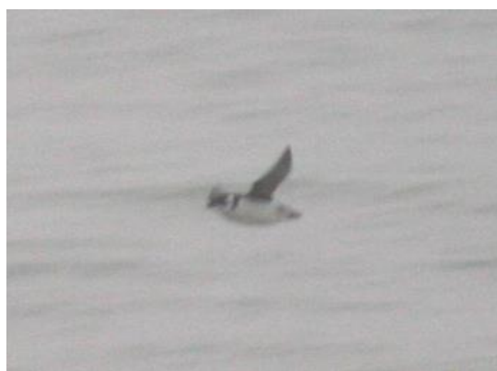
Little Auk at Hythe