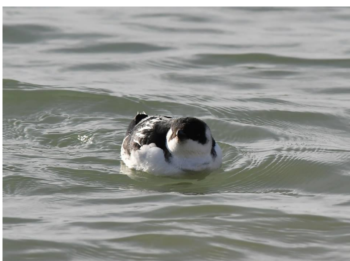
Little Auk at Princes Parade (Nigel Webster)