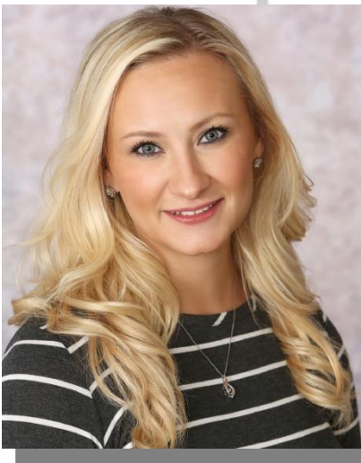
Owner & Director of Dance Instruction

Please register early in order to reserve your place in class. Our schedules are filled on a first-come, first-serve basis. 2021 Spring Class Registrations must be received by January 16, 2021.