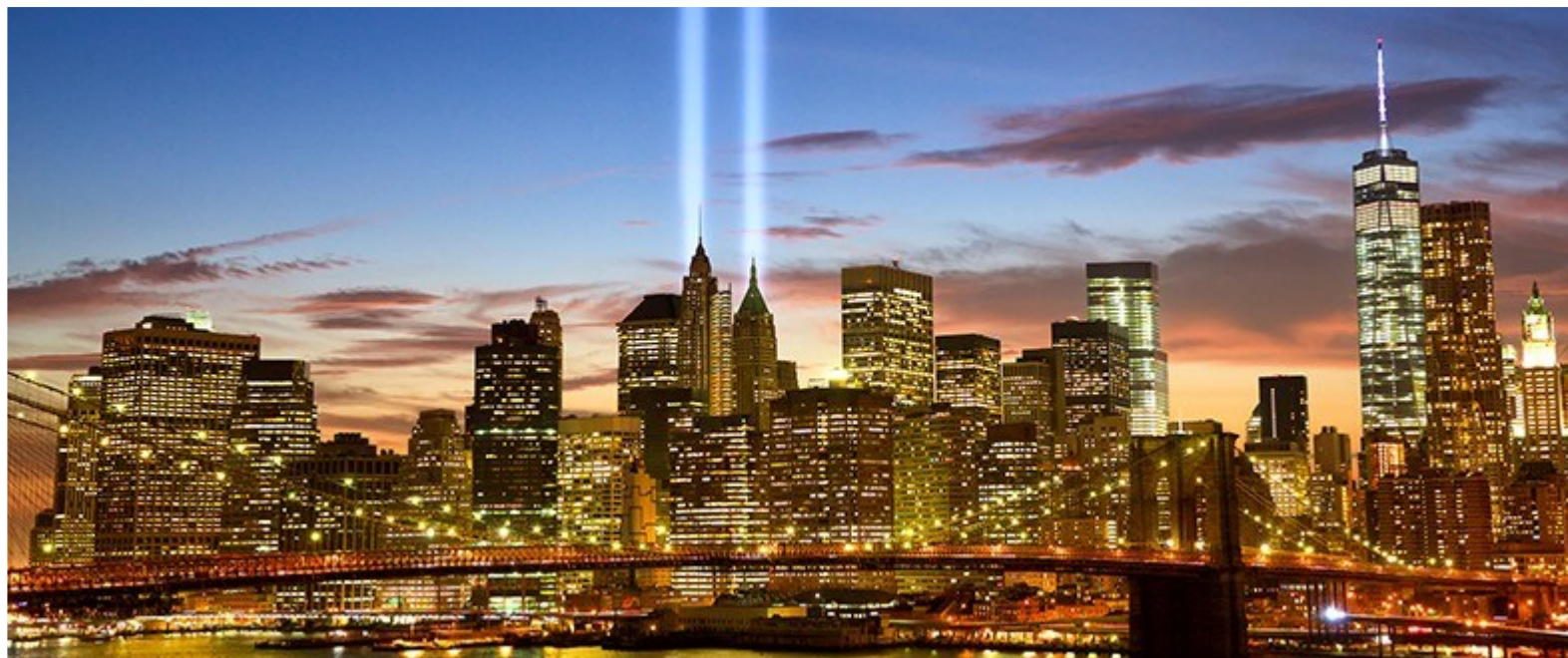
Manhattan skyline and the Towers of Lights (Tribute in Light) at sunset in New York