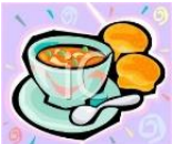
GRAB'N'GO SOUP TABLE

Please adhere to the rules of social distancing and the wearing of face masks. Please be respectful of what the stewards are trying to do, they have strict guidelines to follow from the Diocese. Thank you.