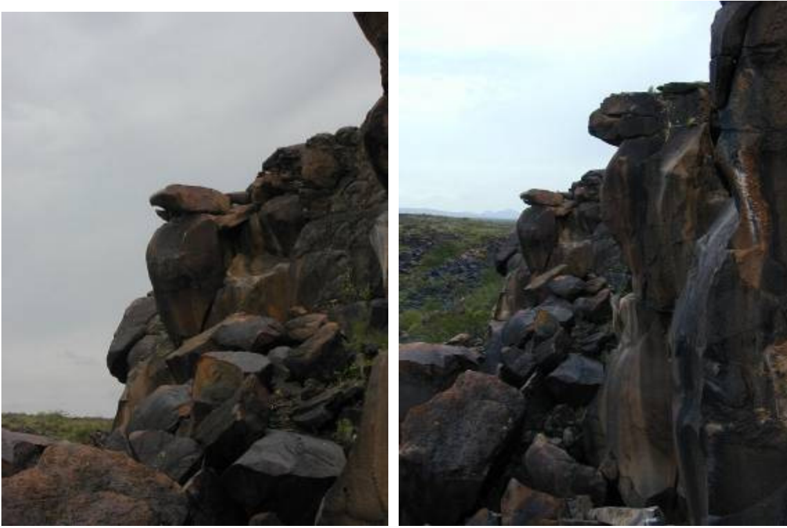
Figure 8 – Rock formations at Quail Point

Commentary: One point that I and others have made many times is that when viewing rock art, one must also view the surroundings in order to attempt to understand the context of the rock art and the native peoples that created the art. Ben's talk makes this exact point. One would not have understood the rock art if they were merely presented with photographs. These two cases clearly show that the rock art is all about the surrounding features that inspired the artist(s) and likely were the reason for the ceremonies that may have taken place at these locations.