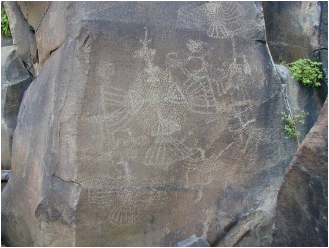
Figure 6 – Birds (Eagles) in Flight

Figure 7 represents a typical bird (eagle) at Quail point. They are generally shown with round bodies and cross shaped wings and tail feathers. Their heads are in profile with a beak that is shaped like an eagle's beak. Their heads are generally pointed in the same direction, east. Also the bird image appears to be associated with a crack in the rock.