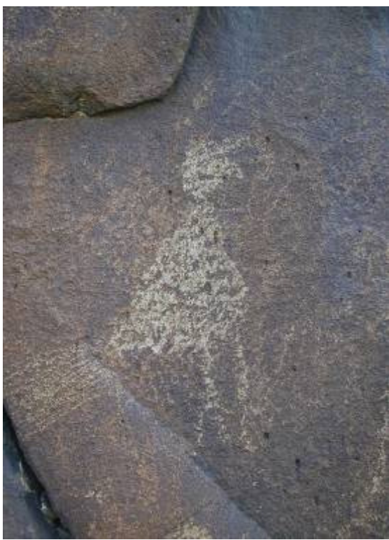
Figure 4 – The Quail of Quail Point

Quail Point is a pictograph site located on the Gila River in central Arizona. The dominant feature of the glyphs at Quail Point is birds, such as Quail (Figure 4), Hummingbirds (Figure 5) and Eagles (Figure 6 and 7).