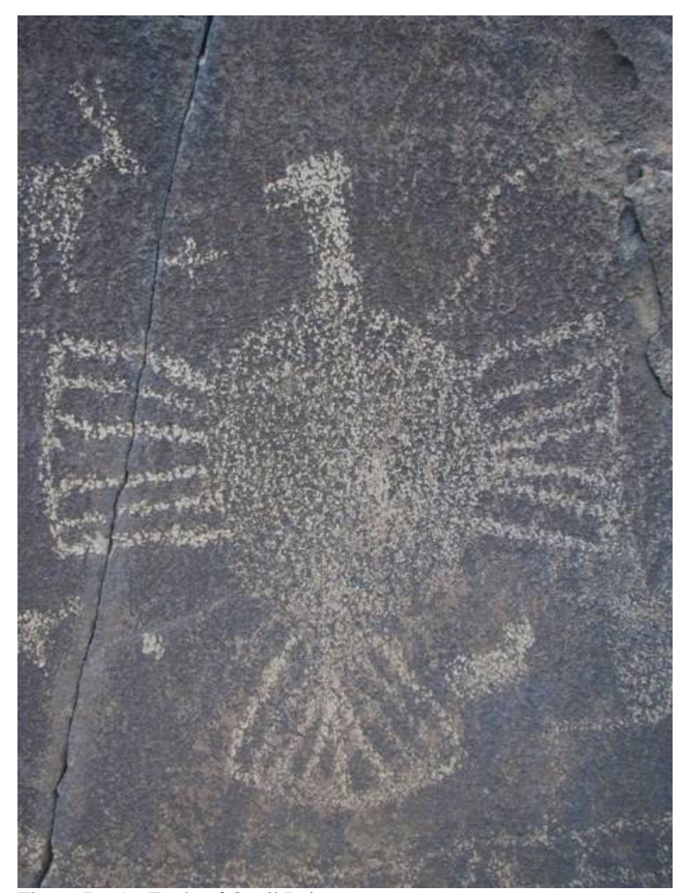
Figure 7 – An Eagle of Quail Point