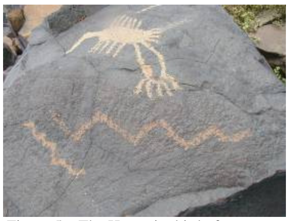
Figure 5 – The Hummingbird of Hummingbird Point