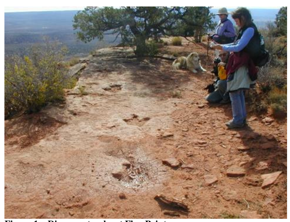
Figure 1 – Dinosaur tracks at Flag Point

Flag Point is a site located east of Kanab, Utah. On a plateau, one finds large, three toed dinosaur tracks (Figure 1).