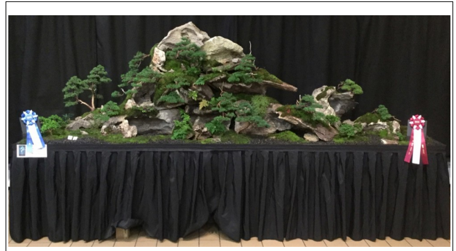
2018 BSC Display at Asheville Expo.