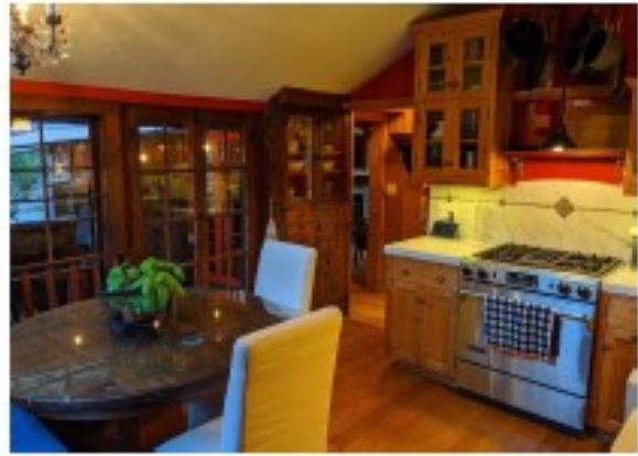
www.225acacialn.com 225 Acacia Lane Santa Cruz