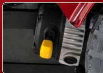
Extremely efficient motor package