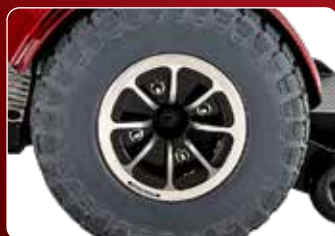
Superb traction, flat-free, drive tires