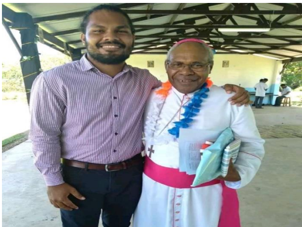
Bishop's farewell ceremony at OLSH on 9 September