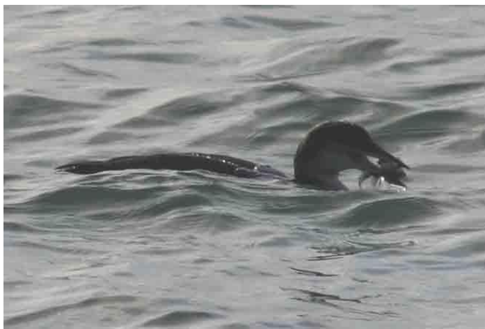
Great Northern Diver at Mill Point