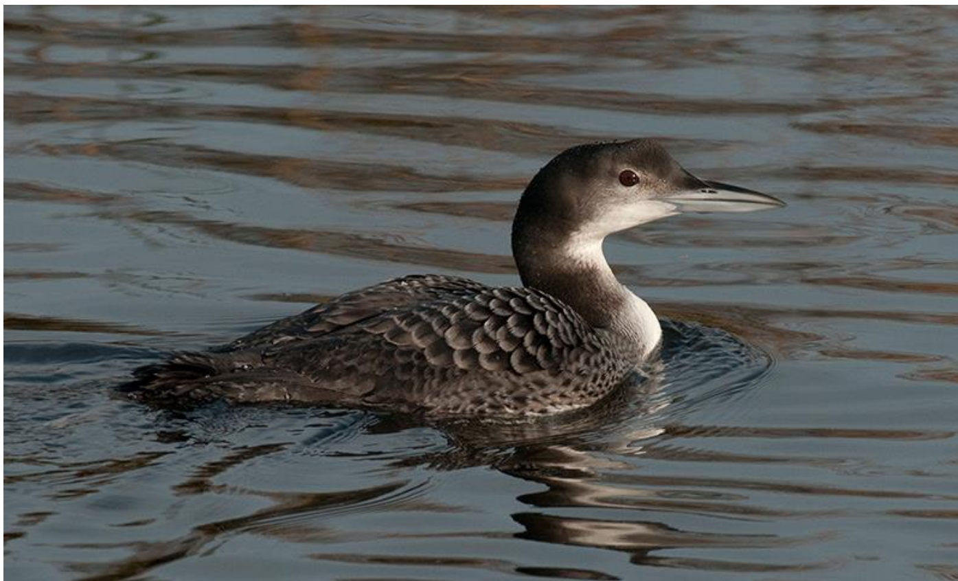
Great Northern Diver at Hythe