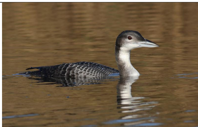
Great Northern Diver at Seabrook (Brian Harper)

It is a scarce passage migrant and winter visitor to coasts in Kent, rare inland and in summer.