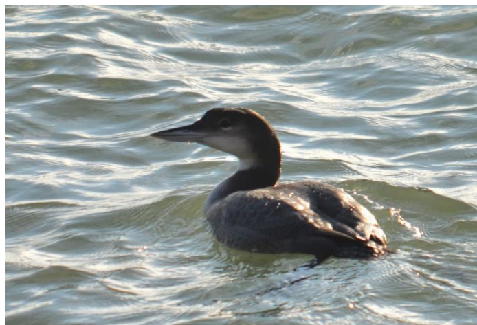
Great Northern Diver at Samphire Hoe