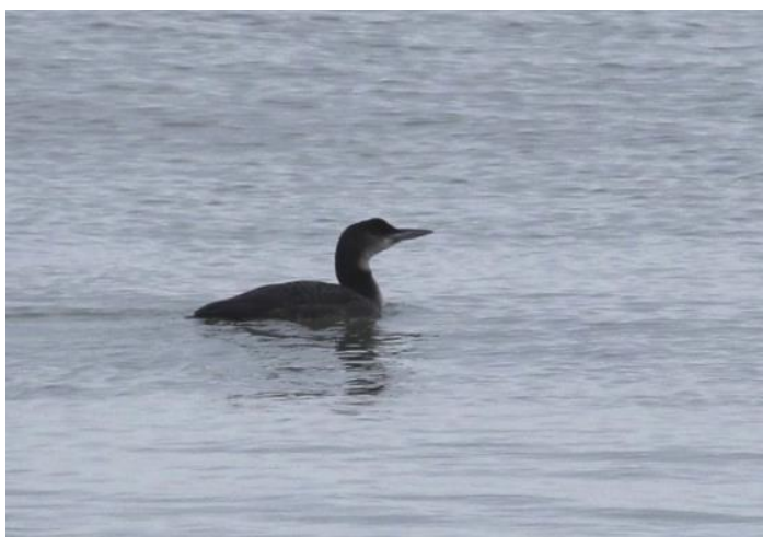
Great Northern Diver at Sandgate