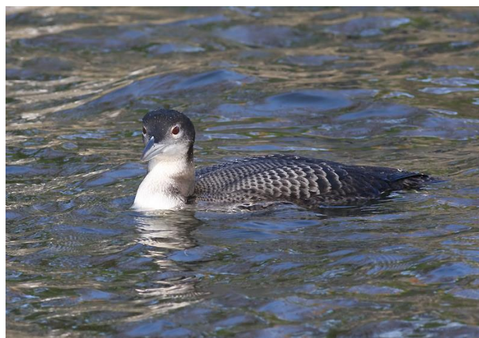
Great Northern Diver at Hythe (Brian Harper)