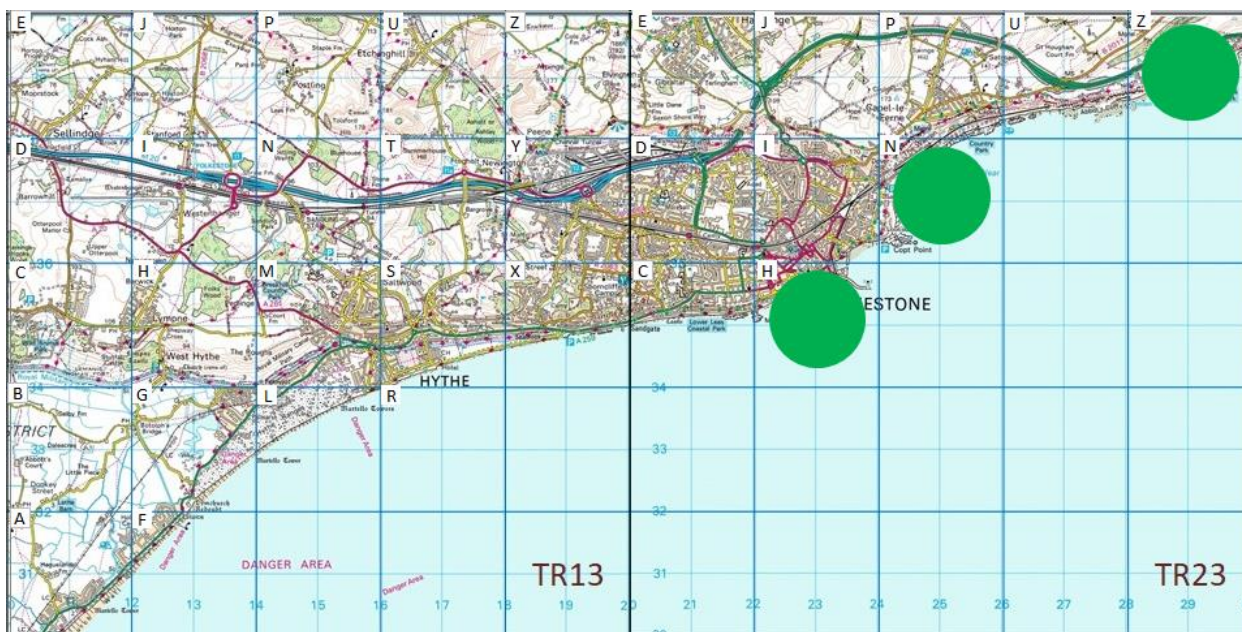
Figure 3: Distribution of all Puffin records at Folkestone and Hythe by tetrad

All records are from the Folkestone/Copt Point area, apart from the most recent at Samphire Hoe. Figure 3 shows the distribution of records by tetrad.