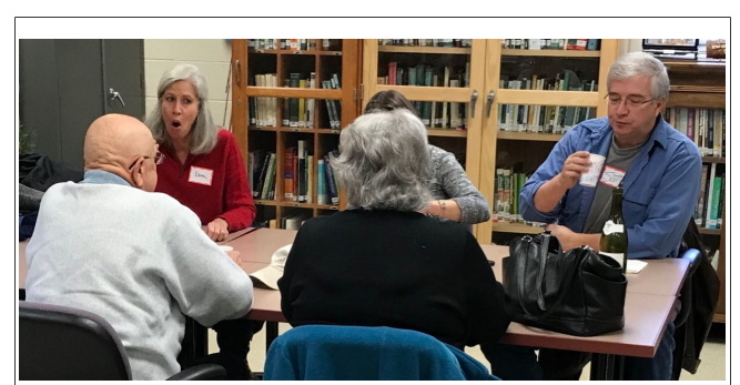
BSC members enjoying good food and fellowship..