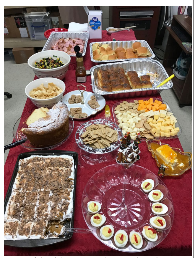
Some of the delicious goodies we shared.