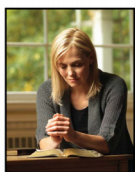
Daily Prayer Individually and as families