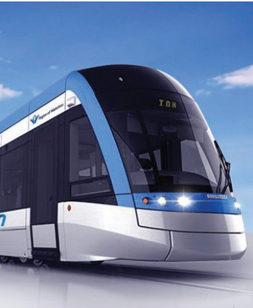
↑ ION TRANSIT SYSTEM