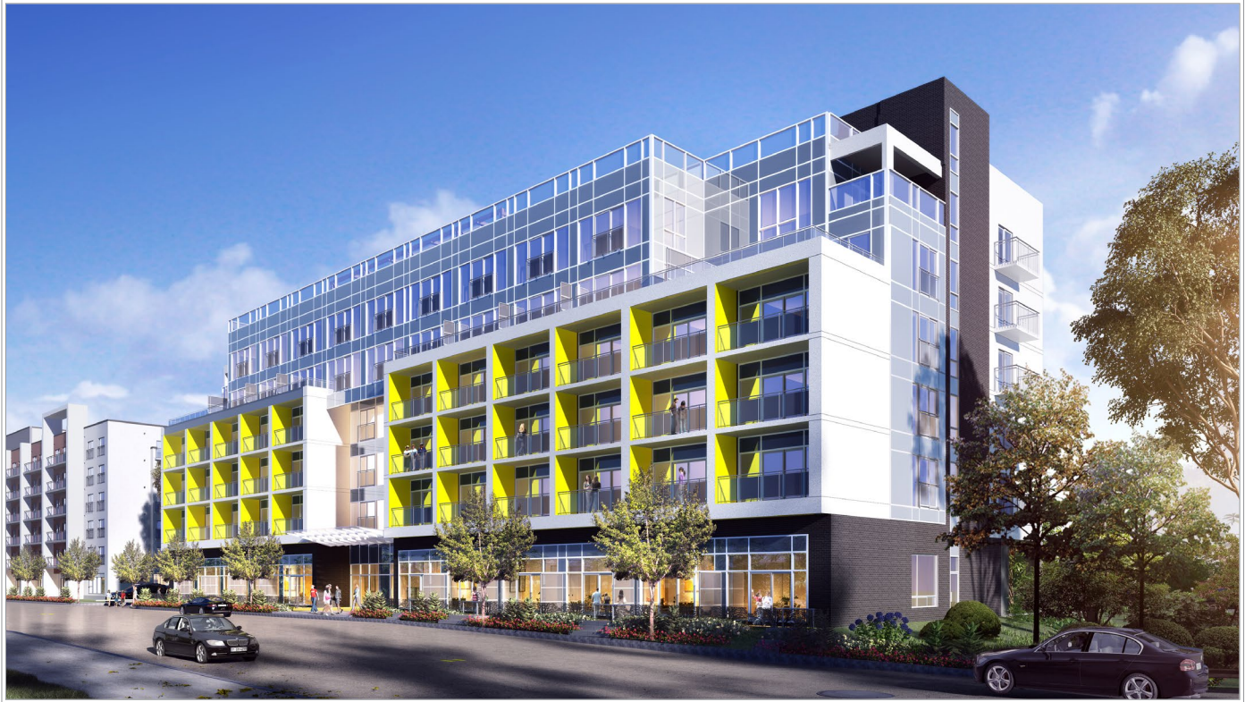
↑ SAGE X EXTERIOR ELEVATION - 257 HEMLOCK STREET, WATERLOO

All Sage projects have fully leased every year earning guaranteed lease rates.