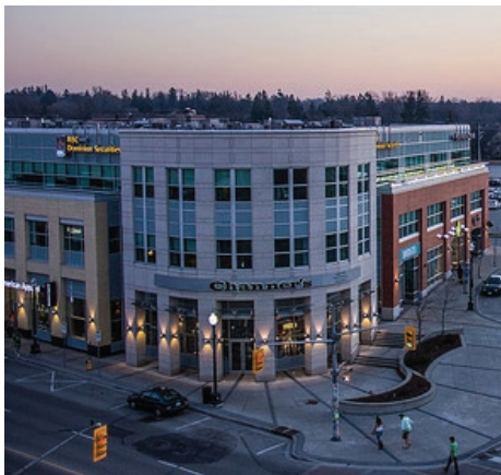
↑ UPTOWN WATERLOO