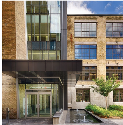
↑ BREIHAUPT BLOCK