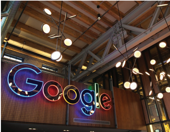
↑ GOOGLE IN KITCHENER'S INNOVATION DISTRICT