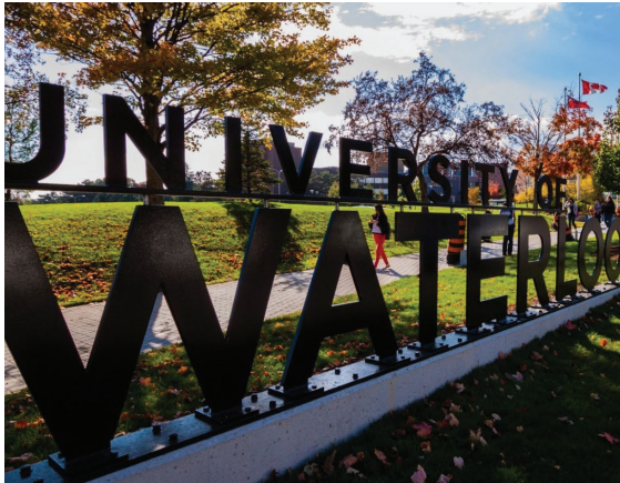
↑ UNIVERSITY OF WATERLOO