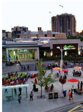
↑ SHOPS AT WATERLOO TOWN SQUARE