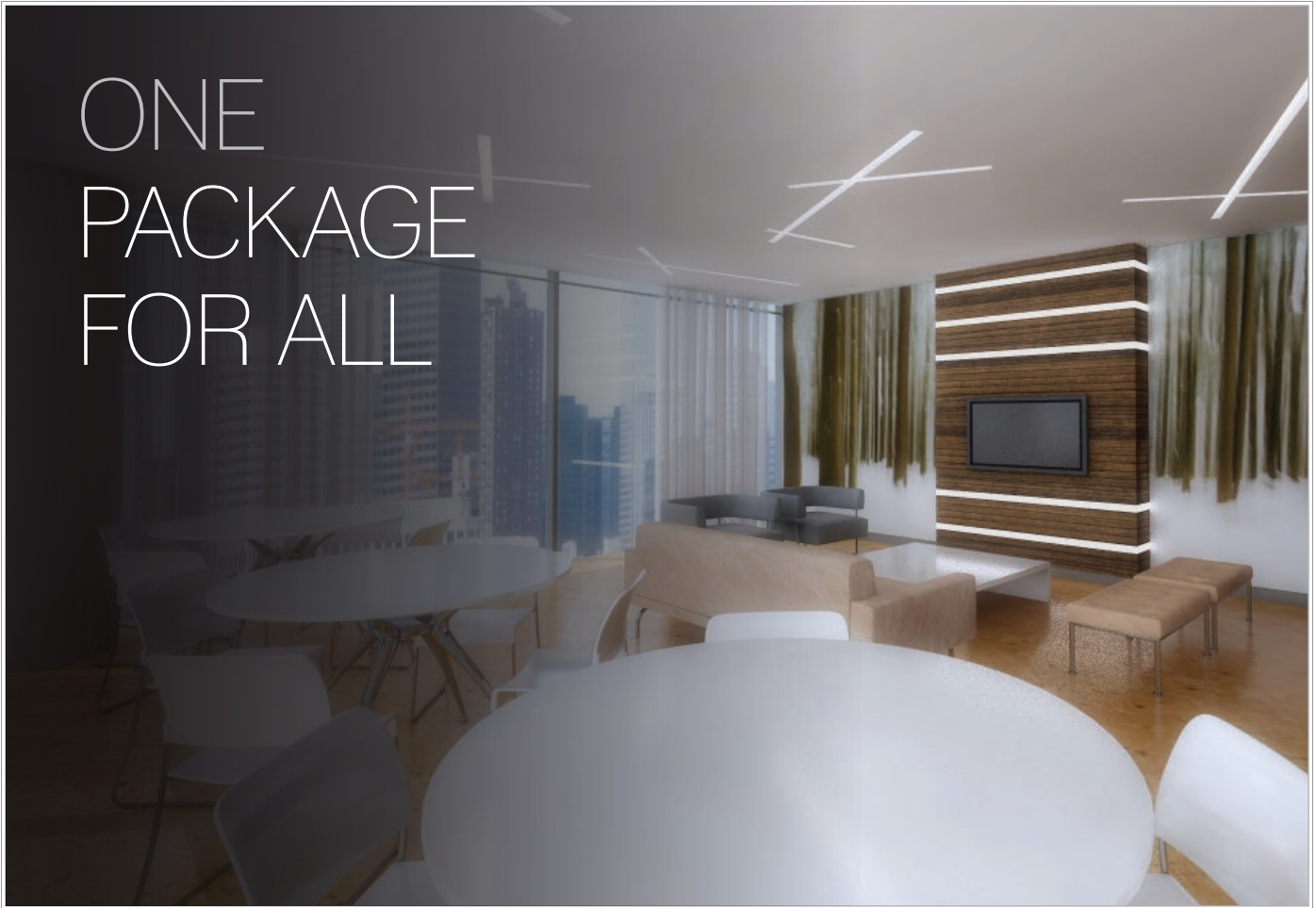
↑ SAGE 1 LOUNGE

WE ONLY HAVE 58 1 BEDROOM UNITS CURRENTLY IN WATERLOO. THESE ARE THE ONLY 1 BEDS IN BRAND NEW PURPOSE-BUILT LUXURY CONDOS IN WATERLOO.