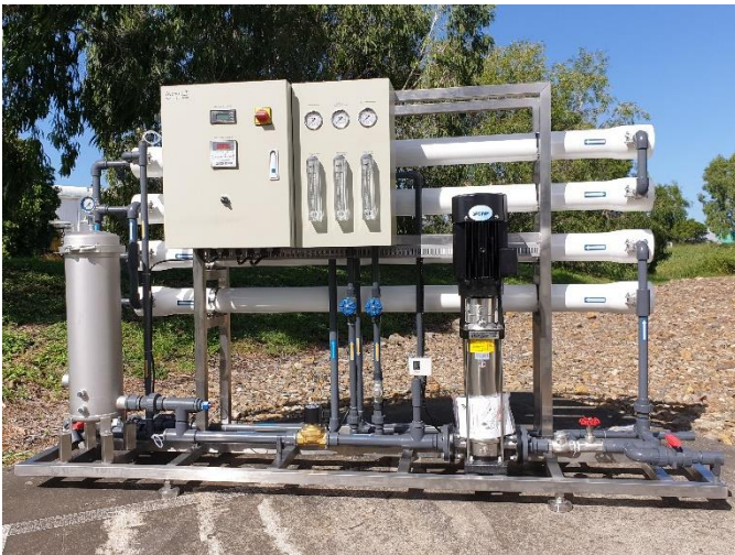
AVRO12000BWRO model shown

Able to customise to your specific needs