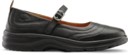
Black Lycra®** 2315