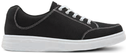
Midnight (black/white) 0250