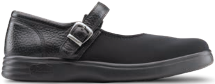
Black Lycra®* 4415

Style: Mary Jane Upper: Leather Interior: Leather Outsole: EVA Closure: Hook-and-loop Sizes: N (8-11), M, W (4-11, 12), XW (4-11)