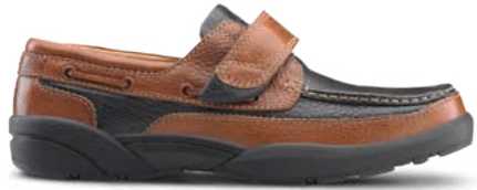
Black/Brown Multi 8660