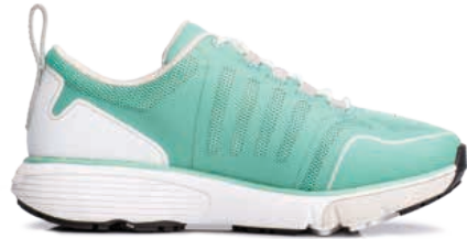
Seafoam Green 10325

Style: Athleisure Upper: Synthetic knit, leather, bonded TPU Interior: Lycra® Outsole: EVA, rubber Closure: Lace Sizes: M, W (4-11, 12), XW (4-11)