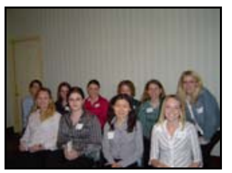
The Meritcare CLS class of 2007 presented "LEANing the Way to a Better Education."