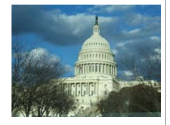
Our Nations Capitol