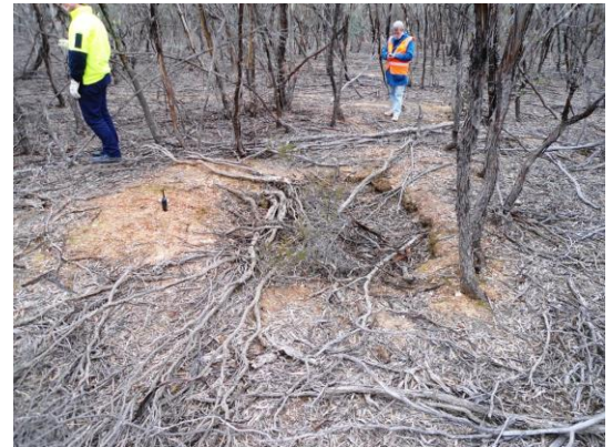
Article – Michael Moore, photographs above – line searching for malleefowl mounds, below – plant identification for seed collecting

The Wedderburn CMN is currently sponsoring two threatened species projects being carried out by the Mount Korong Eco-watch group and running another involving conservation of malleefowl. The current malleefowl project involves two public information sessions to be held at the Wedderburn Community Centre, one was held before on-ground work began and one will be held when the project is completed. A Green Army team of young people, including four young people recruited from the local area, are involved in systematic line searching of selected areas in the Wychitella Nature Conservation Reserve for malleefowl mounds. The team has undergone two days of line search training led by members of the Victorian Malleefowl Recovery Group. Another aspect of the project involves the revegetation, direct seeding by hand, around ten selected malleefowl mounds. Seeds for this process have been obtained from a local seed supplier. The team have also been involved in the identification of appropriate species for such revegetation. The training will involve techniques for collection of seed and the final cleaning and preparation of the seed which will then be used for further revegetation in 2017.