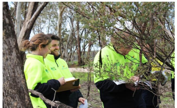
Green Army participants identifying plant species