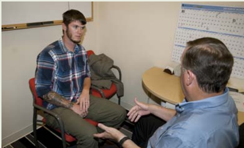
GI BILL AND UBA VOCATIONAL REHAB ARE PROGRAMS AVAILABLE TO ELIGIBLE VETERANS THAT PROVIDE EDUCATIONAL BENEFITS.

Administered by Veterans Benefits Administration (VBA), the Vocational Rehabilitation program’s primary function is to help individuals who have service-connected disabilities become suitably employed, maintain employment or achieve independence in daily living. Vocational Rehabilitation requires at minimum a 20% service connection disability for a military related physical or mental health condition (“service connection” means that the VBA has determined that a disability resulted from military service; the percentage reflects severity). Veterans use their vocational rehabilitation benefits to pay for tuition and fees and may be given an allowance for course supplies (e.g., computers, calculator, paper, cognitive prosthetics, books) and a living allowance. Unlike the GI Bill, student-Veterans using their Vocational Rehabilitation benefits to return to school are assigned a VBA Vocational Rehabilitation counselor that provides support throughout their academic career as needed. It can be useful for college/university advisors to communicate with these counselors. This can be facilitated by the Veteran/servicemember signing a release of information (ROI).