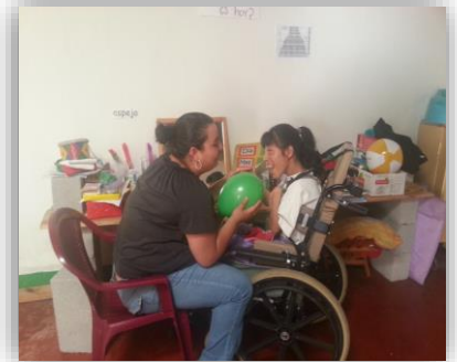
Speech and Communication Therapy

Music and Theater Therapy: Giving support to the different areas through musical elements, this therapy is used to facilitate and promote communication, relationships, learning, movement, expression, organization, and other relevant therapeutic objectives in order to meet physical, emotional, mental, social, and cognitive needs.