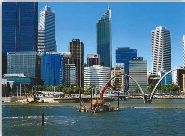
The Perth Convention and Exhibition Centre is the long low building on the left...amidst ongoing construction in the harbor area.

You might feel that 2017 is far in the distant future, but we have already begun the preparation for our next IASE Conference. The destination is Perth, Australia which is nestled on the western side of the continent. It's called the most isolated city on the earth, but Western Australia's capital is now basking in the glow of major investment, ambitious development, and some glossy high-profile buildings. One of these buildings is the beautiful Perth Convention and Exhibition Centre which will be the venue for the 15 th Biennial Conference of the International Association of Special Education.