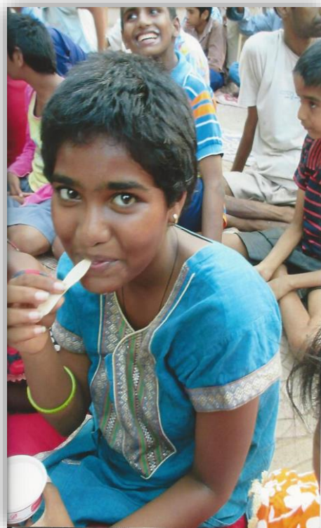
A student at Lebenshilfe School enjoying ice cream during the Diwali Celebration.