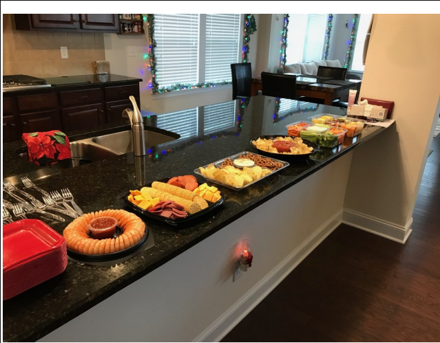
Quite the spread!!