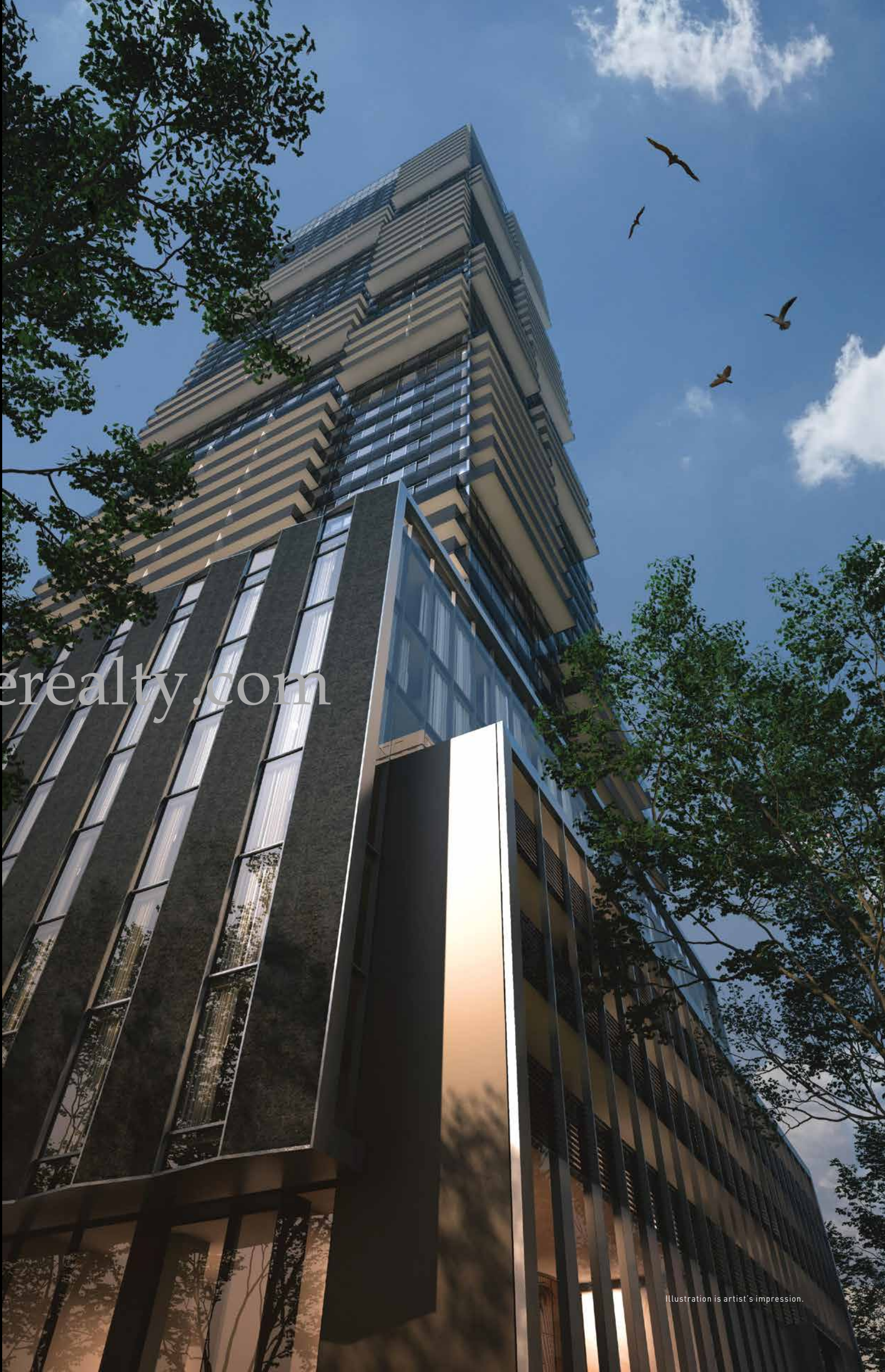
Illustration is artist's impression.