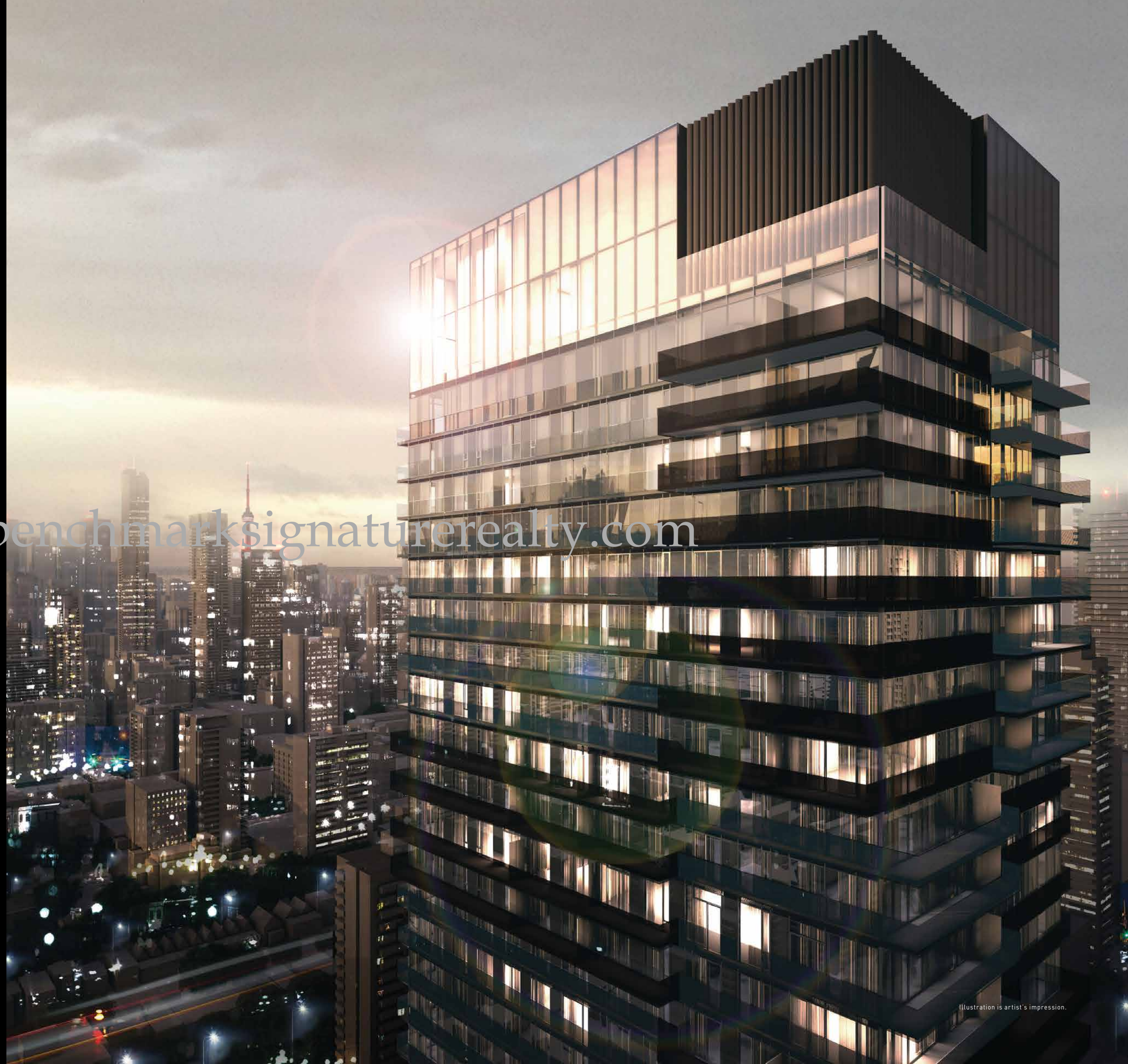
Illustration is artist's impression.