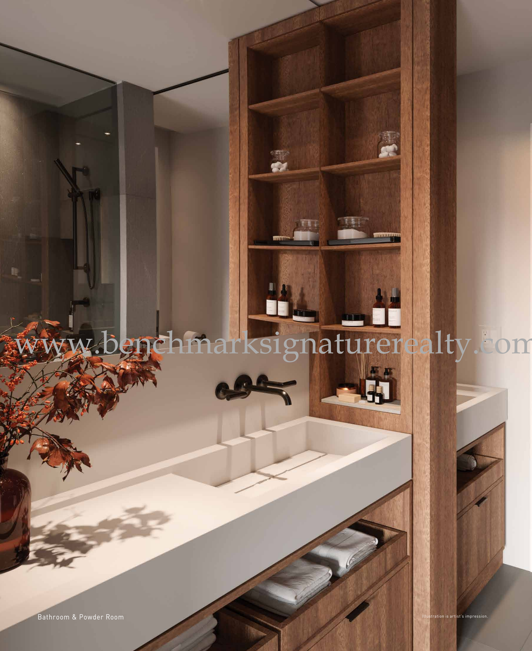
Bathroom & Powder Room