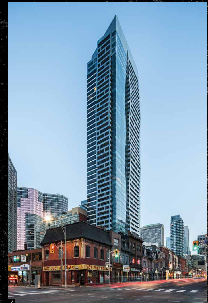
2 – FIVE St. Joseph Condominiums Architects: Hariri Pontarini Architects Interior Designer: Cecconi Simone Awards: 2011 BILD Project of the Year, Best High-Rise Building Design Award Status: Completed in 2015