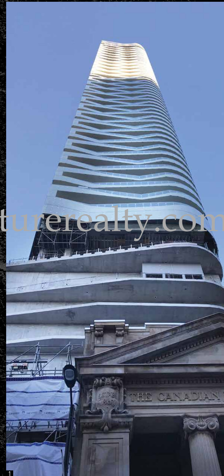
1 – The Massey Tower Architects: Hariri Pontarini Architects Interior Designer: Cecconi Simone Awards: 2013 BILD and OHBA Project of the Year Award, Best High-Rise Building Design Award Status: To be completed late 2019

Since its founding in 2009, the partnership has developed a series of successful, award-winning developments, beginning with its first project, the 48-storey Five Condos at St. Joseph, which won the coveted 2011 BILD Project of the Year and Best High-Rise Building Design Awards, as well as earned praise for its restoration of almost half a block of heritage buildings on Yonge Street. This was followed by The Massey Tower, a 60-storey development near Yonge and Queen, integrating the 1905 former Canadian Bank of Commerce building into an innovative block development which included the revitalization of the landmark Massey Hall. The Massey Tower was recognized in 2013 by winning both the BILD and OHBA Project of the Year and Best High-Rise Building Design Awards. Waterworks, the firm's most recent achievement, is the rejuvenation of the City of Toronto's historic Waterworks Building which integrates upscale condominiums, the city's newest YMCA, and a major Food Hall housed in the building's original mechanical hall.