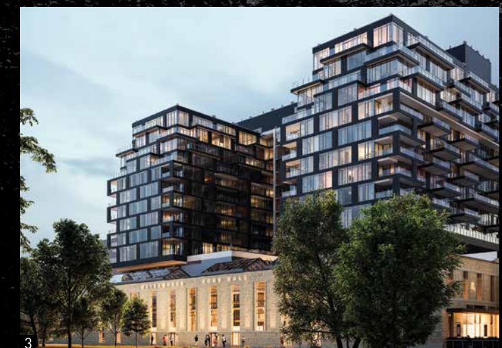
3 – Waterworks Architects: Diamond & Schmitt Architects Interior Designer: Cecconi Simone Awards: 2017 OHBA Most Outstanding High/Mid-Rise Condo Suite Award Status: Under construction