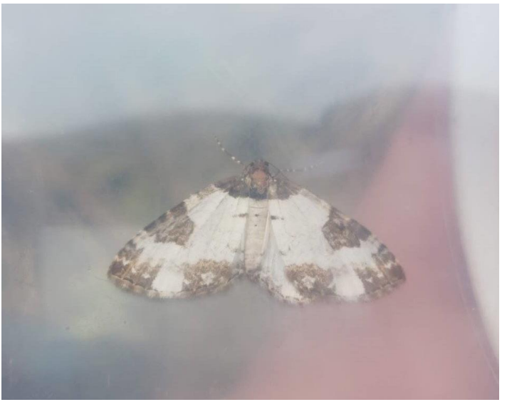
Pretty Chalk Carpet at Folkestone Warren