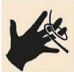
Finger amputations and fractures (OMD)