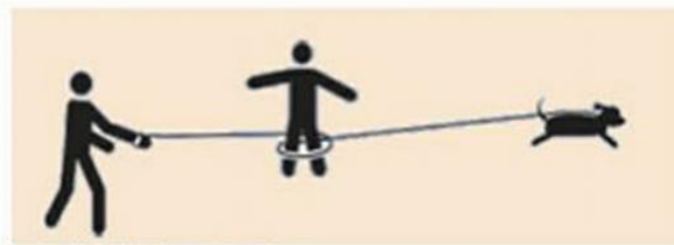
Injuries to bystanders