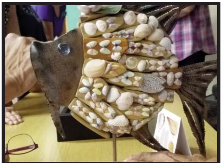
Barbara's finished product.