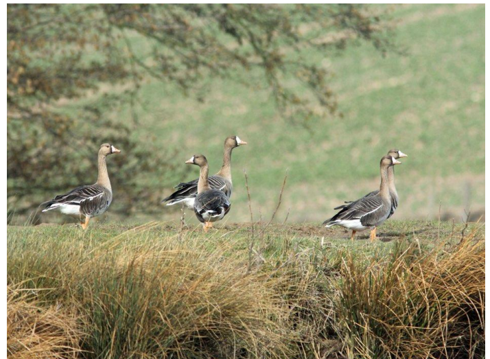
White-fronted Geese at Cock Ash Lake (Derek Smith)