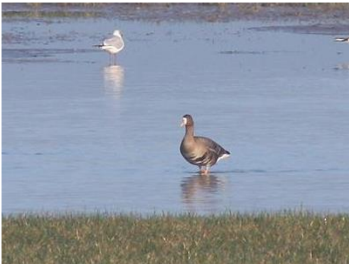
White-fronted Goose at the Willop Basin