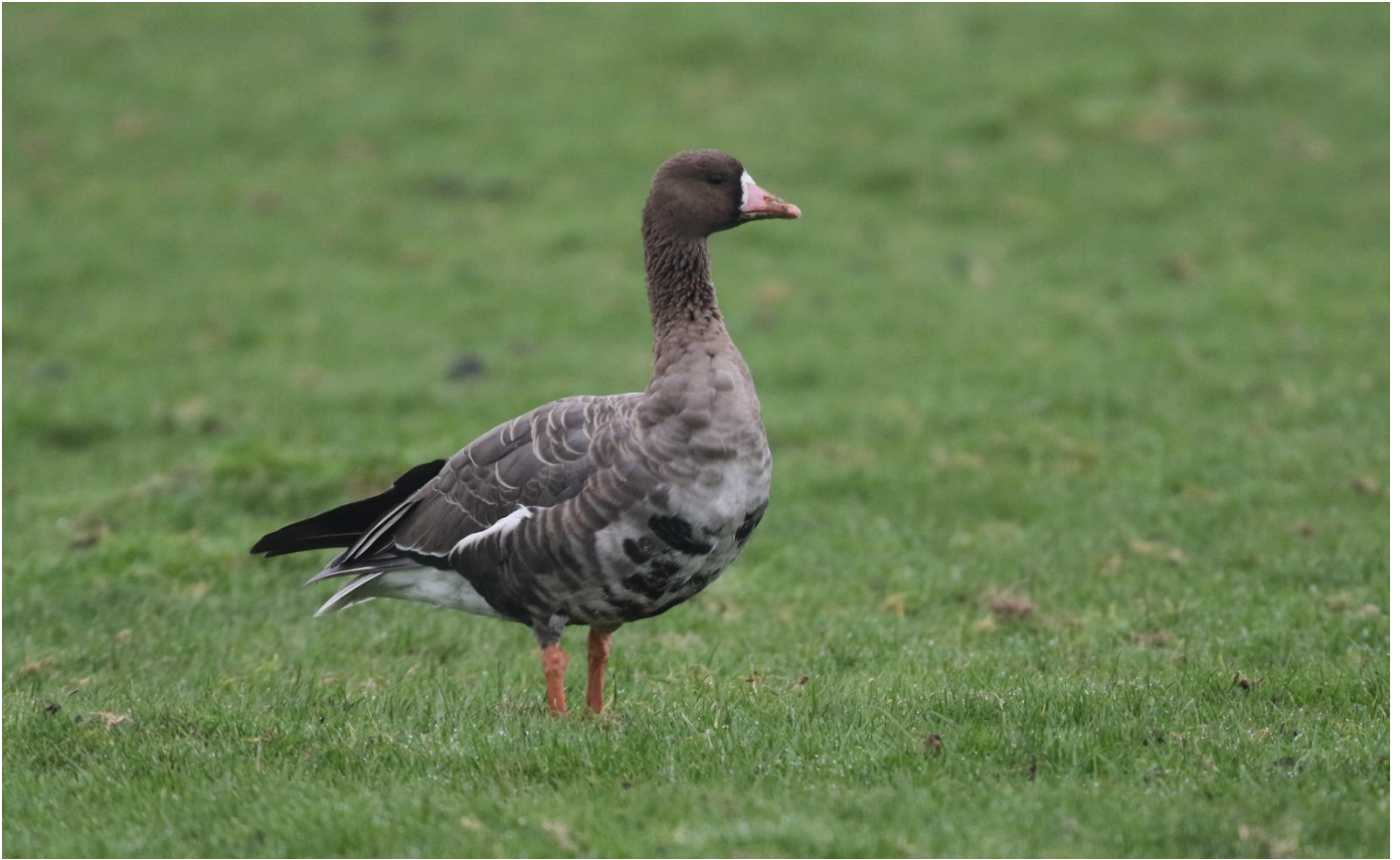
White-fronted Goose at Donkey Street