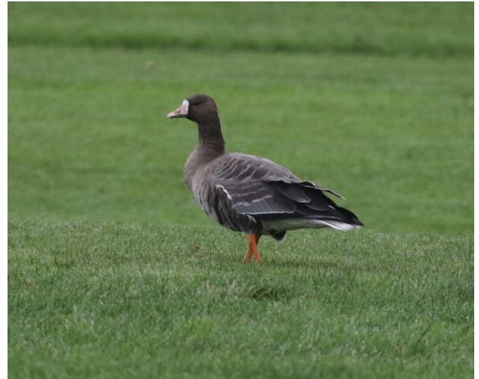
White-fronted Goose at Hythe Imperial golf course (Ian Roberts)

In Kent it is an annual winter visitor in small numbers, with occasional larger flocks, and a scarce passage migrant.