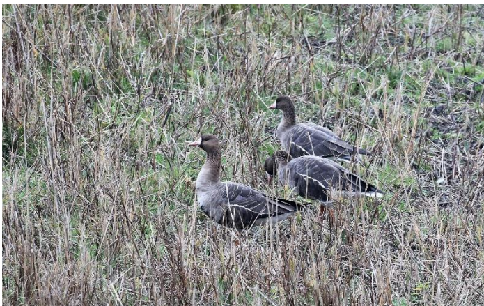
White-fronted Geese at Samphire Hoe