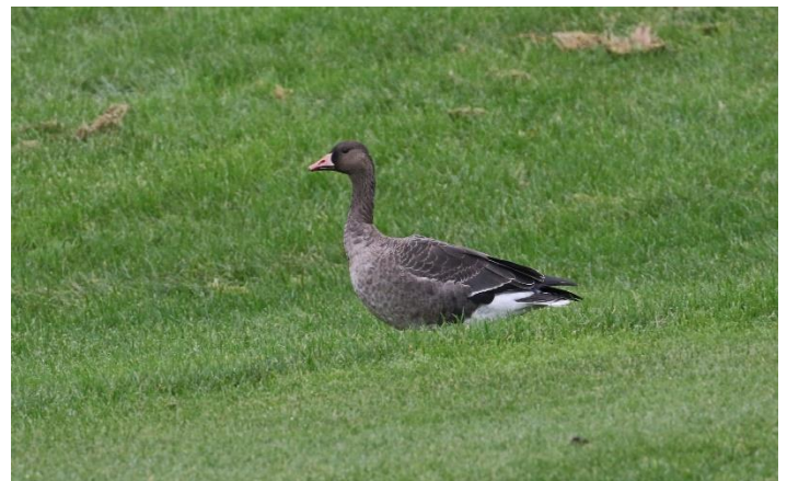
White-fronted Goose at Hythe Imperial