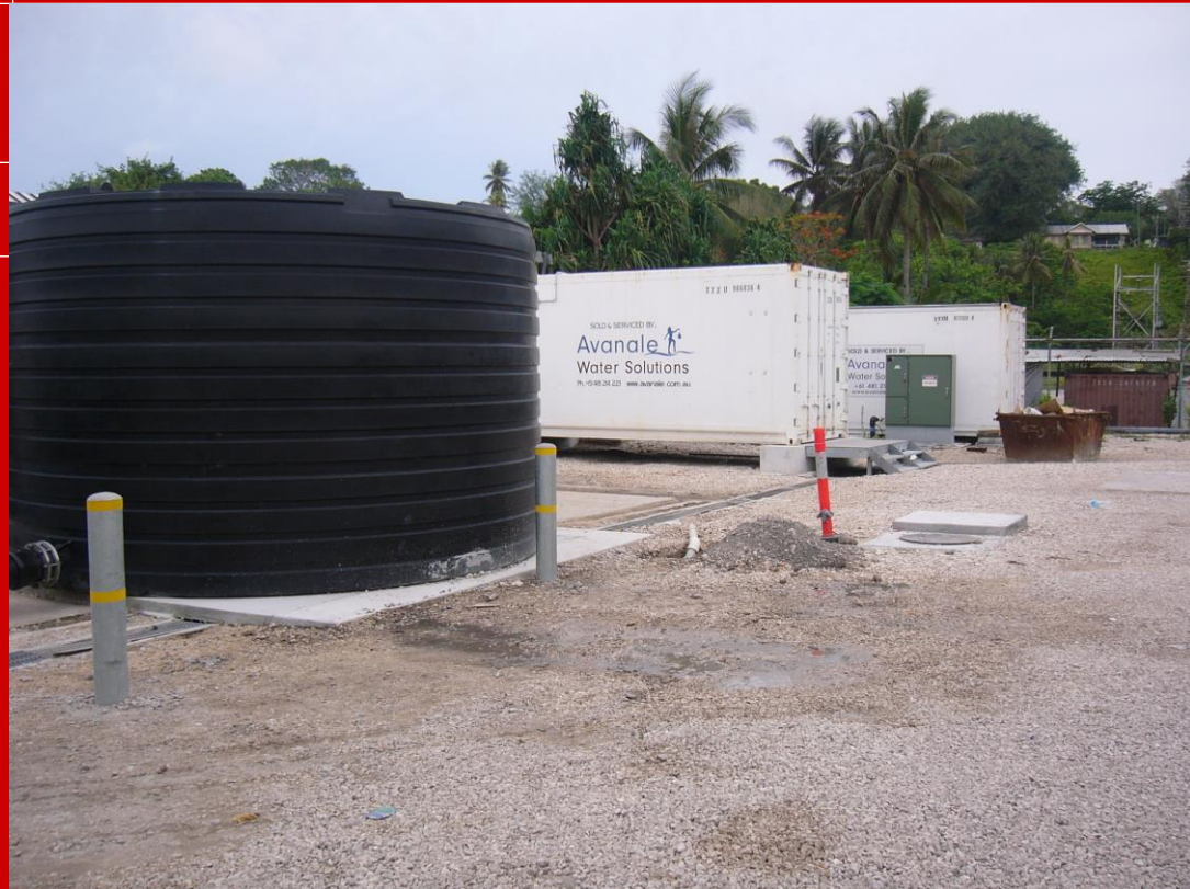
Photo shows both the 800k/day SWRO and the 500k/day SWRO supplied by Avanale Water Solutions

Government of Australia with the project to be located at the Nauru Utilities site and eventually handed over to the Government of Nauru.