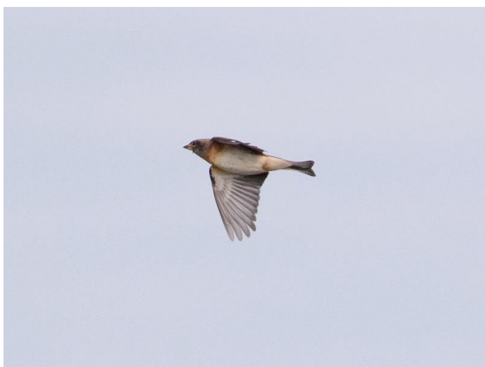
Brambling at Round Down (Jamie Partridge)

Two Great White Egrets flew east at Abbotscliffe on the 18 th , when a Hobby was at Abbotscliffe and two Brent Geese flew past Princes Parade. A Ring Ouzel, a Brambling, a Swift and c.1,000 House Martins were at Round Down the following day, when a Firecrest was at Seabrook, two Spotted Flycatchers were at Pedlinge and 1,500 House Martins flew over Hythe in the evening. On the 20 th , a Hobby, a Swift, a Willow Warbler, a Goldcrest, a Lesser Whitethroat, 6 Blackcaps and c.1,000 House Martins were at Abbotscliffe, where a Great Spotted Woodpecker flew over.