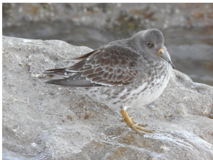
Purple Sandpiper at Hythe (David Gower)

Woodcock were noted at Hythe Roughts and Kiln Wood (two), whilst there were up to two Jack Snipe and 30 Snipe at the Willop Basin, with a single Snipe at Abbotscliffe on the 21 st and a peak of 21 at Folkestone Racecourse on the 8 th . A Green Sandpiper was seen on the ditch to the north of Nickolls Quarry on the 23 rd , whilst up to six Redshank were noted at the Willop Basin and Folkestone Harbour.