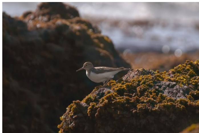
Common Sandpiper at Samphire Hoe (Elliot Ranford)

A Black-winged Stilt was heard calling as it flew south-west over Hythe after dusk on the 23 rd , whilst another late migrant Reed Warbler was singing at Abbotscliffe the same day, with a further individual at Paraker Wood on the 28 th . Four Red Kites flew over Cheriton on the 24 th and one flew west at Church Hougham on the 27 th . A Garden Warbler was singing at Princes Parade on the 30 th , when a Sand Martin arrived in off the sea at Abbotscliffe.