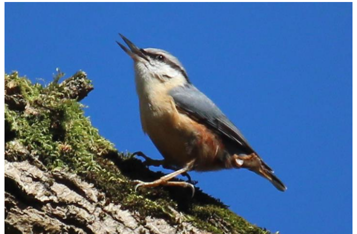
Nuthatch at Brockhill Country Park (Tony Poole)