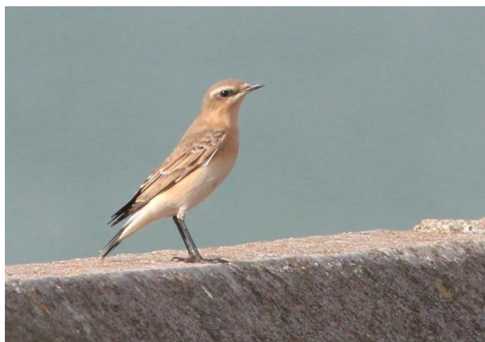
Wheatear at Samphire Hoe

A flock of up to 25 White Storks (from the introduction project in Sussex) provided some entertainment as they were tracked heading westwards from Samphire Hoe over Castle Hill, Cheriton and Sandgate on the 16 th . The following day saw a Grasshopper Warbler, 8 Lesser Whitethroats and 14 Whitethroats at Abbotscliffe, 2 Whinchats and 2 Wheatears at Church Hougham and four Willow Warblers in a garden in central Folkestone, where a Pied Flycatcher was seen on the 18 th , when a Wheatear was at Folkestone Harbour and 32 Gannets flew west at Sandgate.