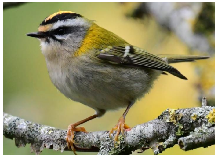
Firecrest at West Hythe (Mike Fitch)

Two new Dartford Warblers , a Whinchat, a Redpoll, 2 Corn Buntings, 2 Little Egrets, 3 Goldcrests, 5 Chiffchaffs, 6 Siskins, 8 Song Thrushes and 10 Reed Buntings were at Abbotscliffe on the 11 th , when 575 Starlings arrived in off the sea, whilst single Arctic Skuas were seen off Copt Point and Sandgate, and a Ring-necked Parakeet (presumably the individual first seen in September) was seen in the Golden Valley area of Cheriton (with intermittent sightings until at least the 28 th ). A further three Dartford Warblers were found at Abbotscliffe the following day, when 2 Chiffchaffs, 2 Blackcaps, 4 Goldcrests, 6 Siskins, 11 Reed Buntings and 21 Stonechats were also seen there, whilst 200 Starlings arrived in off the sea and 430 Goldfinches flew east. Five Firecrests were seen at Enbrook Park. On the 13 th an Arctic Skua was noted off Sandgate.