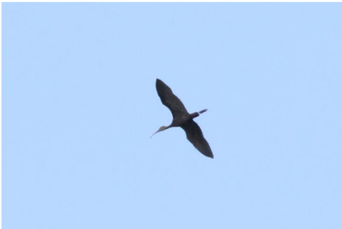
Glossy Ibis at Sandgate (Chris Powell)

A Spotted Flycatcher was seen in Lympe Churchyard on the 6 th , when two Firecrests were at Mill Point and 3 Firecrests and 5 Chiffchaffs were at Enbrook Park. On the 7 th a total of 96 Great Black-backed Gulls flew west at Seabrook whilst 1,000 Starlings arrived in off the sea at Sandgate.