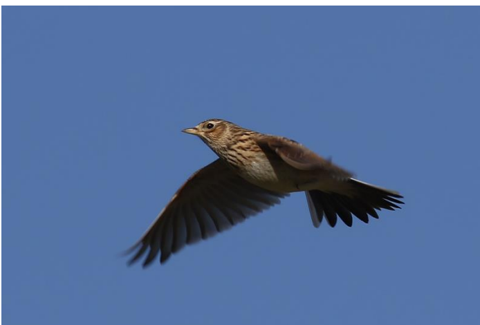
Skylark at Hythe Roughts