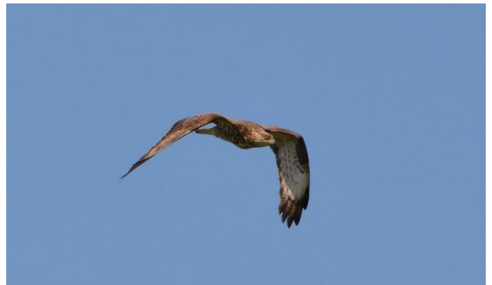
Honey Buzzard at Samphire Hoe

A Cuckoo was heard at Nickolls Quarry on the 21 st , when four Little Egrets flew east at Seabrook and several wandering Grey Herons were noted during the month.