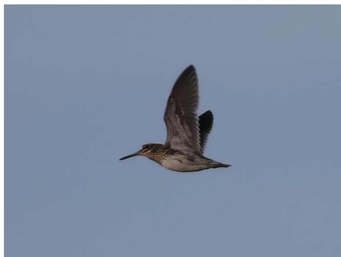
Jack Snipe at the Willop Basin (Brian Harper)

A Glaucous Gull flew west past Folkestone Sunny Sands on the 2 nd , whilst gull counts included 130 Mediterranean Gulls at West Hythe dam on the 3 rd , 370 Mediterranean Gulls on the Hotel Imperial Golf Course on the 11 th , 353 Common Gulls between Cock Ash Lake and Summerhouse Hill on the 16 th and 300 Black-headed Gulls at West Hythe dam on the 24 th . Auk numbers were very low, with a peak count of 100 Guillemots/Razorbills passing Princes Parade on the 21 st .