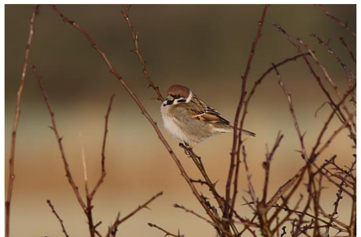
Tree Sparrow at Botolph's Bridge (Brian Harper)