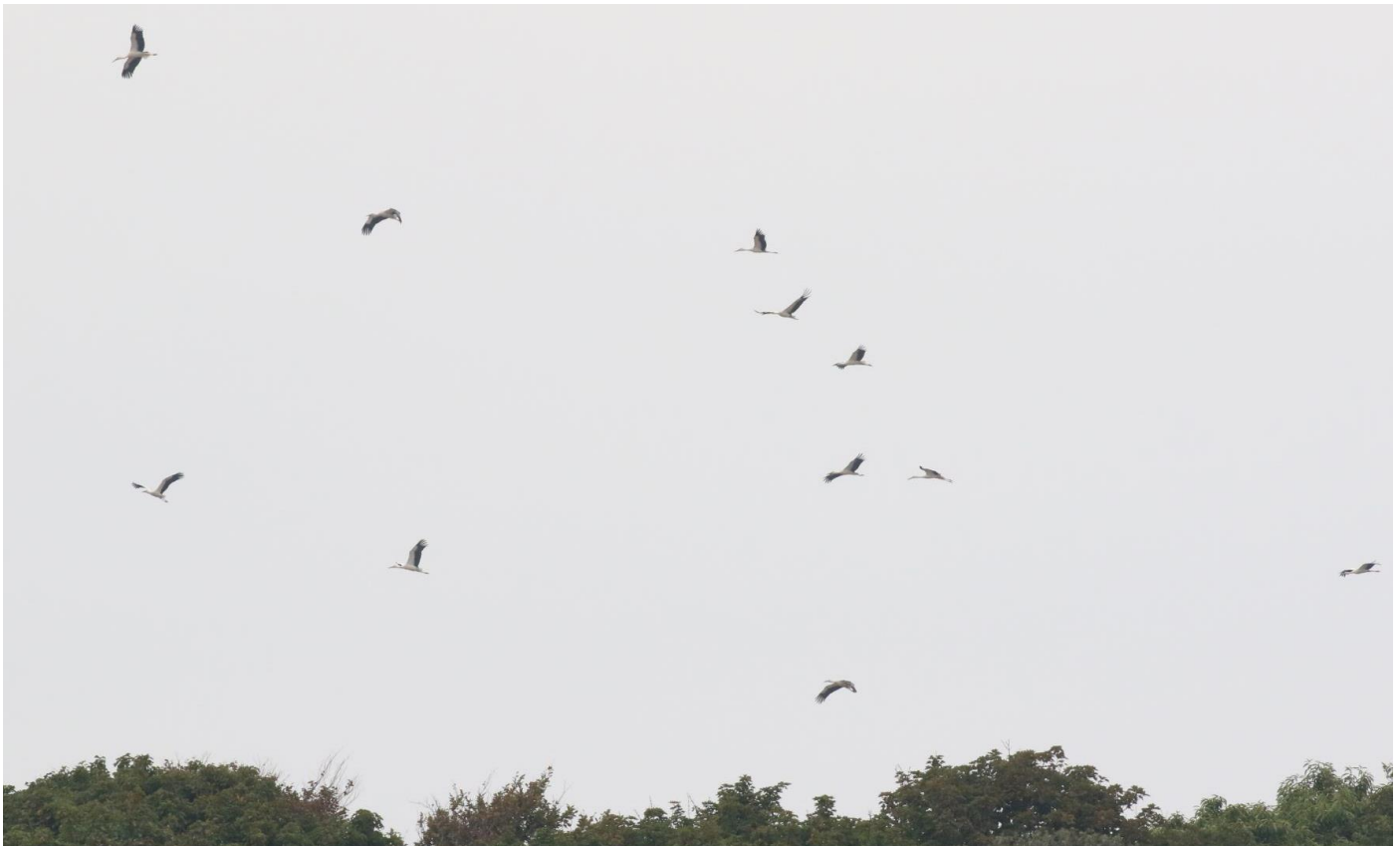
White Storks at Sandgate (Chris Powell)

A Pied Flycatcher, a Whinchat, a Wheatear and a Yellow Wagtail were at Abbotscliffe on the 28 th , when an Arctic Skua, a Fulmar and 16 Gannets flew east past Sandgate, whilst a Redstart, 2 Willow Warblers and 11 Whitethroats were at Samphire Hoe on the 29 th and a Common Sandpiper was seen at Sandgate on the 30 th .