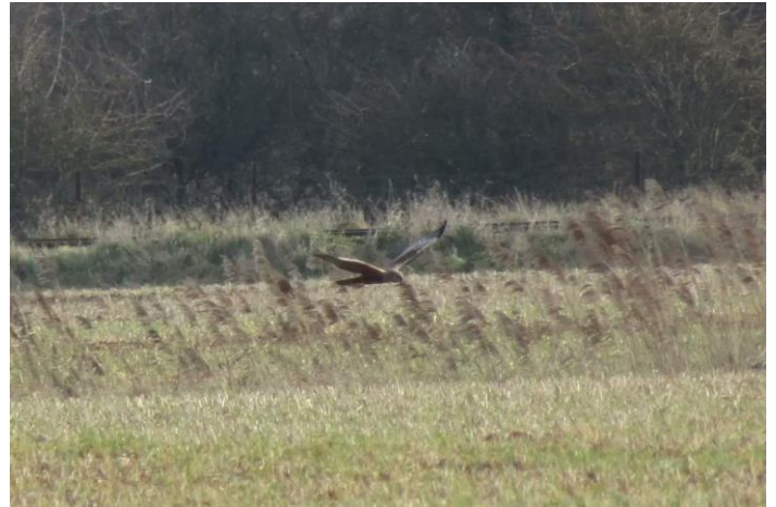
Marsh Harrier near Hoorne's Sewer