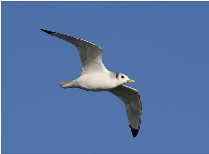
Kittiwake at Folkestone Pier

A Great White Egret was seen in the Donkey Street area on six dates and up to seven Little Egrets were roosting at Port Lympne and feeding on the marsh, with one at Copt Point on the 4 th and up to three at Samphire Hoe. An adult male Marsh Harrier was seen at Abbott's Court Farm on the 6 th and at Nickolls Quarry on the 23 rd , whilst an adult female flew high east over West Hythe dam on the 18 th . Up to three Barn Owls were present in the West Hythe dam area throughout, whilst Little Owls were noted there and at Selby Farm. A Merlin flew over Botolph's Bridge on the 23 rd .