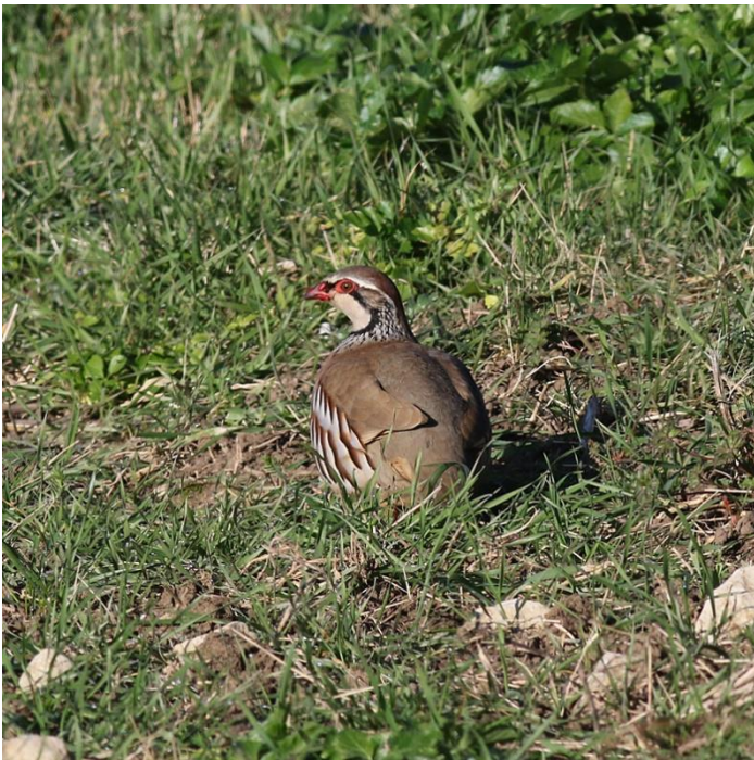
Red-legged Partridge near Pedlinge (Brian Harper)

A Grey Partridge was seen at Abbotscliffe on the 21 st , whilst Red-legged Partridges were noted at Donkey Street, Cock Ash Lake and near Pedlinge. There was an early movement of Brent Geese on the 1 st , when 95 flew east past Princes Parade and 104 flew east past Samphire Hoe, but very few were noted in the rest of the month. A flock of Greylag Geese were present at Folkestone Racecourse for much of the month and peaked at 51 on the 26 th , whilst they were joined by a Pink-footed Goose between the 22 nd and 26 th . A Greylag Goose flew west over West Hythe dam on the 13 th and up to 25 Canada Geese were seen at Nickolls Quarry. A Mute Swan in Folkestone Harbour on the 3 rd was of note, whilst a flock near Selby Farm peaked at 36 on the 5 th .