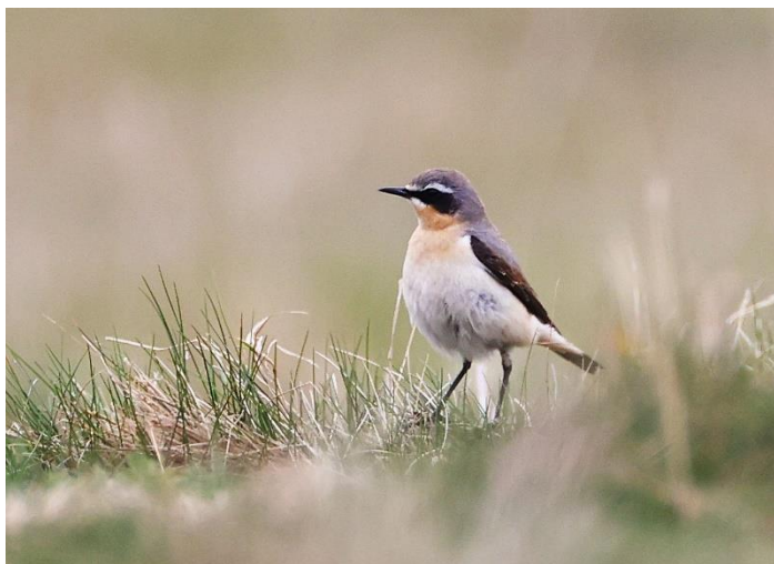
Wheatear at Samphire Hoe

There was a quiet start to the month in cool northerly and then westerly winds. There was a little visual migration on the 2 nd , when a Grey Wagtail, 5 Meadow Pipits, 11 Siskins and 206 Chaffinches flew east at Abbotscliffe and the first three Swallows of the year were seen at Nickolls Quarry, with a Wheatear at Samphire Hoe, a Black Redstart at Willop Sewage Works and Chiffchaffs continued to arrive, including eight at Nickolls Quarry.