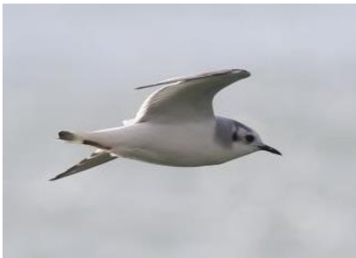
Little Gull at Nickolls Quarry

A Cattle Egret was seen with the European Bison at Port Lympne on the 25 th , with a drake Pochard on Woodside Farm pond, a Woodcock at Samphire Hoe, a House Martin, 2 Swallows and 5 Little Gulls at Nickolls Quarry, a Black Redstart and 41 Sanderling at the Willop Outfall, a Black Redstart at Folkestone Harbour, two Swallows at Abbotscliffe and 60 Fieldfares at the Aldergate Bridge.