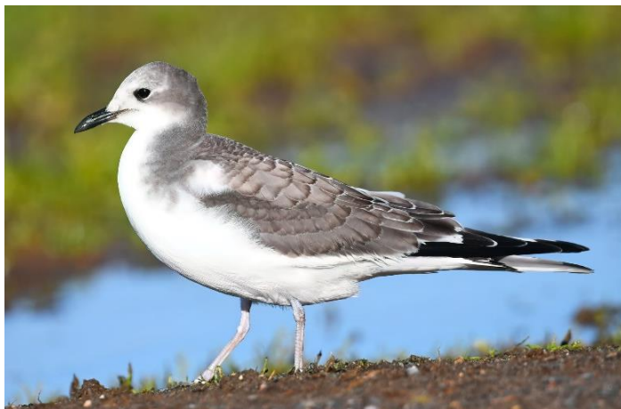
Sabine's Gull at Port Lympne (Elliot Ranford)

A Yellow-browed Warbler and a Green Sandpiper were seen at Port Lympne on the 5 th , when a 'redhead' Goosander was found at Cock Ash Lake (where it remained until the 8 th ), with 95 Fieldfares also seen there, whilst a Ring Ouzel, a Woodcock and 3 Black Redstarts were at Samphire Hoe, 6 Snipe and 15 Red-legged Partridges were at Shrine Barn, 50 Redwings and 100 Fieldfares were at Pent Farm, 6 Tree Sparrows and 10 Corn Buntings were at Botolph's Bridge, 18 Ringed Plovers were at Folkestone Beach and 9 Brent Geese flew past at sea.