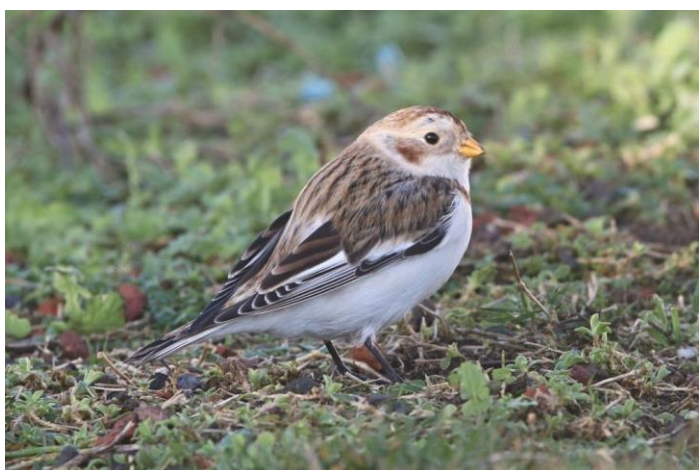
Snow Bunting at Folkestone Harbour (Rich Bonser)

Up to nine Tree Sparrows were seen in the Botolph's Bridge/Donkey Street area, whilst 30 Linnets, 32 Yellowhammer and 40 Chaffinches were at Abbotscliffe on the 21 st . Siskins were present in good numbers, with up to 39 in the Cock Ash Lake area and 79 in Chesterfield Wood. The Snow Bunting remained at Folkestone Harbour until the 9 th and there was a very noteworthy peak of 60 Corn Buntings at Botolph's Bridge on the 23 rd , where up to 30 Yellowhammers were also present.