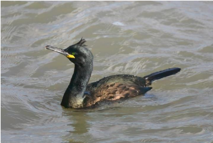
Shag at Folkestone Harbour (Elliot Ranford)

Two Reed Buntings, 13 Yellowhammers, 20 Chaffinches and 40 Linnets were logged at Abbotscliffe on the 28 th , 18 Linnets were noted at Hythe Ranges on the 26 th and up to 2 Tree Sparrows and 30 Corn Buntings remained at Botolph's Bridge.