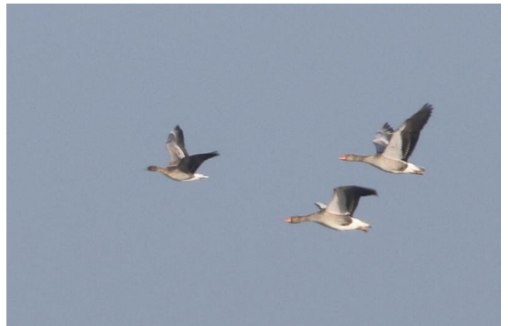
Pink-footed Goose with Greylag Geese at Folkestone Racecourse (Ian Roberts)