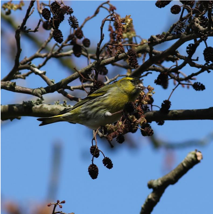
Siskin at Palmarsh (Brian Harper)

An Arctic Skua, a Red-breasted Merganser, 13 Fulmars, 33 Siskins, 47 Red-throated Divers, 90 Common Scoters and 370 Brent Geese flew past Samphire Hoe on the 16 th . The following day saw two Red Kites flying over Radnor Park and three flying over The Durlocks in Folkestone, whilst 6 Siskins and 85 Chaffinches flew east at Abbotscliffe, where a Black Redstart was singing. Eight Siskins were seen along the canal at Palmarsh on the 18 th , whilst 12 flew east at Mill Point the next day, when a Woodcock, 2 Grey Partridges and 4 Mandarin Ducks were at Kiln Wood.