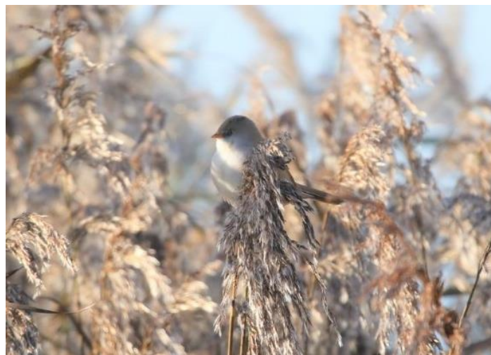
Bearded Tit at Nickolls Quarry