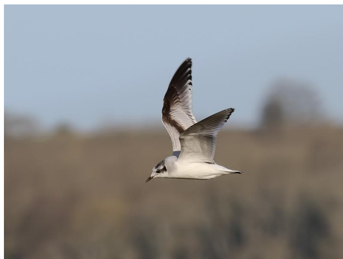
Little Gull at Botolph's Bridge

A Great White Egret was seen at Willop Sewage Works on the 4 th and 12 th , whilst single Little Egrets were noted from various sites, with two at West Hythe on the 1 st . A male Marsh Harrier was seen near Hoorne's Sewer on the 12 th . A Barn Owl was seen at the Alkham Valley road/A20 junction on the 21 st , whilst up to two Little Owls remained at Selby Farm and a Long-eared Owl was seen along Aldergate Lane on the 14 th . A Merlin was hunting Skylarks near Selby Farm on the 15 th .