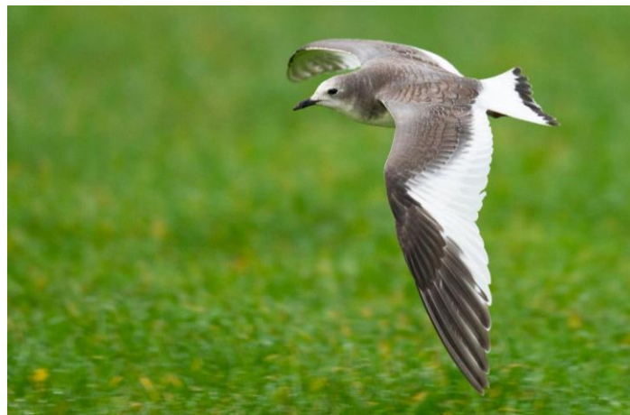
Sabine's Gull at Port Lympne