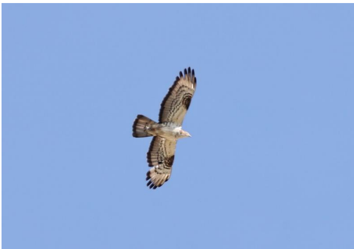
Honey Buzzard at Samphire Hoe

Hobbies were noted at Lypne Park Wood, Hythe, Church Hougham and Abbotscliffe during the month, whilst a Barn Owl was seen at West Hythe dam on the 8 th , when a Little Egret was also present there, whilst two Little Egrets flew east at Seabrook on the 16 th .