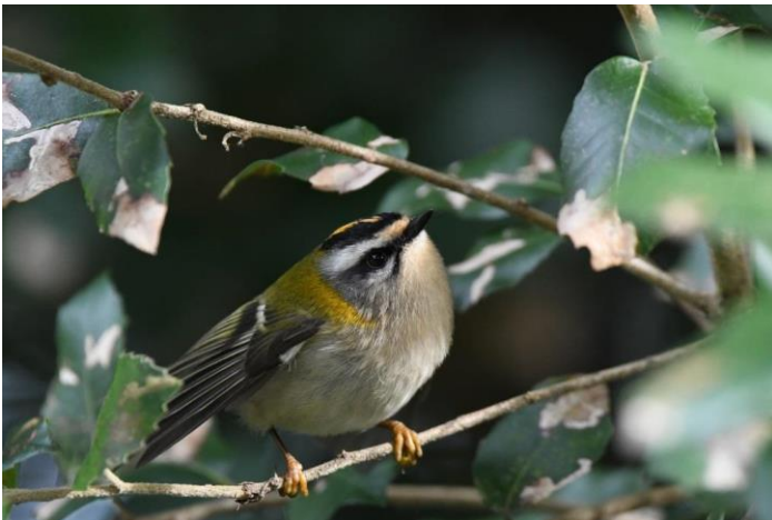
Firecrest at Enbrook Park (Elliot Ranford)