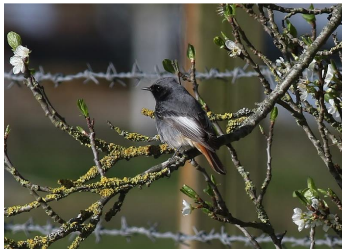
Black Redstart at Willop Sewage Works (Brian Harper)

On the 3 rd five Black Redstarts and eight Redwings were seen at Samphire Hoe, with the first three House Martins of the year and five Swallows at Nickolls Quarry the following day, and two Swallows at Folkestone Warren on the 5 th , when nine Chiffchaffs were counted at Holy Well. The first Willow Warbler of the year was at Nickolls Quarry on the 8 th , when a Red Kite flew over Lympe and a Black Redstart was seen in a garden there, whilst a Little Egret flew east at Seabrook, a Green Sandpiper was at the Willop Sewage Works, two Gadwalls were at Hoorne's Sewer and several Blackcaps and good numbers of Chiffchaffs were noted.