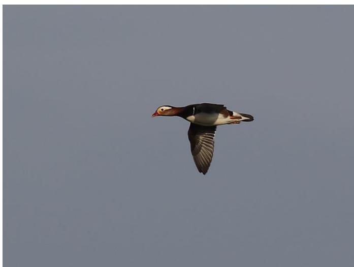
Mandarin Duck at the Willop Basin (Brian Harper)

A first-winter Little Gull lingered in the Donkey Street/Botolph's Bridge area between the 19 th and 26 th , whilst the first Lesser Black-backed Gull was noted at Nickolls Quarry on the 18 th and gull counts included 155 Mediterranean Gull at Botolph's Bridge on the 4 th and a total of 550 Common Gulls at inland sites on the 9 th . Shags were seen at Sandgate on the 3 rd and Folkestone Harbour on the 14 th .