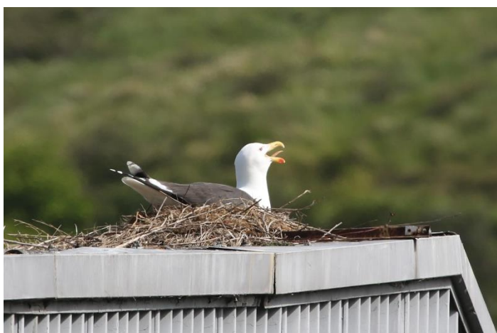
Great Black-backed Gull at Park Farm

Also of note were single pairs of Canada Goose and Oystercatcher breeding at Nickolls Quarry and Greylag Geese nesting successfully at Cock Ash Lake and Stanford. Up to 24 Tufted Ducks were also present at Cock Ash Lake, a Firecrest was singing at the American Garden on the 8 th and at least two pairs of Corn Buntings were at Abbotscliffe throughout, with up to two territorial males at Donkey Street and another along the Aldington Road.