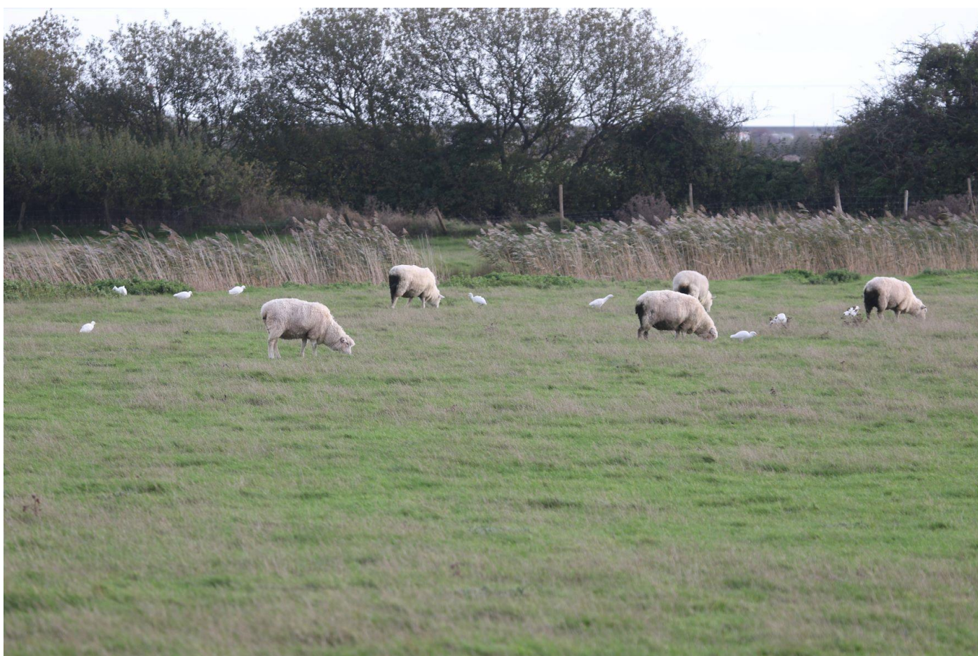
Cattle Egrets at Donkey Street/Lower Wall (Ian Roberts)

The Ring-necked Parakeet reappeared on the 14 th , when it flew east over Seabrook and was later seen feeding in a garden there, whilst 4 Redpolls, 28 Fieldfares and 152 Redwings were counted at Abbotscliffe.