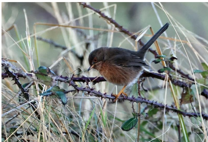
Dartford Warbler at Samphire Hoe

Single Marsh Tits were noted at Bartholomew's Wood and Bargrove Wood, whilst 28 Skylarks were counted at Abbotscliffe on the 21 st . The Dartford Warbler remained at Samphire Hoe throughout, whilst Chiffchaffs were noted at the Aldergate Bridge, West Hythe dam (two) and Willop Sewage Works (four), Blackcaps were wintering in gardens in Lympe, Hythe and Folkestone and Firecrests were seen at Enbrook Park, Castle Hill and Mill Point.