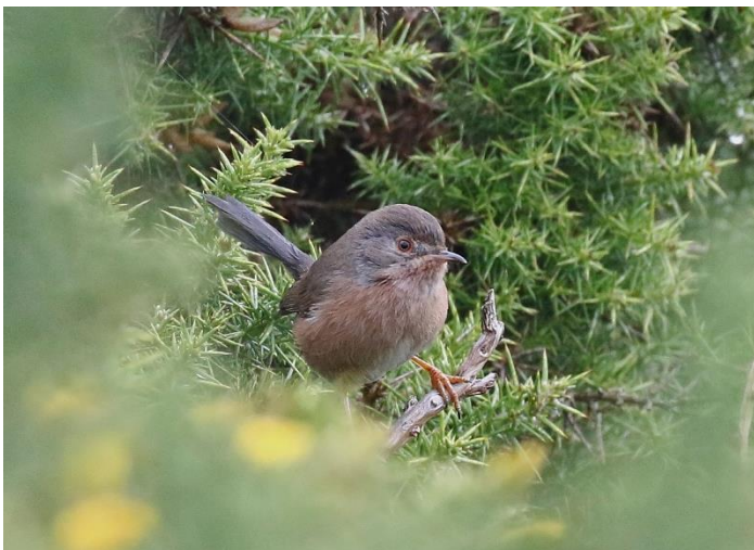
Dartford Warbler at Abbotscliffe (Chris Powell)

A Dartford Warbler and a Snipe were at Abbotscliffe on the 8 th , when a Great Spotted Woodpecker, 3 Reed Buntings, 4 Siskins, 48 Swallows and 362 House Martins flew west there and an Arctic Skua flew west at Sandgate, where 40 Starlings arrived in off the sea. The following day saw a Whinchat, 3 Blackcaps and 6 Chiffchaffs at Samphire Hoe, where 69 Brent Geese flew west, whilst an Arctic Skua was seen off Sandgate and two Shags were at Battery Point. A Black Redstart, a Grey Wagtail, 2 Redwings, 2 Siskins, 4 Reed Buntings and 14 Stonechats were at Abbotscliffe on the 10 th , when a Little Egret flew east at Seabrook and two Arctic Skuas flew past Sandgate.