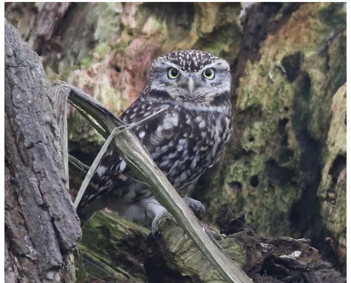
Little Owl at Selby Farm (Brian Harper)

A Long-eared Owl was seen at the Aldergate Bridge on the 8 th and a Red Kite flew over Cheriton. Two Black-necked Grebes were seen on the sea off Hythe the following day, when a Curlew, 3 Oystercatchers, 6 Shoveler and at least 710 Brent Geese flew east offshore, further Red Kites flew over Cheriton and Port Lympne, a Firecrest was at Mill Point, a Woodcock was at Aldergate Lane and Chiffchaffs continued to arrive in small numbers. 75 Brent Geese flew east past Seabrook on the 10 th . A Shelduck, 2 Wigeon, 17 Teal, 18 Shoveler, 19 Pintail, 25 Red-throated Divers, c.200 Gannets and c.320 Brent Geese flew east past Mill Point the next day.