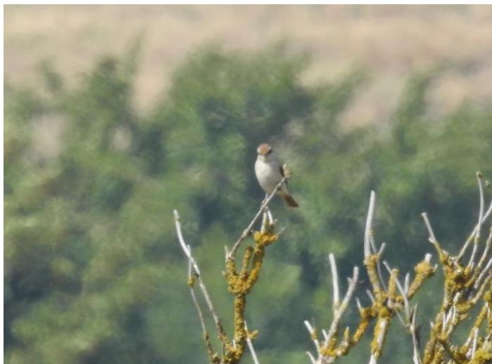
Red-backed Shrike at Hythe Ranges (Sean McMinn)

On the 11 th , a Redstart, a Spotted Flycatcher and 2 Wheatears were at Hythe Ranges, where 3 Grey Wagtails and 40 Meadow Pipits flew south, a Wheatear, a Siskin, a Reed Bunting, 3 Tree Pipits, 4 Whinchats, 5 Whitethroats and 16 Blackcaps were at Abbotscliffe, a Redshank, a Yellow Wagtail, 2 Wheatears, 2 Willow Warblers, 4 Whinchats, 8 Little Egrets, 15 Chiffchaffs, 19 Stonechats and 50 Blackcaps were at Samphire Hoe and single Spotted Flycatchers were seen at Grove Road in Folkestone and at Folkestone Warren.