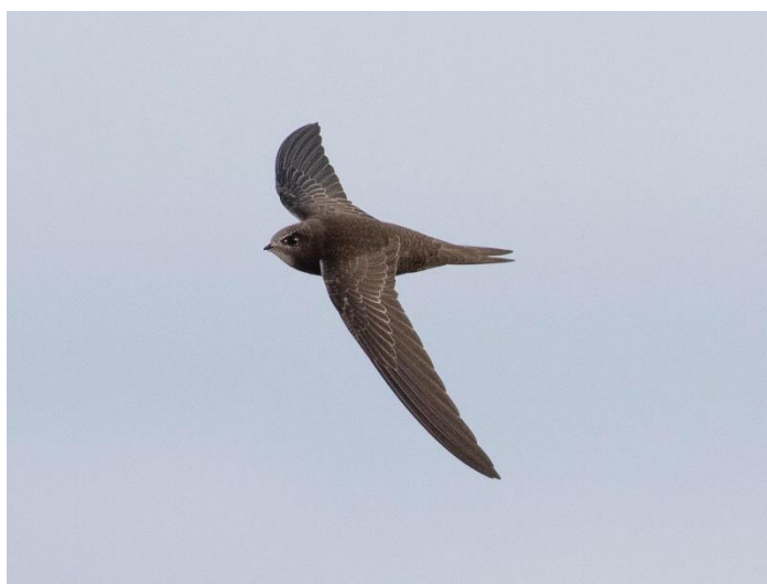
Swift at Round Down (Jamie Partridge)

A first-winter Caspian Gull , a Common Tern, 4 Shags, 8 Sandwich Terns and 85 Lesser Black-backed Gulls were seen at Sandgate on the 21 st , when a Marsh Harrier, 2 Yellow Wagtails, 2 Lesser Whitethroats, 4 Reed Buntings, 11 Stonechats, 13 Blackcaps, 61 Meadow Pipits and 158 Swallows were at Abbotscliffe, where 100 Starlings arrived in off the sea, two Shags and 13 Chiffchaffs were at Mill Point and a Razorbill was seen off Hythe.