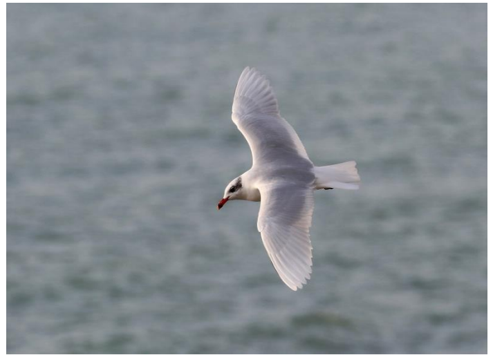
Mediterranean Gull at Folkestone Harbour