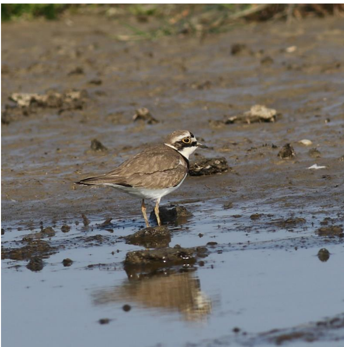
Little Ringed Plover at the Willop Sewage Works