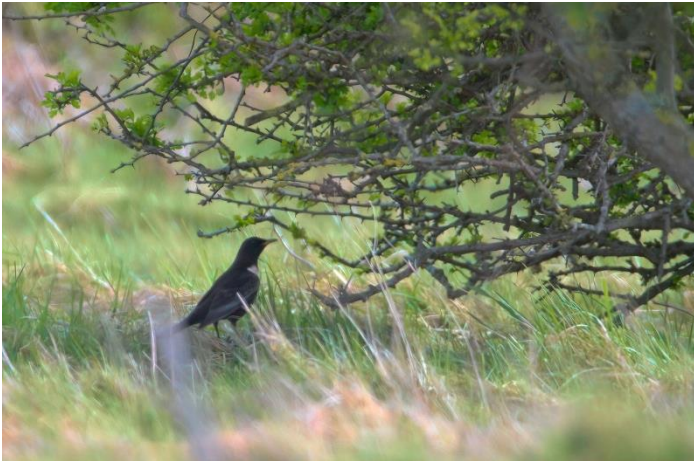
Ring Ouzel at Abbotscliffe (Elliot Ranford)

The first Yellow Wagtail of the year flew in off the sea at Abbotscliffe on the 13 th , with two Swallows, the first three Whitethroats of the year and three Willow Warblers also of note there, whilst another Whitethroat was singing along Botolph's Bridge Road. The first Reed Warbler of the year was singing at Aldergate Lane the following day, when the first two Sedge Warblers and a Willow Warbler were at Nickolls Quarry, a male Ring Ouzel, a Whimbrel and a Black Redstart were at Abbotscliffe, a Yellow Wagtail and 68 Sanderling were at the Willop Outfall, two Green Sandpipers were at Botolph's Bridge and Swallows and Whitethroats continued to arrive.