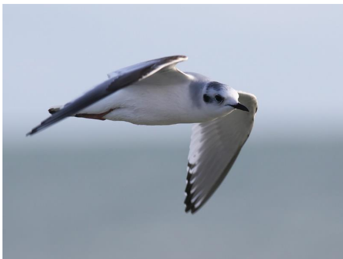
Little Gull at Princes Parade (Brian Harper)