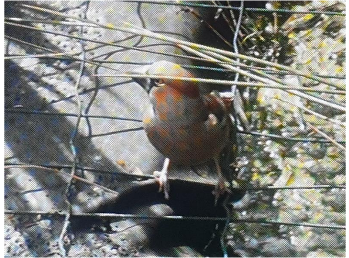
Hawfinch at Folkestone (John Tomlinson)

The first Swift of the year was at Nickolls Quarry on the 28 th , when a Green Sandpiper was at Cherry Garden Reservoirs and six Swallows arrived in off the sea at Seabrook. A Nightingale was singing at West Hythe the following day, when a Great Skua and 13 Whimbrel flew east past Mill Point and 68 Swallows arrived in off the sea there, whilst the first Garden Warbler of the year was at Bluehouse Wood on the 30 th .