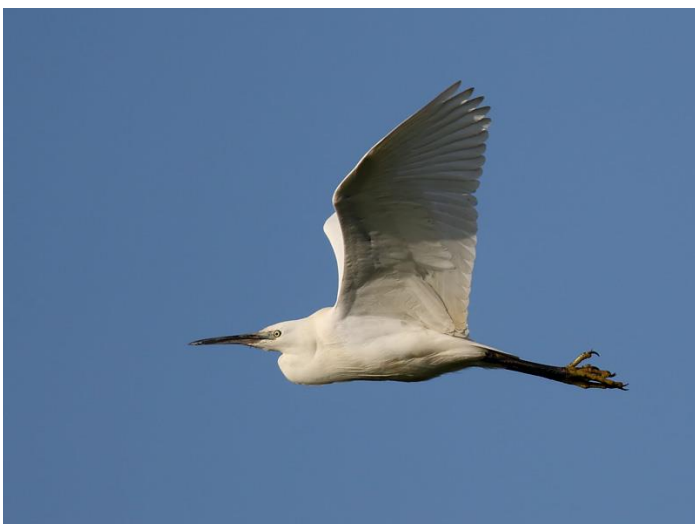
Little Egret at Donkey Street (Brian Harper)