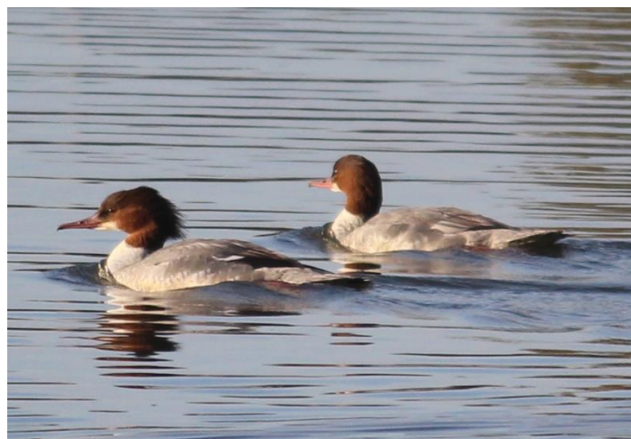
Goosanders at Cock Ash Lake (Tony Poole)