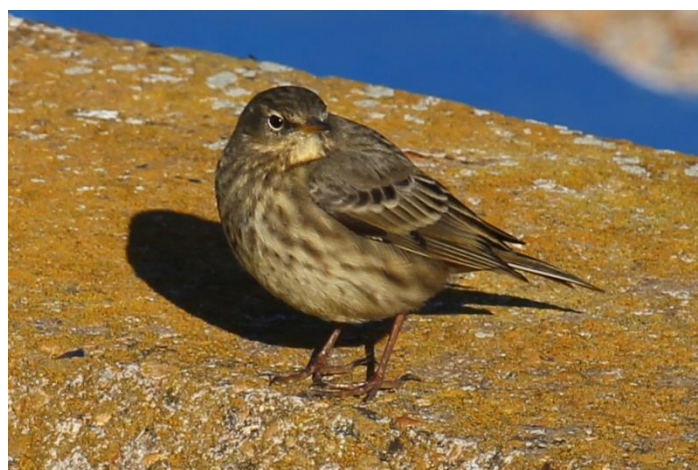
Rock Pipit at Folkestone Pier (Tony Poole)