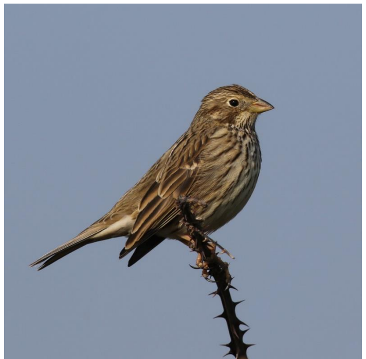
Corn Bunting at the Willop Sewage Works (Brian Harper)