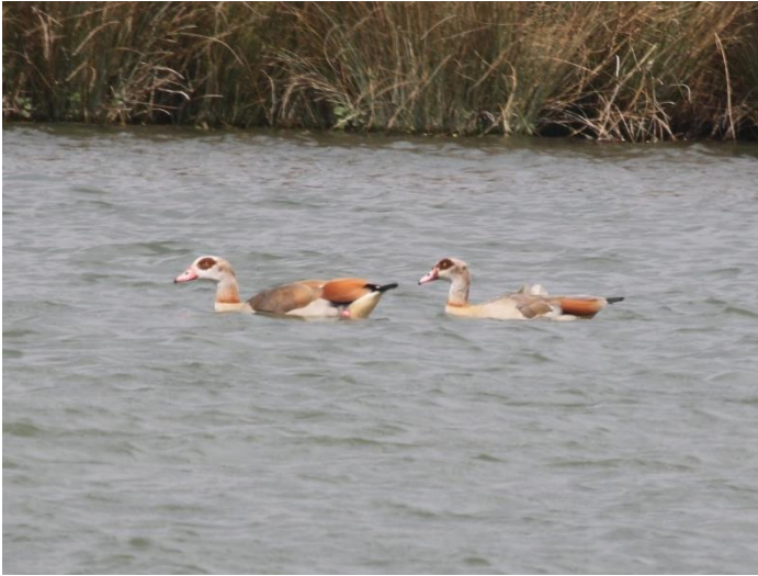
Egyptian Geese at Cock Ash Lake (Ian Roberts)

The first Sand Martin, 2 House Martins and 5 Swallows were at Nickolls Quarry on the 25 th , when a Hobby was seen at Kiln Wood, whilst the next day saw three Wheatears at Samphire Hoe and 6 Bar-tailed Godwits, 9 Oystercatchers and 14 Whimbrels flying east past Mill Point. On the 27 th three Common Terns, 11 Whimbrels and 20 Sandwich Terns flew east past Mill Point and eight Swallows arrived in off the sea there, a Hobby, 3 House Martins, 5 Sand Martins and 8 Swallows were at Nickolls Quarry and 2 Whimbrel, 2 Wheatears and 8 House Martins were at Samphire Hoe.