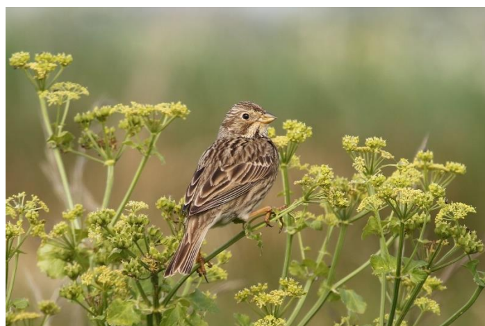
Corn Bunting at Abbotscliffe (Ian Roberts)