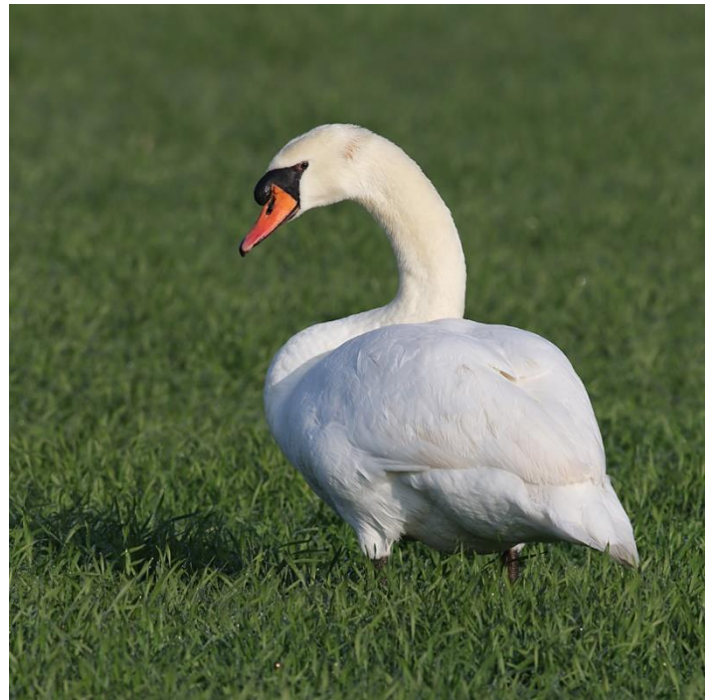
Mute Swan at the Willop Sewage Works