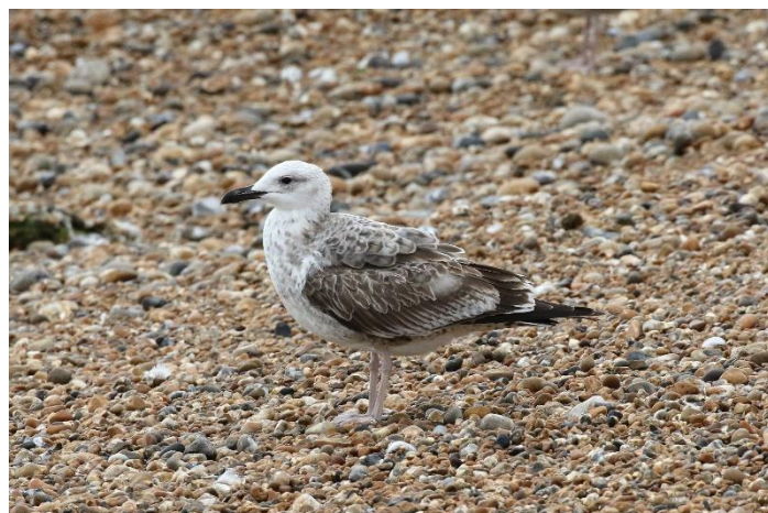
Caspian Gull at Sandgate

A Firecrest, 2 Goldcrests and 17 Chiffchaffs were at Enbrook Park on the 27 th , when a Hobby, 10 Meadow Pipits and 154 House Martins flew west at Sandgate. The 28 th produced a Grasshopper Warbler, 6 Siskins and 16 Reed Buntings at Abbotscliffe and 28 Chaffinches arrived in off the sea there, whilst nine Grey Herons flew out to sea from Sandgate on the 29 th and c.250 Swallows flew east there.