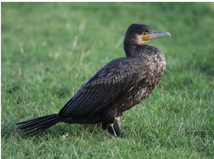
Cormorant at Botolph's Bridge (Brian Harper)