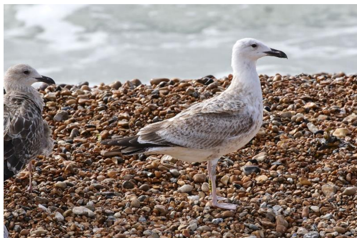
Caspian Gull at Sandgate

The fifth Great White Egret of the month was seen arriving in off the sea at Copt Point on the 25 th , when 2 Razorbills and 3 Shags were seen off Mill Point, whilst a Ring-necked Parakeet flew east at Seabrook the following day, when a new (German-ringed) first-winter Caspian Gull and 89 Lesser Black-backed Gulls were at Sandgate, where a Sand Martin, 56 Swallows and 151 House Martins flew west, and three Firecrests were at Enbrook Park.