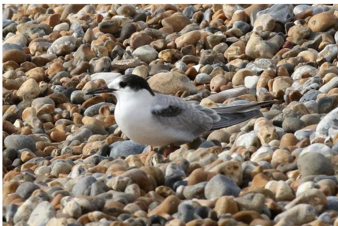
Common Tern at Sandgate (Chris Powell)

A Woodlark was found at Hythe Ranges on the 22 nd , when three Bramblings were seen in a mixed finch flock at Shrine Barn and a Black Swan was an unusual sight in Folkestone Harbour. Two Velvet Scoter and 83 Gannets flew east past Samphire Hoe the next day, when 3 Blackcaps, 4 Little Egrets, 4 Firecrests and 7 Goldcrests were at Holy Well and a Firecrest was in a garden in Folkestone, with two there on the 24 th . A Wheatear was at Samphire Hoe on the 25 th .