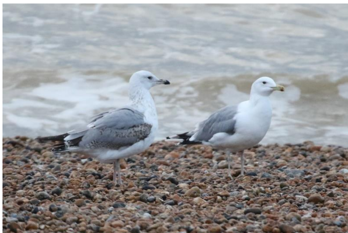
Caspian Gulls at Sandgate