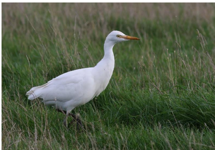
Cattle Egret at Lower Wall (Brian Harper)

The 12 th saw a small arrival of Black Redstarts, with singles at Hythe, Mill Point and Abbotscliffe, whilst a Jack Snipe was at Donkey Street, a Blackcap was seen in a garden in Folkestone and a Sand Martin and 4 Swallows were at Nickolls Quarry, with further Swallows at Abbotscliffe (3) and the Willop Basin (3). Three Dartford Warblers were seen at Abbotscliffe on the 13 th , where a Redpoll, 2 Siskins, 5 Goldcrests, 6 Corn Buntings and 7 Reed Buntings were also noted, whilst there was a marked increase in thrushes (with 8 Fieldfares, 15 Blackbirds, 18 Song Thrushes and 28 Redwings) and Robins (34) there. Elsewhere, a 'redhead' Goosander, a drake Gadwall and 3 Swallows was seen at Botolph's Bridge and two 'redhead' Goosanders were present at Cock Ash Lake, whilst a Shoveler and a Golden Plover were seen at Donkey Street, a Woodcock was at Capel-le-Ferne, a Firecrest was at Samphire Hoe and 15 Sandwich Terns were at Hythe Ranges.