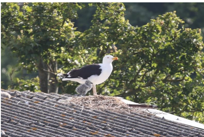
Great Black-backed Gulls at Park Farm (Ian Roberts)

The pair of Great Black-backed Gulls at the Park Farm industrial estate successfully raised two young, whilst surprises during June included the discovery of a pair of Spotted Flycatchers nesting at Bartholomew's Wood (the first successful local breeding since 2009) and two recently fledged Long-eared Owls at West Hythe (only the second confirmed instance of local breeding). A Black Redstart holding territory at Dollands Moor (near Frogholt) was also of note.