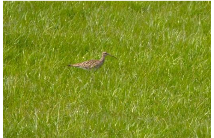
Whimbrel at Abbotscliffe (Elliot Ranford)

The 15 th saw a further Ring Ouzel, a Whimbrel, a Redwing, 2 Willow Warblers and six Whitethroats at Abbotscliffe, where a Great Spotted Woodpecker flew west. Two Egyptian Geese were found at Cock Ash Lake on the 16 th (where they remained until the month's end), whilst two Gadwall and four Tufted Ducks were also noted there.