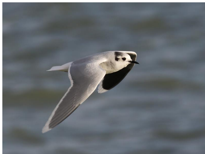
Little Gull at Princes Parade (Brian Harper)

A Little Gull was seen off Hythe on the 26 th , when six Little Gulls were at Nickolls Quarry and 24 Turnstones were counted at the Stade Street groyne. On the 27 th a Black Redstart was at Mill Point, two Green Sandpipers were at Nickolls Quarry and three Little Gulls were seen off Princes Parade.