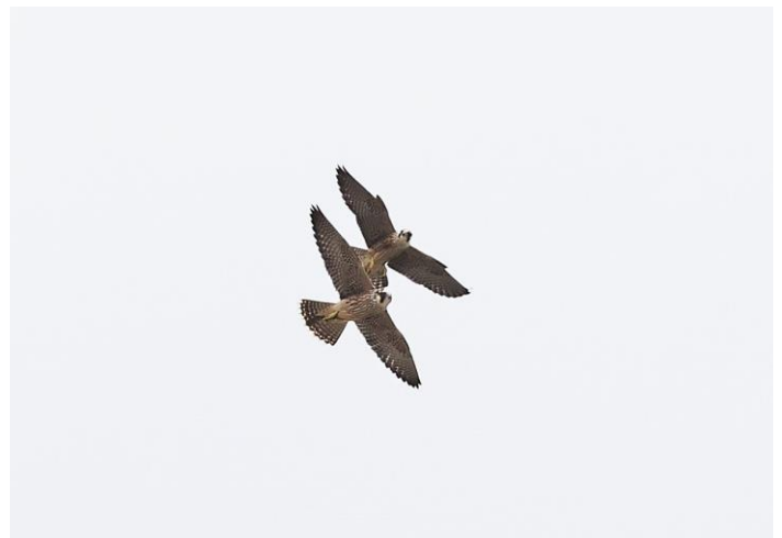
Peregrines at Samphire Hoe (Dave Clarke)

At least one Turtle Dove (possibly two) were seen in Church Hougham churchyard on the 22 nd and a juvenile Black Redstart in a garden in Seabrook on the 28 th was presumably locally bred. A juvenile Coot on the sea off Battery Point on the 24 th was an unusual record.