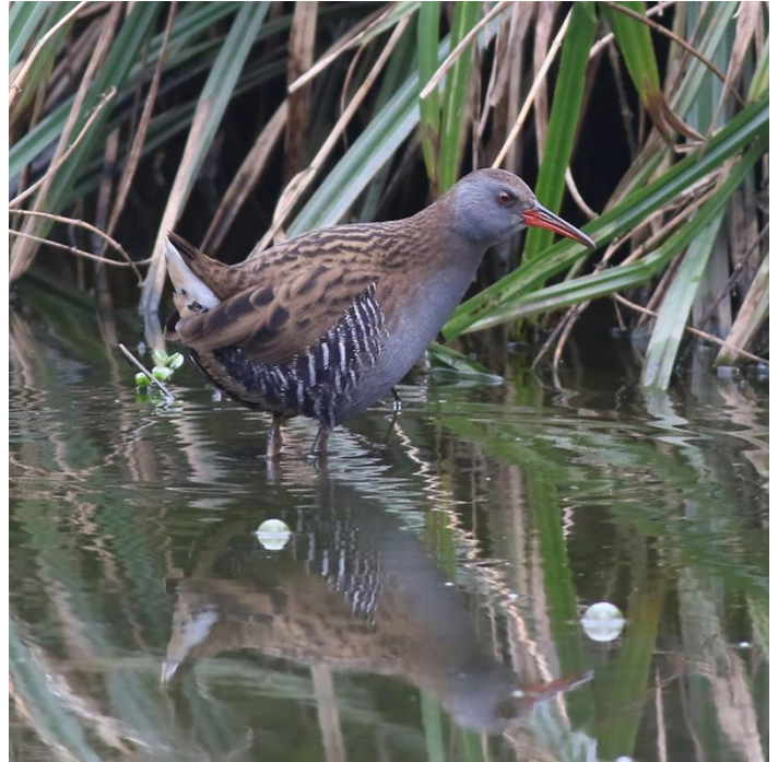
Water Rail at Enbrook Park (Brian Harper)