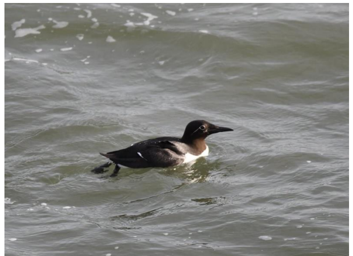
Guillemot at Folkestone Harbour