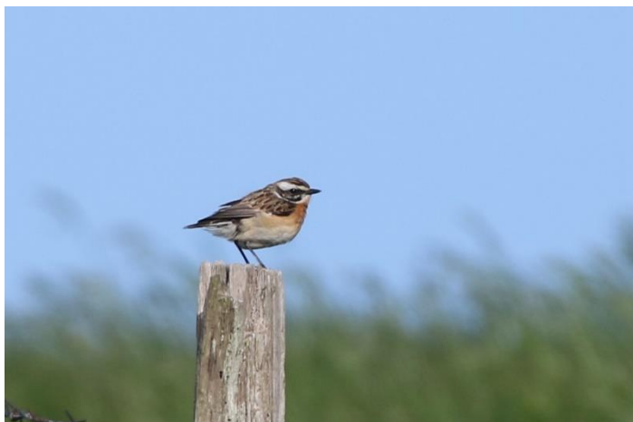
Whinchat at Abbotscliffe (Ian Roberts)

A Golden Oriole was seen along Crete Road West on the 19 th , before it flew north, and a Spotted Flycatcher and a Garden Warbler were also noted there, whilst a late migrant Reed Warbler was singing at Abbotscliffe the following day. A pair of Mandarin Ducks flew over Gibbin's Brook on the 21 st and a Turtle Dove was reported along the canal at Hythe the next day.