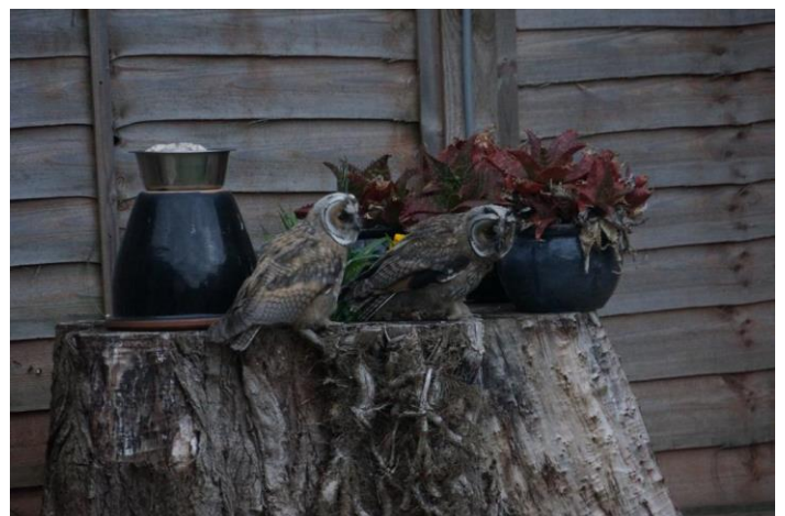
Long-eared Owls at West Hythe