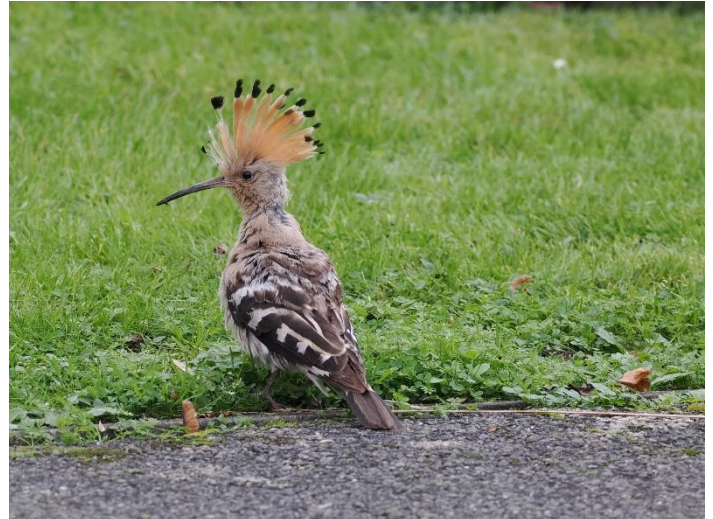
Hoopoe at Lympe (Barry Wright)

Cooler conditions on the Continent led to some notable movements locally, beginning with a Golden Plover and 30 White-fronted Geese flying south over Samphire Hoe on the 18 th , and the following day saw a Goosander, a Red-breasted Merganser, 3 Sandwich Terns, 3 Shelduck, 5 Razorbills, 7 Gadwall, 8 Wigeon, 59 Teal and 84 Brent Geese flying west at sea and 30 Lapwings arriving in off. Also of note were a Snow Bunting flying west at Abbotscliffe, a Golden Plover and 2 Jack Snipe in the Donkey Street area, a Tufted Duck off the Willop Outfall and Black Redstarts at the Hythe Redoubt and the Willop Outfall, whilst Swallows lingered at Nickolls Quarry (5) and West Hythe (7).