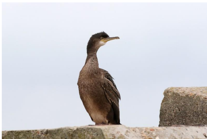
Shag at Folkestone Harbour (Chris Powell)

A juvenile Sabine's Gull was glimpsed at Port Lympne on the 27 th (but later showed exceptional well in early November). Two House Martins and 1,645 Mediterranean Gulls were at Copt Point the next day, when five Firecrests were at Enbrook Park, whilst on the 29 th a Reed Bunting, a Grey Wagtail, a Siskin and 5 Redpolls flew over Abbotscliffe. A Dartford Warbler , 2 Siskins and 4 Reed Buntings were seen there the following day, when two Grey Wagtails flew west, whilst the month ended with 10 Sandwich Terns and 1,159 Mediterranean Gulls off Mill Point /Sandgate.