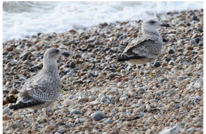
Yellow-legged Gull at Sandgate

A Dartford Warbler and a Snipe were at Abbotscliffe on the 8 th , when a Great Spotted Woodpecker, 3 Reed Buntings, 4 Siskins, 48 Swallows and 362 House Martins flew west there and an Arctic Skua flew west at Sandgate, where 40 Starlings arrived in off the sea. The following day saw a Whinchat, 3 Blackcaps and 6 Chiffchaffs at Samphire Hoe, where 69 Brent Geese flew west, whilst an Arctic Skua was seen off Sandgate and two Shags were at Battery Point. A Black Redstart, a Grey Wagtail, 2 Redwings, 2 Siskins, 4 Reed Buntings and 14 Stonechats were at Abbotscliffe on the 10 th , when a Little Egret flew east at Seabrook and two Arctic Skuas flew past Sandgate.