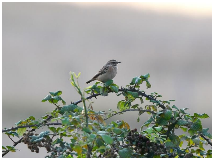
Whinchat at Abbotscliffe (Elliot Ranford)

A Swift flew over Hythe on the 14 th , whilst the next day saw a Swift, 3 Yellow Wagtails, 6 Grey Wagtails, 112 Sand Martins, 292 Meadow Pipits, c.1,000 Swallows and c.3,000 House Martins flying east at Abbotscliffe, whilst a Whinchat was also noted there. A further Swift, 3 Yellow Wagtails, 3 Grey Wagtails and 130 Meadow Pipits flew over Abbotscliffe on the 16 th , when a Mute Swan was seen on the sea off Sandgate and 14 Chiffchaffs were at Mill Point. Seven Brent Geese flew east at Seabrook on the 17 th .