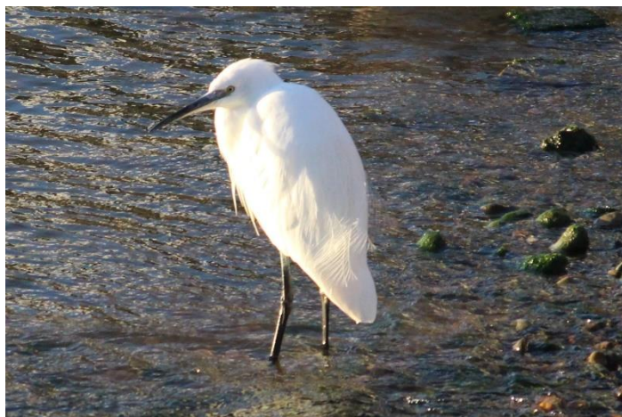
Little Egret at Folkestone Harbour (Tony Poole)