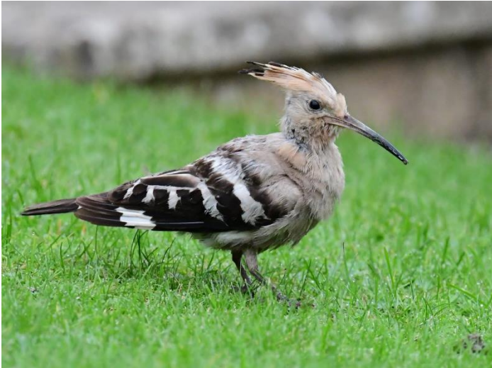
Hoopoe at Lympe

On the 15 th two Fulmars, 3 Little Gulls, 21 Sandwich Terns and 31 Common Scoter flew west past Mill Point, whilst a Sand Martin and 5 Swallows were at Nickolls Quarry the next day. A Hoopoe was found in Lympe on the 17 th , where it remained until the 22 nd and proved to be a popular attraction, although it could be elusive at times. Elsewhere, a Dunlin and three Sandwich Terns flew past Princes Parade, 13 Sanderlings were seen on Dymchurch Beach, 55 Lapwings were at the Willop Basin and a Sand Martin and 6 Swallows were at Nickolls Quarry (this was the final sighting of Sand Martin and was by far the latest ever occurrence. There had only been three previous records in November, all on the 4 th , at Hythe in 1963, West Hythe in 1981 and at Abbotscliffe in 2020, whilst this year produced sightings at Nickolls Quarry on five later dates). Swallows also remained into November in exceptional numbers, a reflection no doubt of the unusually mild conditions.