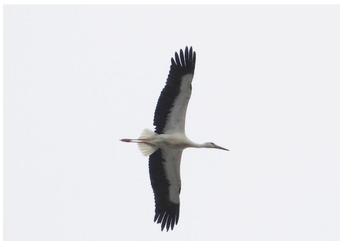
White Stork at Cheriton (Mike Linklater)

A Little Egret flew east over Seabrook on the 20 th , when 37 Gannets flew west past Sandgate and at least one juvenile Hobby was seen at Lympne Park Wood (with two there on the 23 rd ). The 21 st produced a Redstart, a Spotted Flycatcher, a Yellow Wagtail, 2 Willow Warblers and 2 Reed Buntings at Abbotscliffe, a Green Sandpiper and 2 Willow Warblers along the canal at Seabrook and a Common Sandpiper at Folkestone Harbour. On the 22 nd a Hobby, a Tree Pipit, a Whinchat, a Spotted Flycatcher, a Garden Warbler, a Reed Warbler, a Sedge Warbler, 2 Sand Martins, 5 Lesser Whitethroats, 6 Blackcaps, 7 Willow Warblers and 15 Whitethroats were at Abbotscliffe, a Spotted Flycatcher, 4 Willow Warblers and 12 Crossbills were at Lympne Castle and a juvenile Hobby was seen at Seabrook.