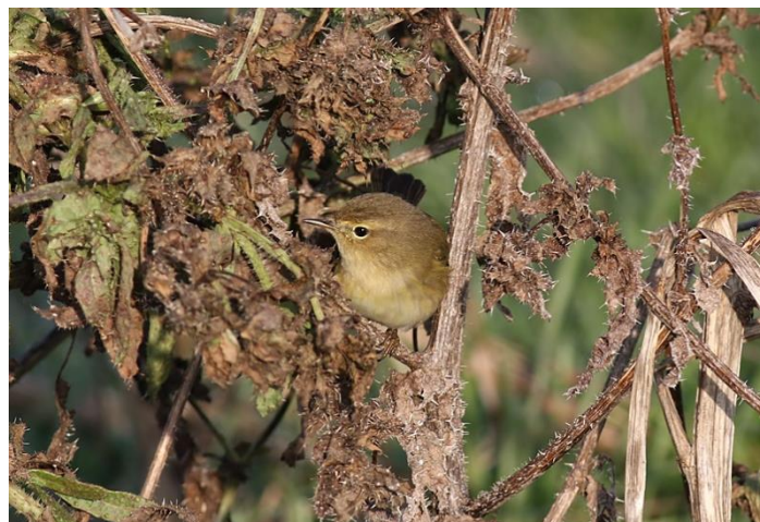
Chiffchaff at the Willop Sewage Works (Brian Harper)

Winter thrush numbers were low with Fieldfares noted in just scattered ones and twos and the only double-figure counts of Redwings were 13 at West Hythe dam on the 3 rd , 13 arriving in off the sea at Seabrook on the 4 th and ten at Cock Ash Lake the following day, but 23 Song Thrushes were counted at West Hythe dam on the 6 th . A Black Redstart remained at Samphire Hoe throughout, whilst up to nine Stonechats were noted there, with two at the Willop Basin and singles at West Hythe dam, Nickolls Quarry and Cheriton Hill.