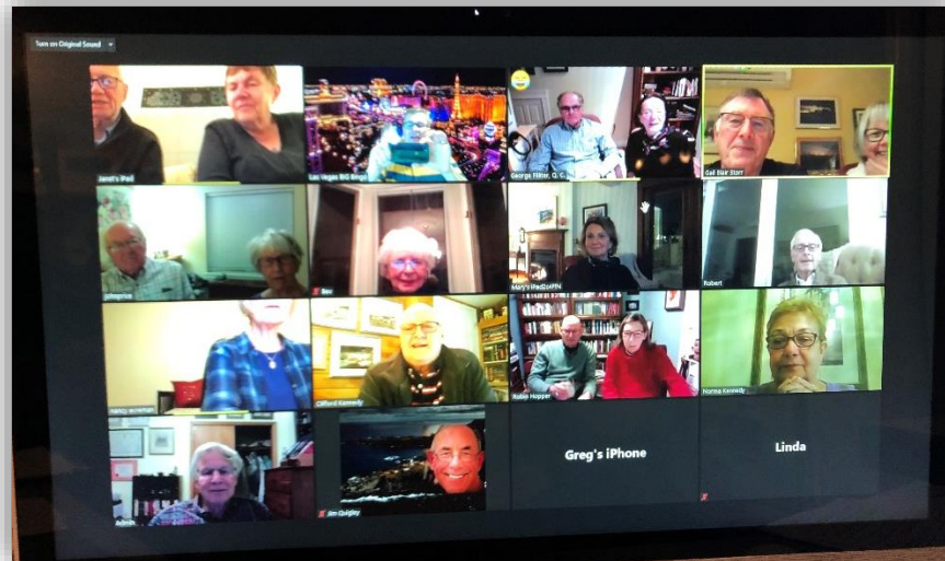
Photo of our January Game Night