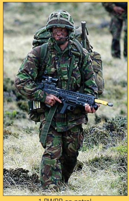
1 PWRR on patrol

The last 6 months have been both busy and exciting for the 1st Battalion. The highlights have been a deployment to the Falklands and a testing collective training exercise with some sporting success thrown in for good measure.