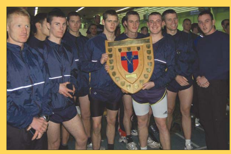
1 PWRR cross country runners hold the trophy