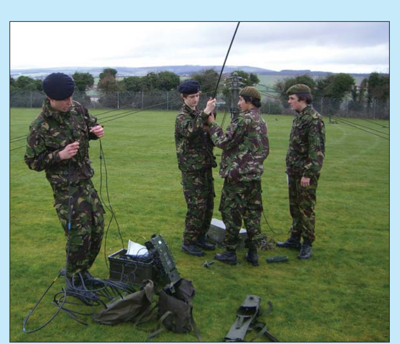
Signals team get to grips with the antenna

After a period of inactivity in the early part of 2008, there followed a month or so with three training activities in quick succession. Firstly, towards the end of February, a team of four cadets travelled to the Royal School of Signals at Blandford to take part in the first ever Cadet Signals Competition. Along with 15 other teams from CCFs, ACFs and ATCs across the country, including Dollar Academy all the way from Scotland, they completed a series of stands - some practical, some more mentally demanding - designed to test their signalling expertise, together with an orienteering and march & shoot (using the DCCT). Though not particularly successful (12th overall), it was nevertheless judged to be time well spent, and the competition is likely to become an annual event. A week later a party of 47 (thirty of whom were recruits) travelled to St Martin's Plain Camp for a Weekend Exercise. This comprised a morning of range shooting at Hythe, plus use of the DCCT and practise in patrolling