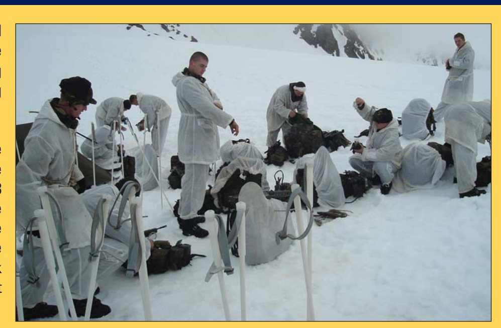
Members of 6 Platoon on South Georgia