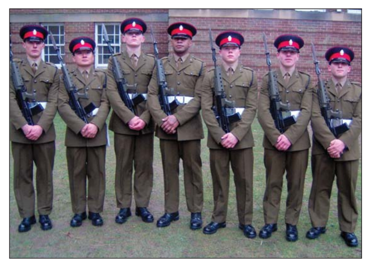
Pass Out Parade

The Infantry Training Centre Catterick trains all recruits for phase I and phase II. The total period is now 26 weeks, this will include tactics, weapon training, bayonet fighting and drill to name a few. The recruits passing through are mixed from an age group of 17yrs to 32 yrs. The latter being maximum age. Experience has shown that the transition from