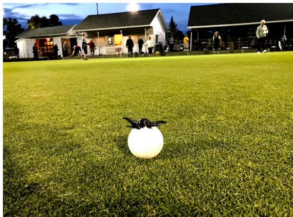
It wouldn't be a Spider without a "spider".