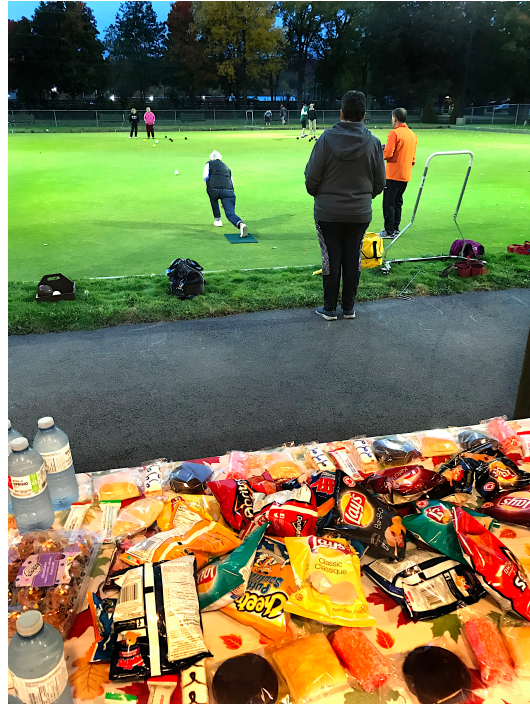
Munchies lie in wait for bowlers to complete their fun games during the club's final social night of the season.

Now, as the summer comes to a close and early autumn arrives, we have to close the books on what was certainly less than our usual season but it felt like a full year, one which left all who enjoyed this summer of bowling with special memories to see us through a winter of who-knows-what.