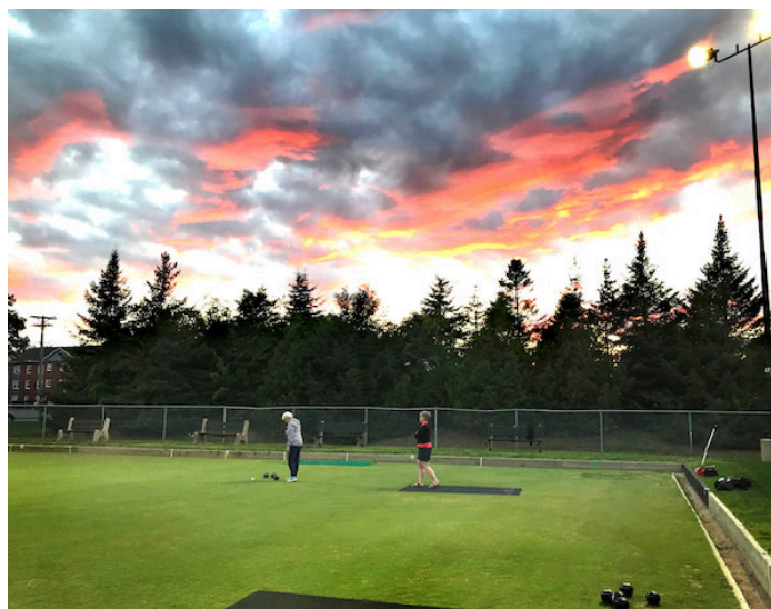
A striking sunset closes the season over the green of the Fredericton Lawn Bowling Club.