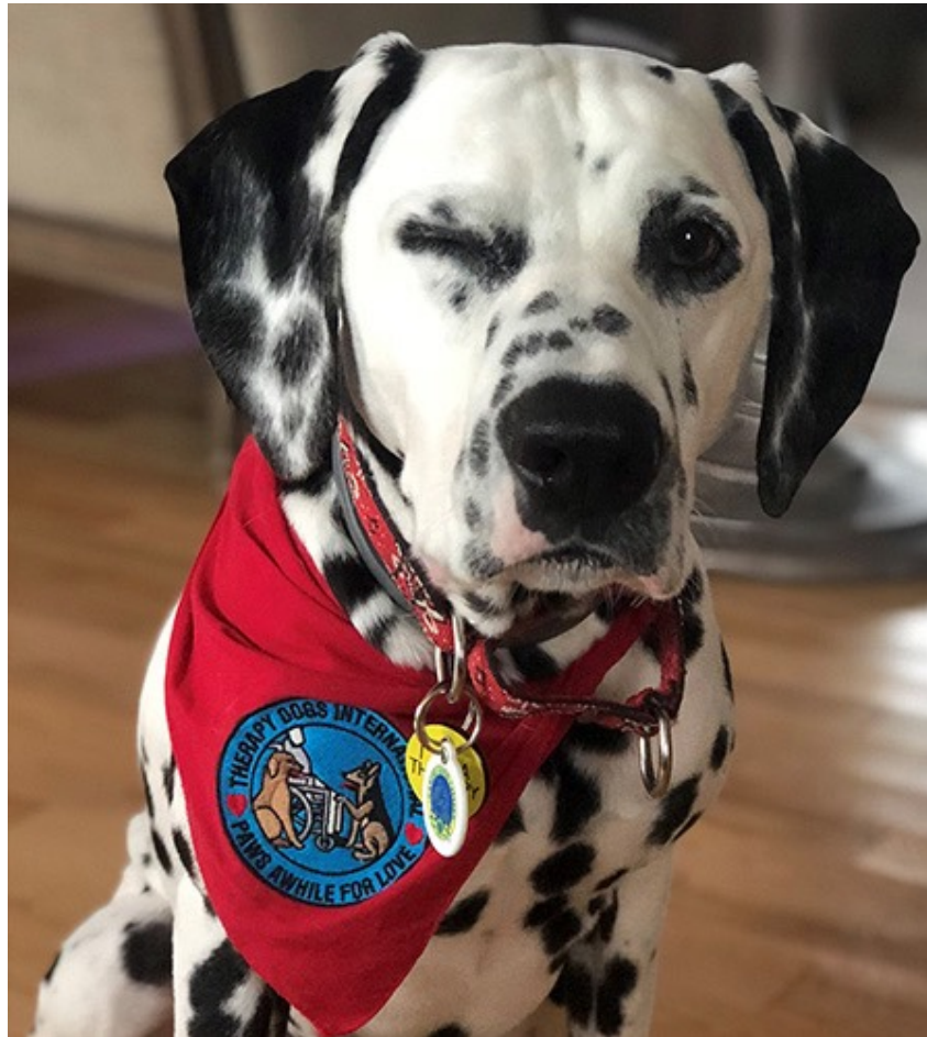
Above: CH Yankee Sebago & Patch Mt Miles To Go Monson TDIA THDA CGC CGCU RN