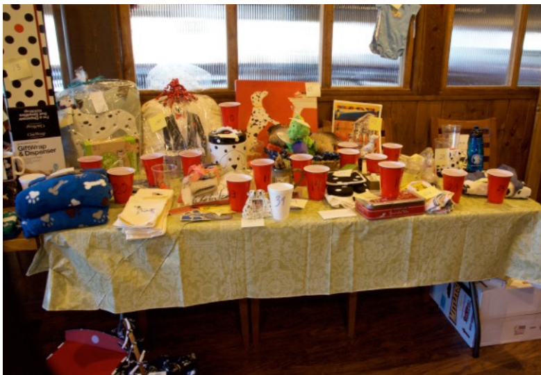
Above : DCSNE exceptional raffle table!