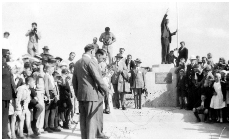
Right: Official opening of the Bridge