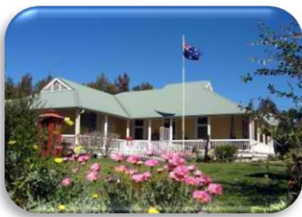
The Old Courthouse Museum