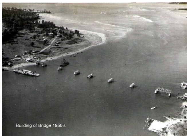
Left: Laying the foundations